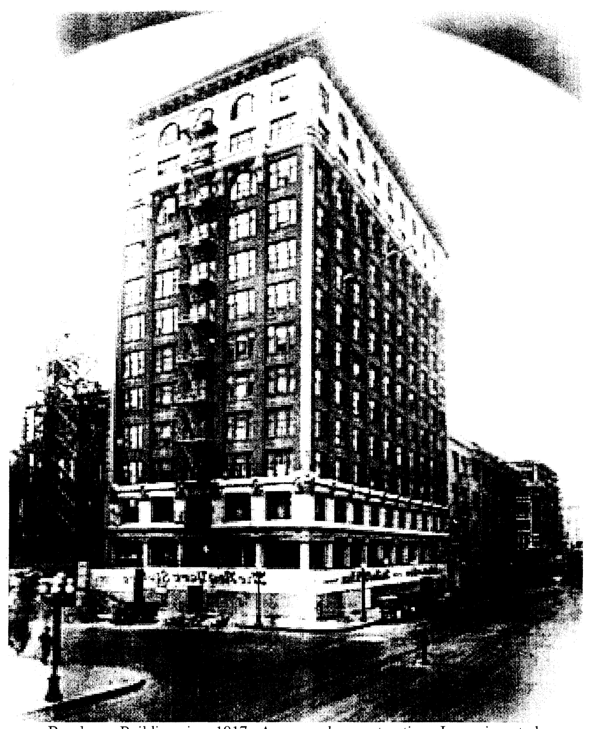
Brockman Building circa 1917. Annex under construction. Image inverted.