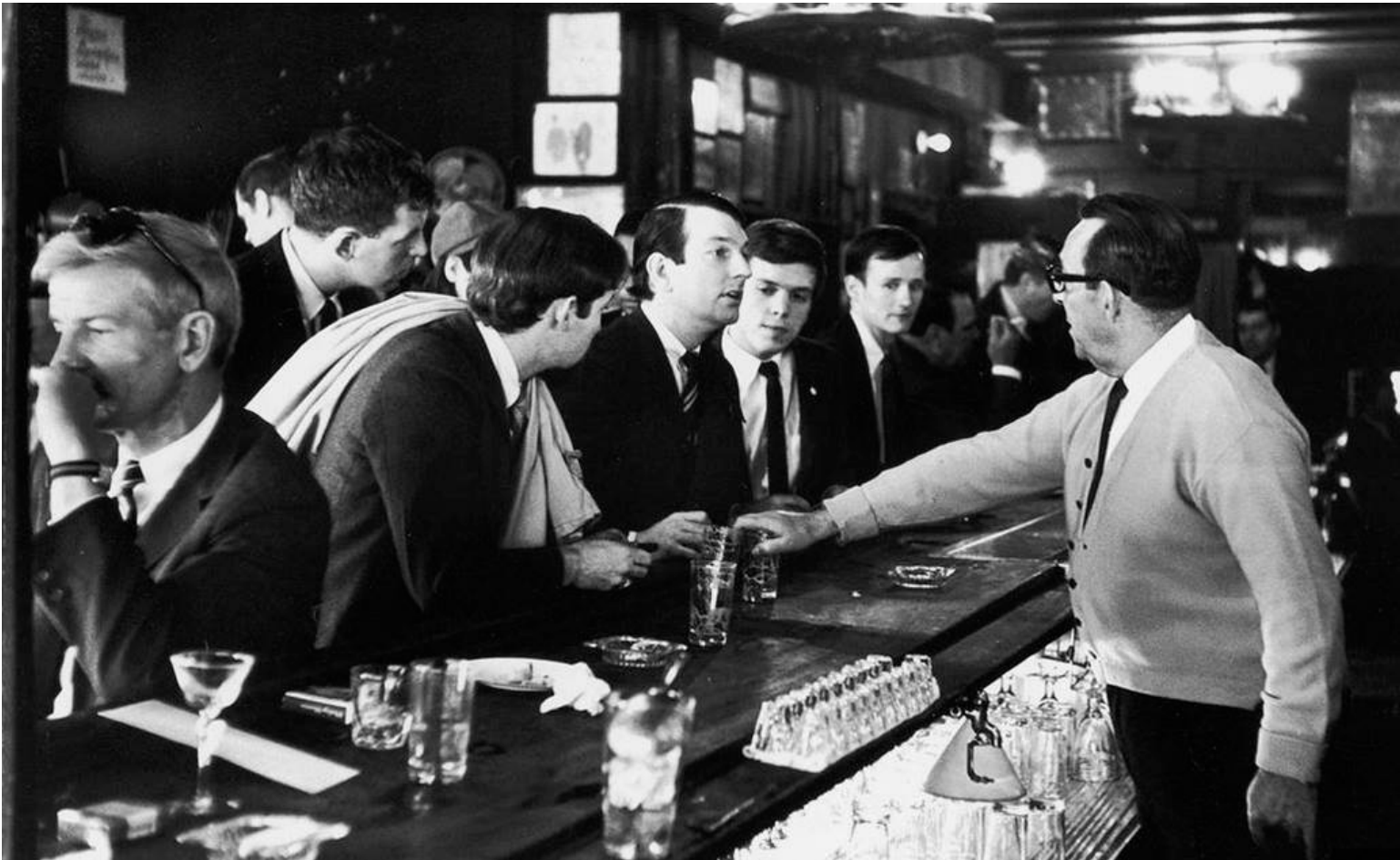
Julius' Bar – April 21, 1966