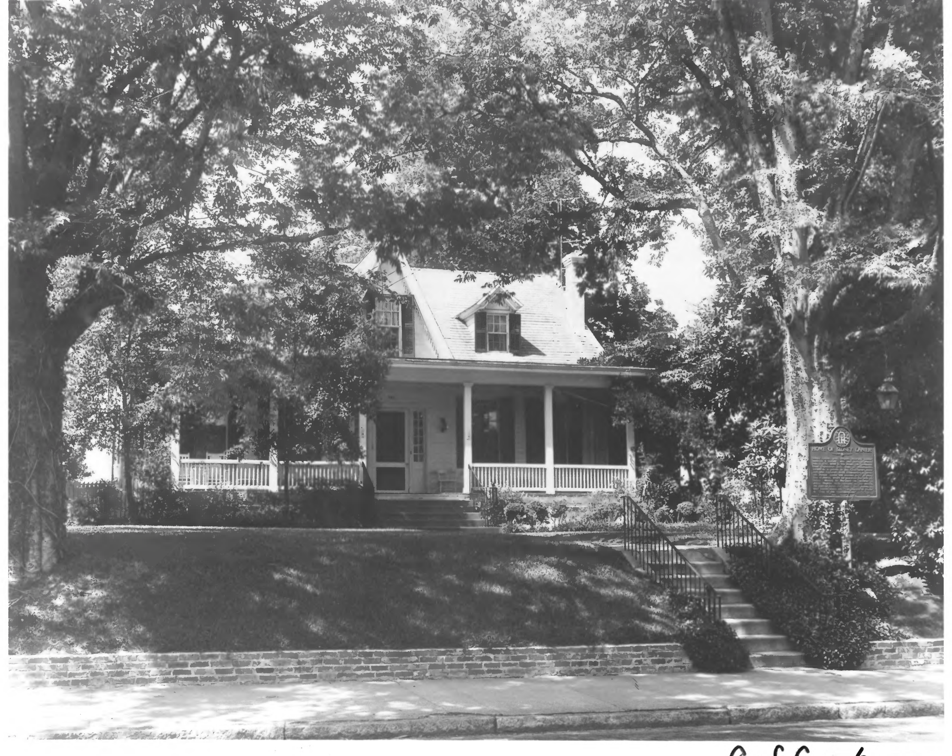
Cof C- 6