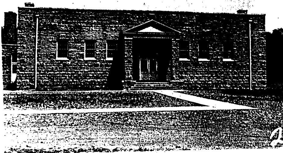
Figure 1. Reproduction of Works Progress Administration Photograph showing the completed gymnasium in 1941.

Forkland School and Gymnasium (BO-62) Boyle County, KY