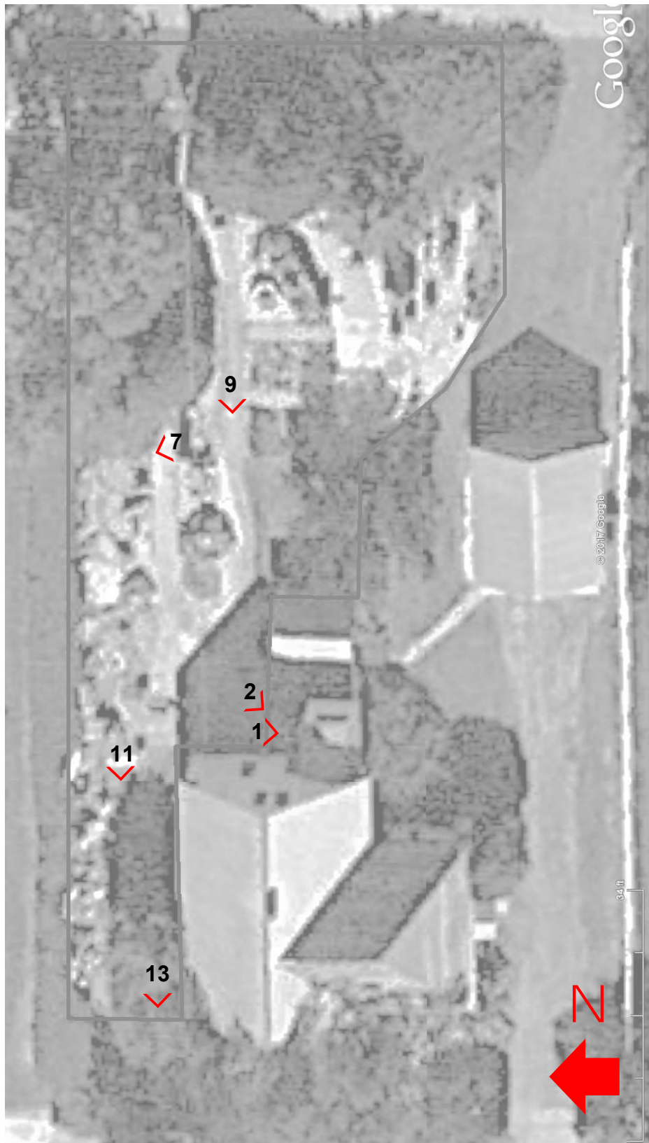
Photo Key (only overall photos are keyed so as not to clutter plan)