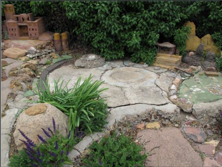
Figure 3: Lily pond with Indian Pueblo to left.