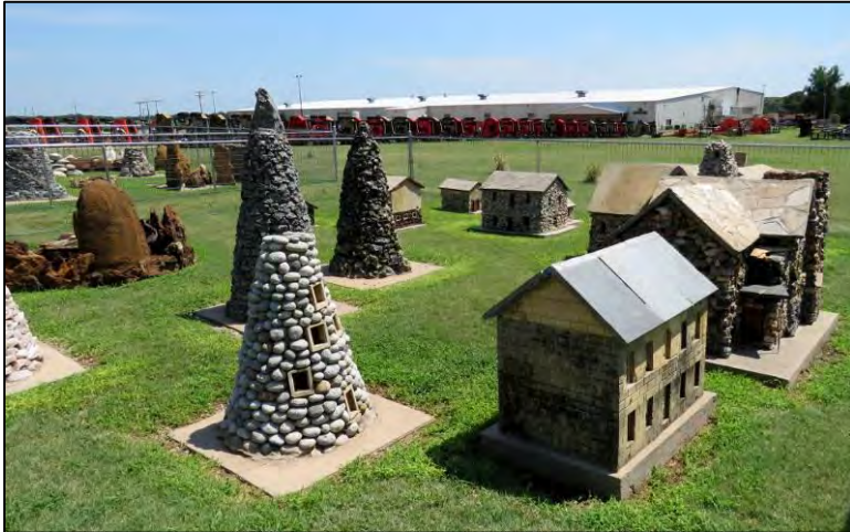
Figure 8: Miller's Park, Lucas.

Deeble's Rock Garden is still a favorite site for visitors in Lucas who come to see the grassroots, self-taught art environments now housed in Lucas. These environments include Dinsmoor's Garden of Eden, Deeble's Rock Garden, Ed Root's concrete sculptures that were originally on his farm, and are now housed at the Grassroots Art Center ( Figure 7 ), and Roy and Clara Miller's Park, dating to the 1920s and restored and re-located near the Garden of Eden in 2014 ( Figure 8 ).