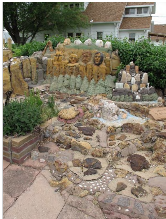
Figure 4: Mount Rushmore with Cathedral Mountain to the right and Mount Eisenhower to the left (KSHS April 2017).

Florence Deeble’s rock garden remains as she left it; although, there has been deterioration of mortar and concrete, and paint has faded and chipped in places. A devastating hail storm occurred in Lucas on April 24, 2015 and broke some of the plastic and plaster pieces in the Lucas history scenes on the north side of the house. One wall is leaning precariously against shrubs and must be restored.