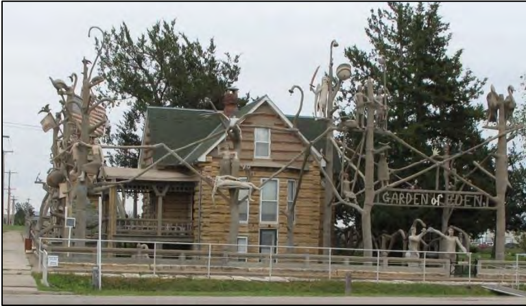
Figure 6: The Garden of Eden, Lucas, Kansas.