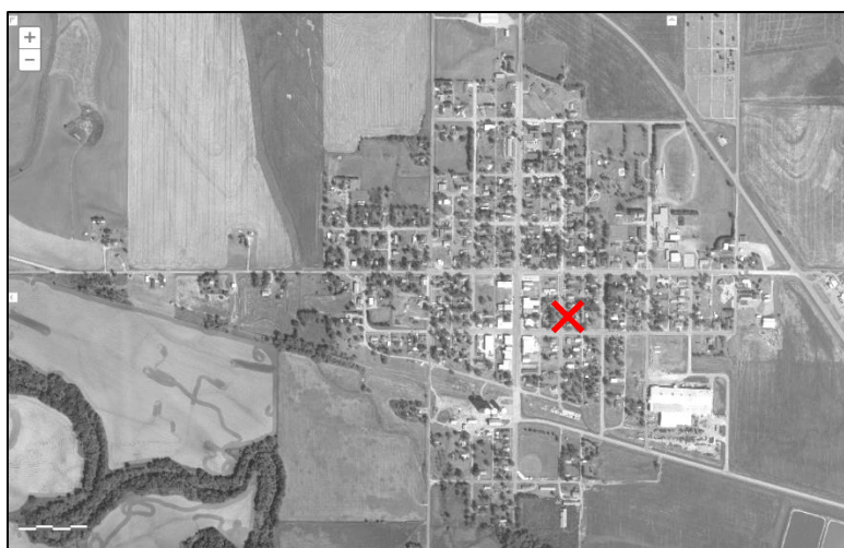
Figure 1: Contextual map, showing location of Deeble Rock Garden (X) within Lucas

The Deeble Rock Garden is located in Lucas, a town of about 390 population in the far northeast corner of Russell County, Kansas. The garden is in the east (backyard) and north side yard of the residence at 126 South Fairview Avenue ( Figure 2 ), which was the home of Florence Deeble's parents, built by them in 1906. The location is one block east of Main Street and just one block off the Main intersection, near the center of the community. The description of her garden below follows Deeble's own tour, which was filmed in 1991. 1 Unless otherwise noted, the quotations are attributed to Deeble from this video.