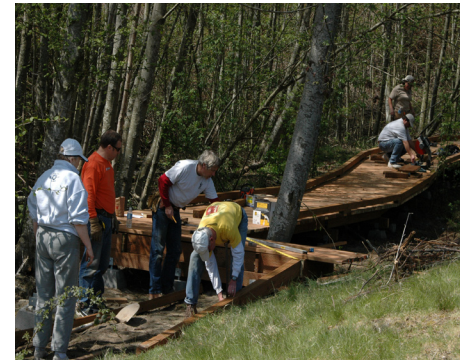
Volunteers build a boardwalk that is much anticipated by local walkers and birdwatchers.

RTCA is facilitating an Open Space Task Force, appointed by the Pierce County Council, on a project to undertake a comprehensive review of open space resources and financing options in the development of recommendations for a coordinated and robust countywide open space preservation effort.