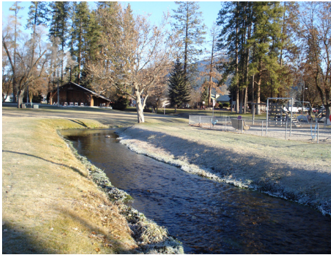
Chewelah Creek will one day have a trail following its course to connect the community's neighborhoods, parks, and civic buildings.

publication of a greenway management plan that establishes a coordinated management structure for the conservation of natural and cultural resources, and appropriate access for public recreation.