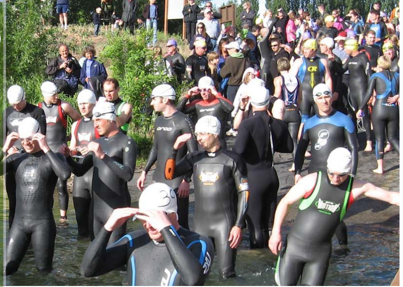
The annual Moses Lake Triathlon is an important fundraiser.