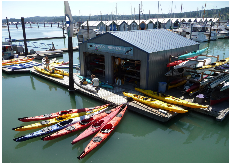
North Kitsap's String of Pearls Trails connects the peninsulas' communities. Think about going to work by kayak!

RTCA is working with trail partners in North Kitsap County to plan a 50-mile