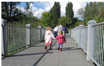
Meadowbrook Ponds, home to beavers, blue heron and salmon, is one of the urban walks featured in the NE Seattle Trails Network.

Trail proponents want to create a network of public trails that connect residents, neighborhood destinations