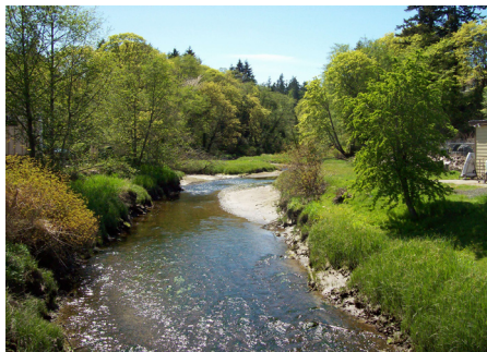
Blackjack Creek, on its way to Puget Sound.

The project partners want to create a 1.25 mile 'wilderness' trail along a natural, heavily vegetated salmon-bearing stream that flows through Port Orchard to Puget Sound. With RTCA assistance, the city will hold public workshops and meetings to finalize details for the trail and produce a publically supported concept plan for trail construction.