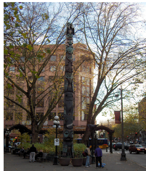
Seattle's historic Pioneer Square Neighborhood is a key landmark on the Trail to Treasure--a tribute to the Klondike Gold Rush days.

RTCA is helping the Watershed Alliance sponsor a visioning process to bring conservation partners and neighborhoods together to forge a vision for the Puget Creek Watershed. Daylighting the creek, restoring native plant communities, building bioswales, and using tertiary wastewater to sustain a salmon run are all part of the possibilities. Key stakeholders include the Duwamish Tribe, Nature Consortium, People for Puget Sound, Seattle Parks & Recreation, Duwamish River Cleanup Coalition, and others.