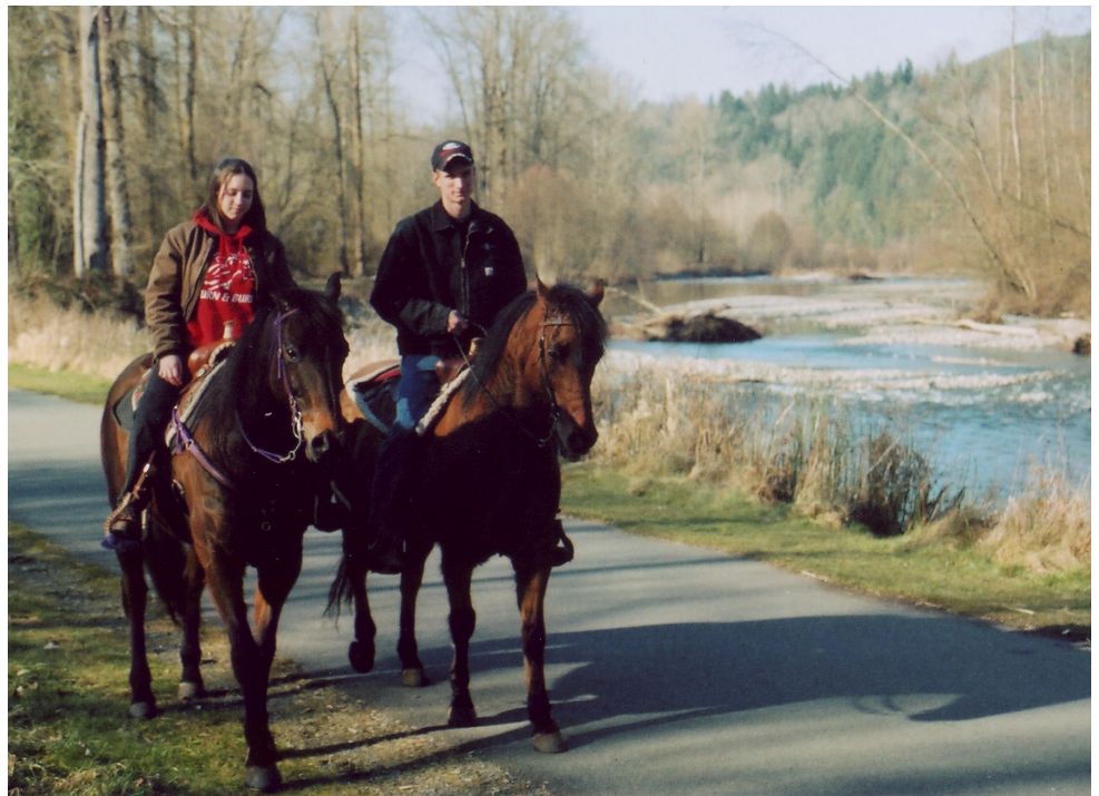
Recommendations for a county-wide system of trails and greenbelts, such as the Foothills Trail shown above, will be developed by the Pierce County Open Space Task Force.

A diverse group of non-profit and public organizations in metropolitan Spokane are partnering to establish a corridor between two established conservation areas. The surrounding environment provides critical habitat,