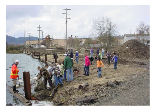
Students from local schools plant native species and stablilize the banks of Cheadle Lake, the largest log storage pond in the U.S.