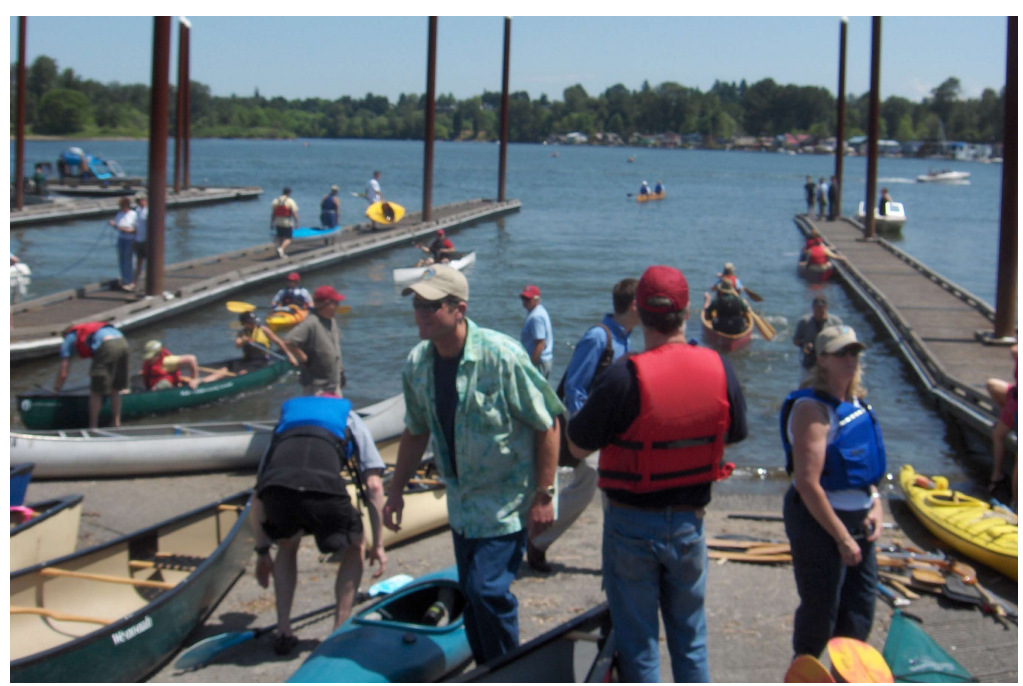
Paddlers prepare to launch during the kick-off event for the final segment of the Willamette River Water Trail.

In 2003 RTCA helped the Mid-Willamette Connections Workgroup conduct planning sessions and public outreach to support a paddling trail for the Willamette River. Volunteers inventoried access sites, developed a management plan, and produced a series of popular guidebooks. More than 75 partners came together to shape the water trail, securing over $350,000 in public/private funds. The ribbon-cutting events were attended by more than 500 people and drew top-flight speakers, including Governor Kulongoski, Congressman Wu, Congresswoman Hooley and Deputy Secretary of the Interior Lynn Scarlet.