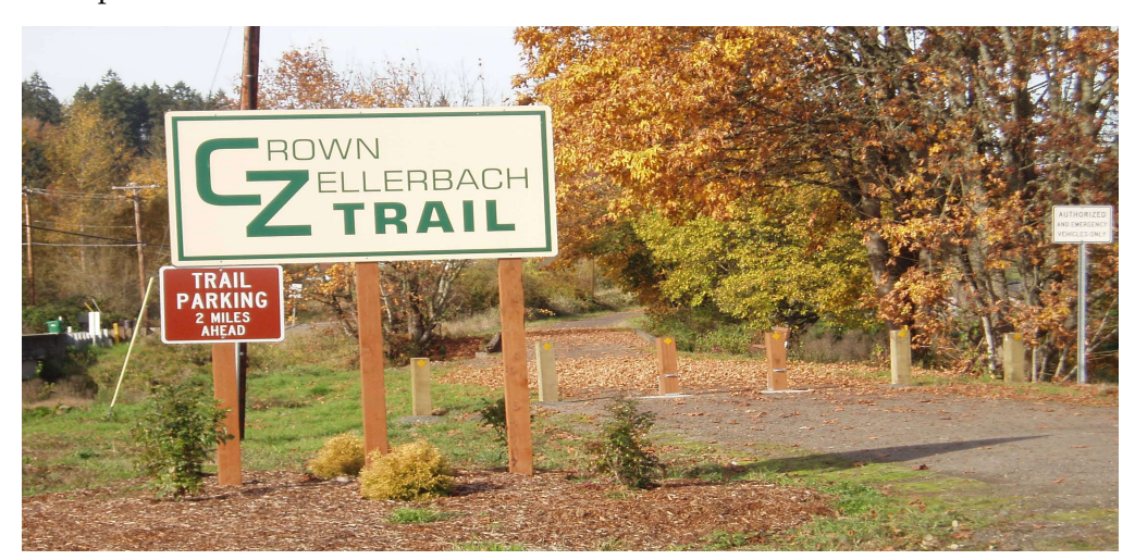
The first section of the Crown Zellerbach Trail in Scappose is set to open in summer 2010.

services like fence-building and landscaping. Other improvements include a wayfaring sign along Highway 30, new pedestrian bridges and trail culverts, and bollard barriers to keep automobiles off the trail.