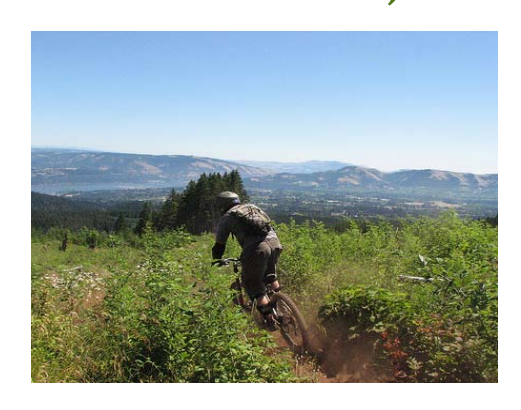
The Columbia Gorge National Scenic Area provides some of the most beautiful bike country in the U.S.

lion years; the region has been designated a World Heritage Area. Together, Wheeler County, the City of Fossil, and the Fossil School District have asked RTCA to help them develop a plan for a local heritage trail to showcase the region's rich natural and cultural history. The partners envision a 2-3 mile urban trail network in Fossil that will connect geological and historical sites, paleobotanical collections, public art and key community destinations. The project sponsors anticipate active participation of K-12 students.