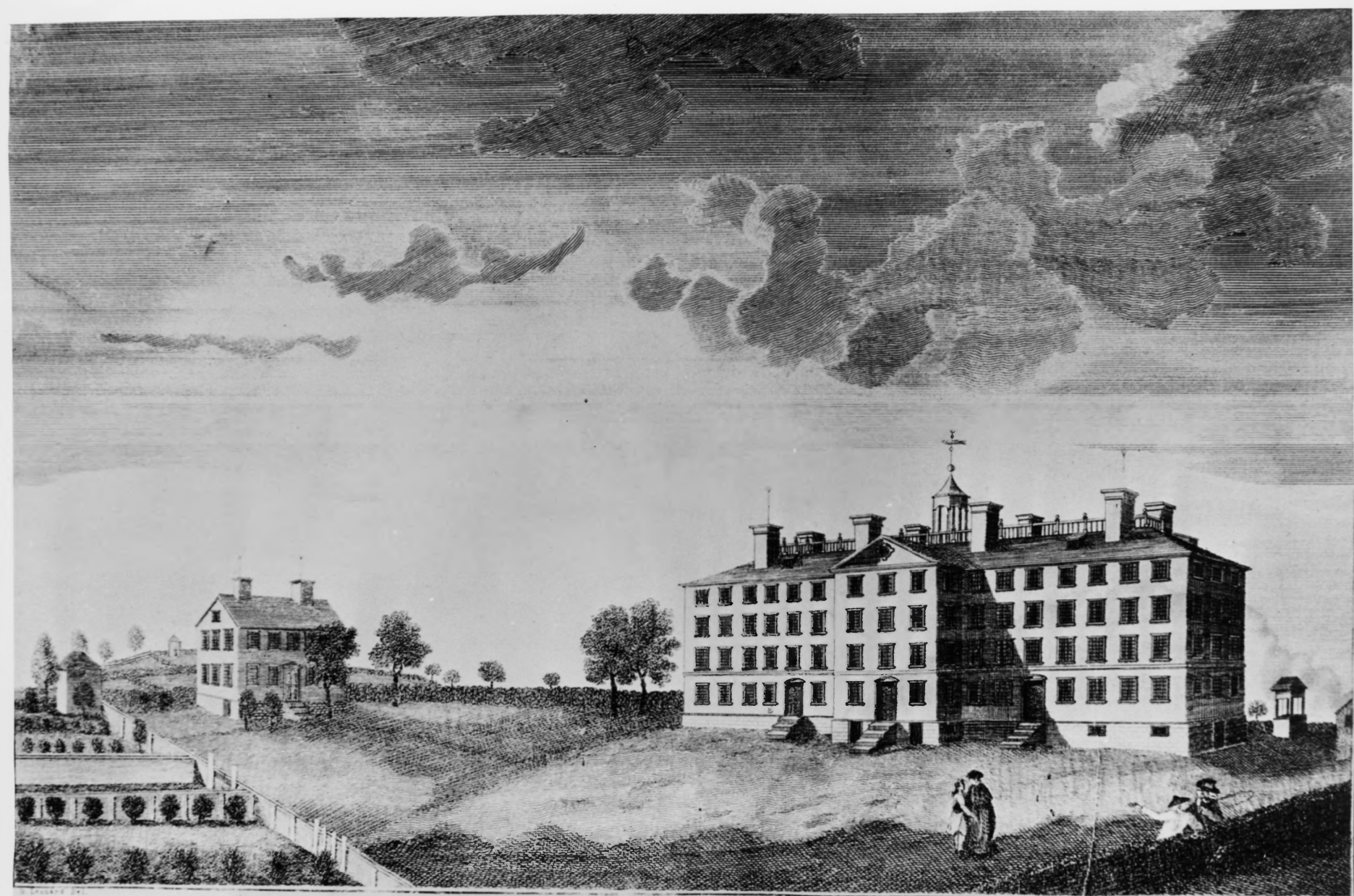
A S.W. view of the COLLEGE in Providence, together with the PRESIDENT'S HOUSE & GARDENS.