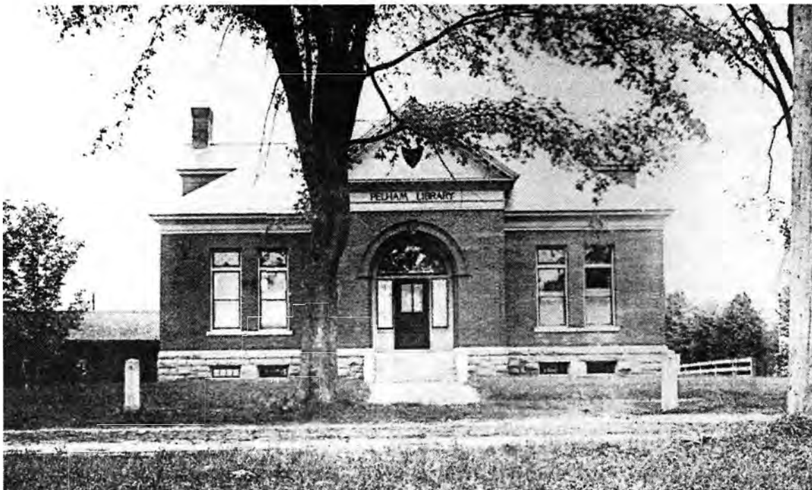
Pelham Library and Memorial Building, ca. 1903, looking north at front elevation. Reprinted in 250 th Souvenir Book (1996).