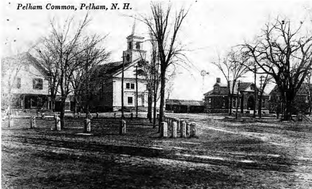
"Pelham Common," ca. 1900. Looking northeast, showing, from left: Atwood's Store, the Congregational Church with horse sheds behind, and the Library and Memorial Building. The Town Common makes up the foreground.