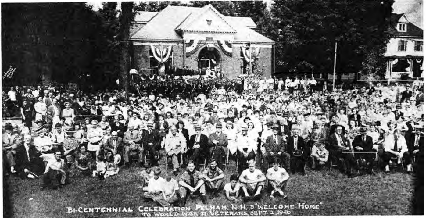
"Bi-Centennial Celebration of Pelham, N. H. & Welcome Home to World War II Veterans, Sept. 2, 1946." Showing the Pelham Library and Memorial Building as part of the event venue. Reprinted in the 250 th Souvenir Book (1996).