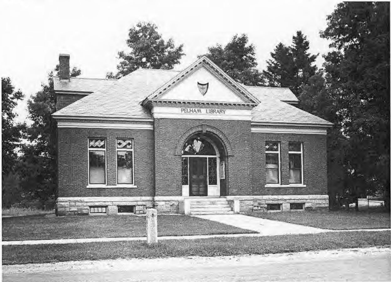
Undated (ca. 1940s) photograph of the façade of the Pelham Library and Memorial Building.