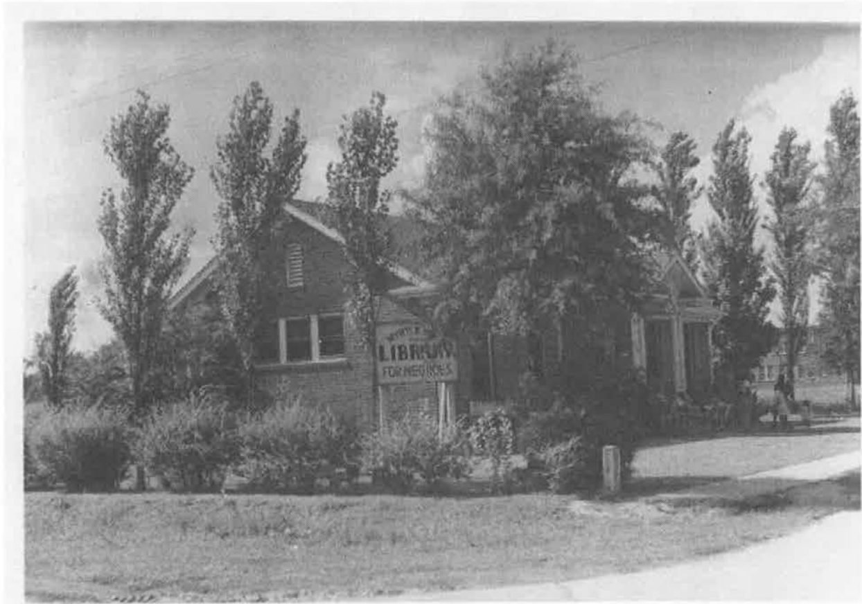
Figure 1: Myrtle Hall Library for Negroes, c.1940.