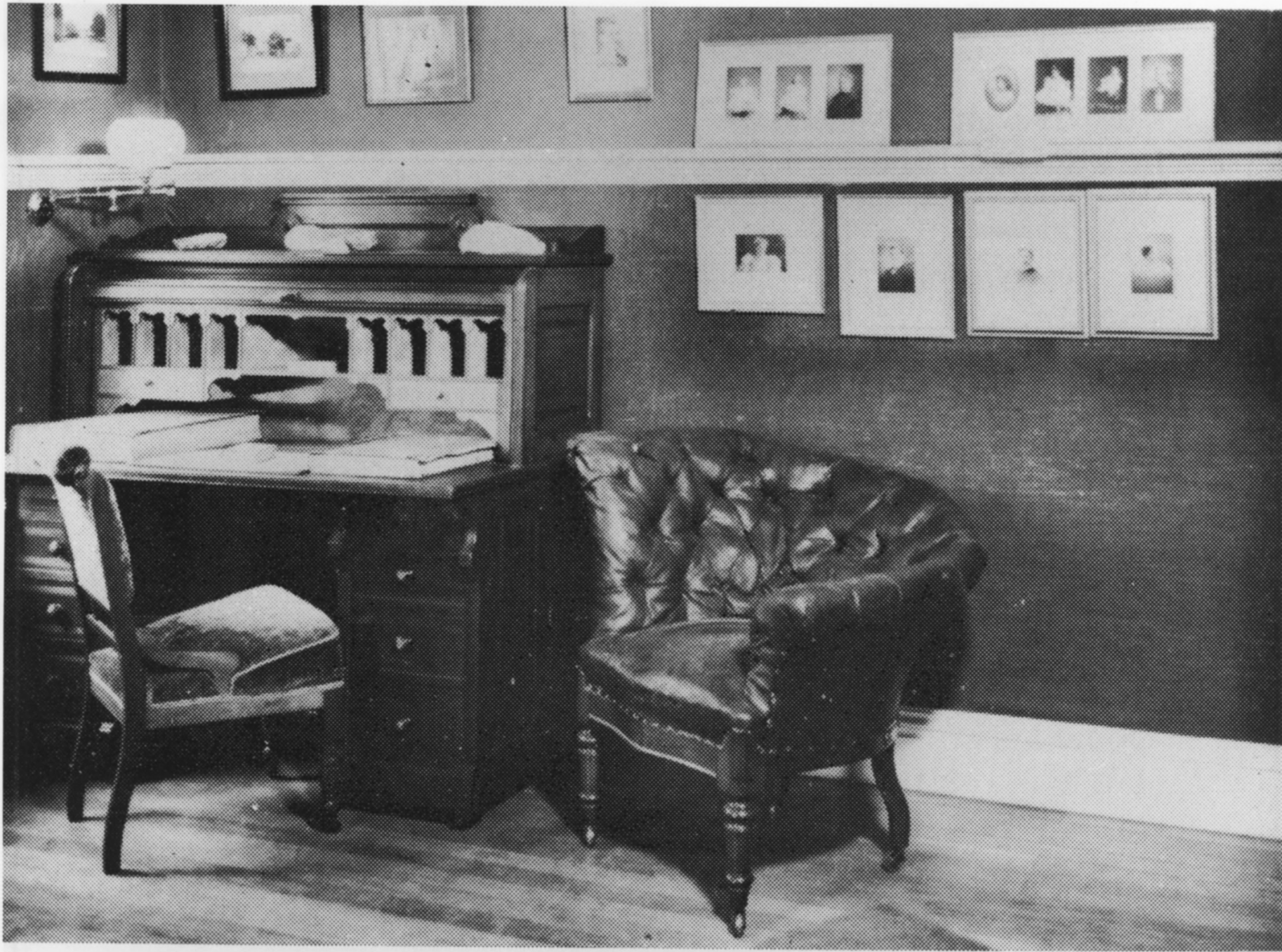
Desk and favorite reading chair in President's study at Lawnfield.