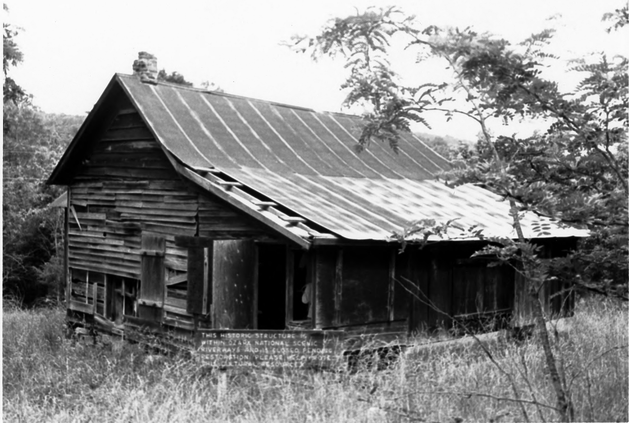
THIS HISTORIC STRUCTURE IS WITHIN OZARK NATIONAL SCENIC RIVERWAYS AND IS CLASSIFIED AS A RESTORATION. PLEASE DO NOT REMOVE OR DESTROY ANY OF THE BUILDING'S RESOURCES.