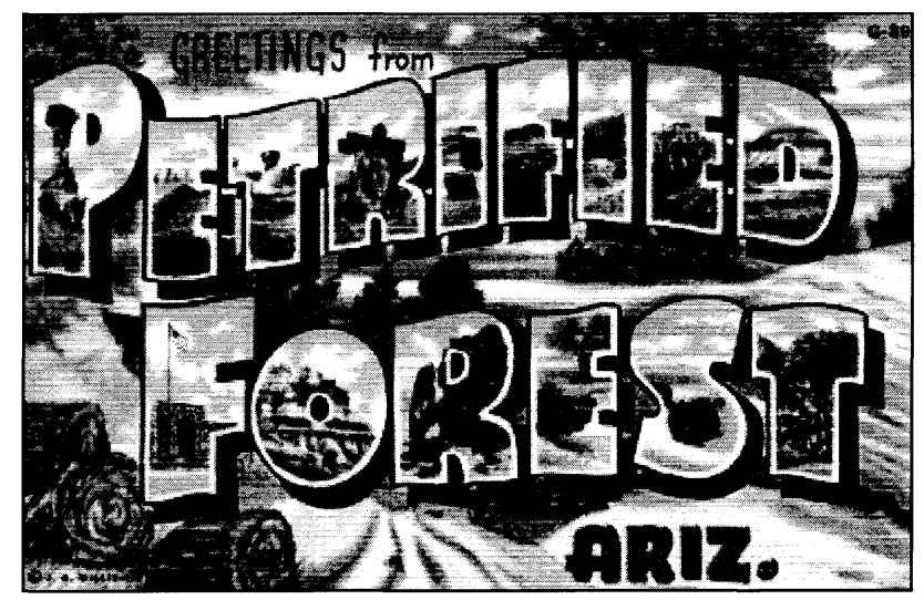
Figure 8-1 "Greetings from Petrified Forest, Arizona." Southwest Post Card Co., Albuquerque, NM J.R. Willis, C.T. Art Colortone, Genuine Curteich, Chicago

More recently, following a period of marginal success as a country inn and the neglect of its buildings, the property has again changed ownership. Committed to improving its viability and intending to apply for tax credits to support these efforts, the new owners are seeking to preserve the historic character of the property through a renovation of its buildings.