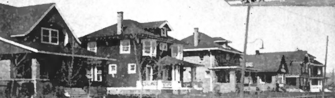
Las Vegas N.M. Homes