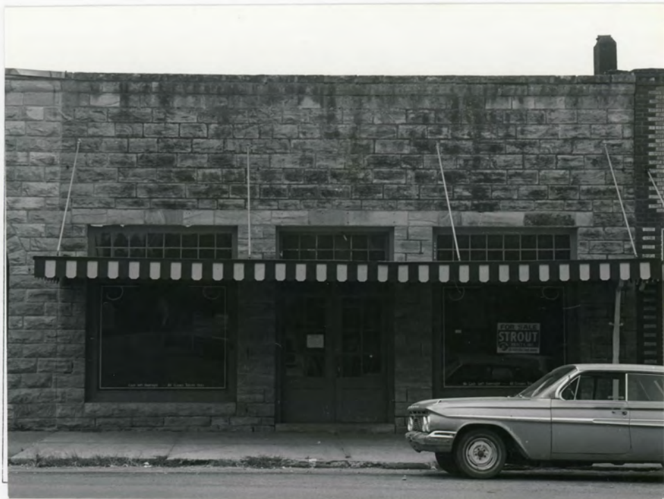
Historic Resources of Stone County Stegall General Store, ST-102 Mountain View 1983 Negative on file at the AHPP Viewed from the north