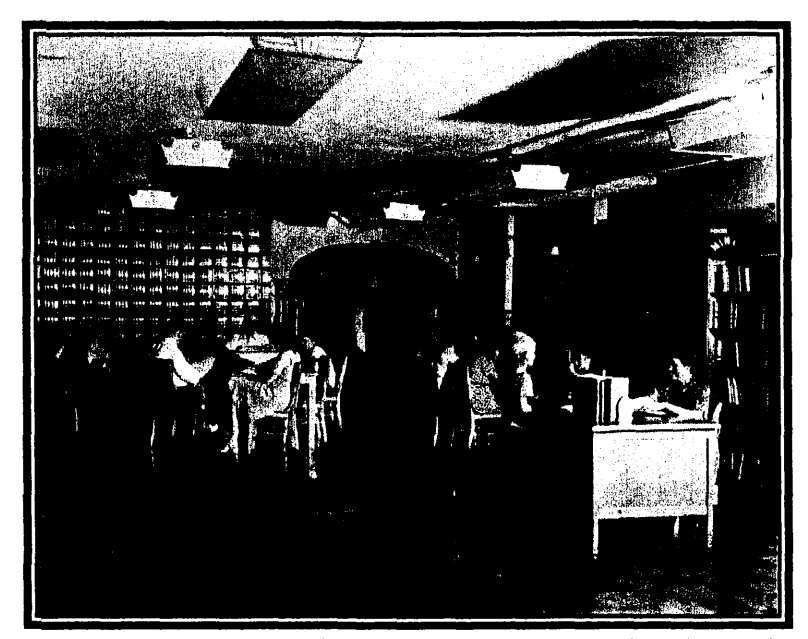
Fig. 2 Eventually, a public library was added to the list of amenities provided by the coal company and contained in the Entertainment Building. This photo likely dates from the 1940s.

topped openings glazed with metal frame multi-light windows. The primary access to the building is gained through the south elevation, using a stair which is built upon a stone foundation and leads to a raised stoop shielded by a flat marquee canopy. The main entrance is centered on the south elevation and includes paired double doors with six-light upper panels and solid lower panels. A nine-light transom is above the canopy. The exterior surfaces of the building are articulated by brick pilasters with stylized brick capitals, along with a variety of