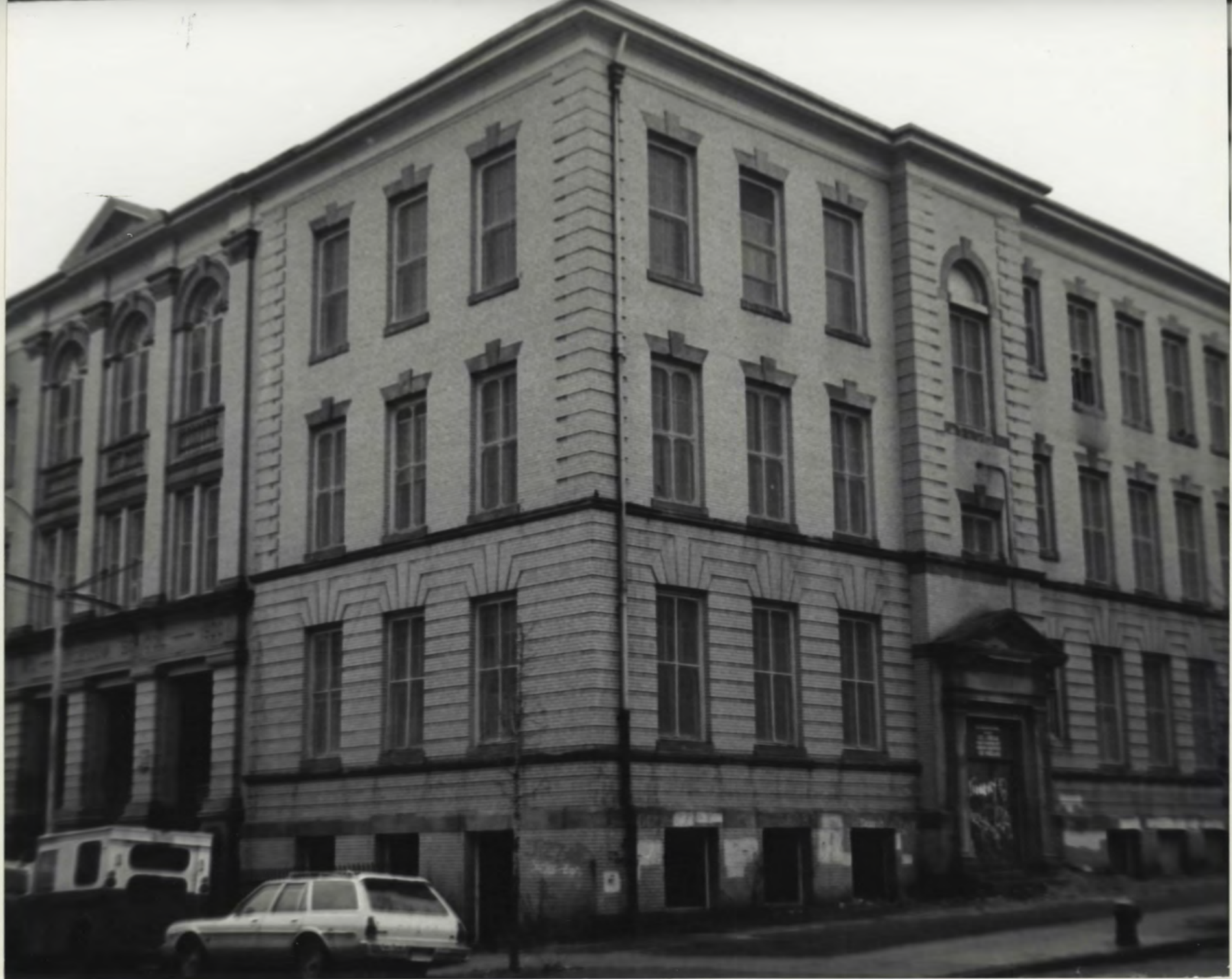
BUILDING FRONT AND EASTERLY SIDE (Corner of E & 4th)