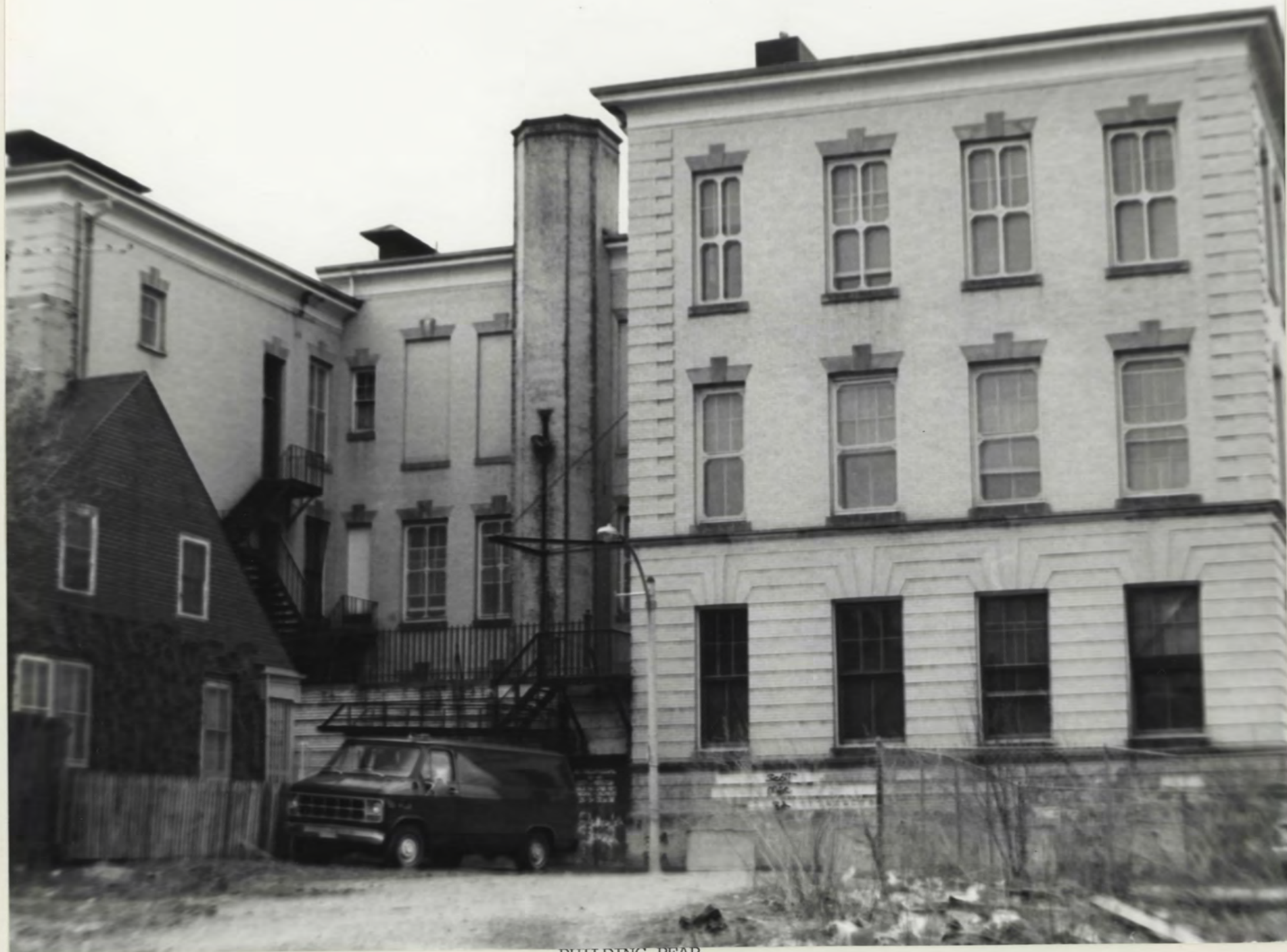
BUILDING REAR (From West Broadway)