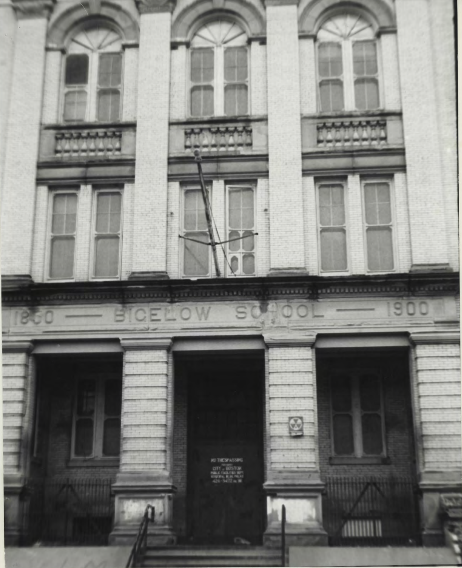
THREE TIERED ENTRANCE WAY 4th STREET