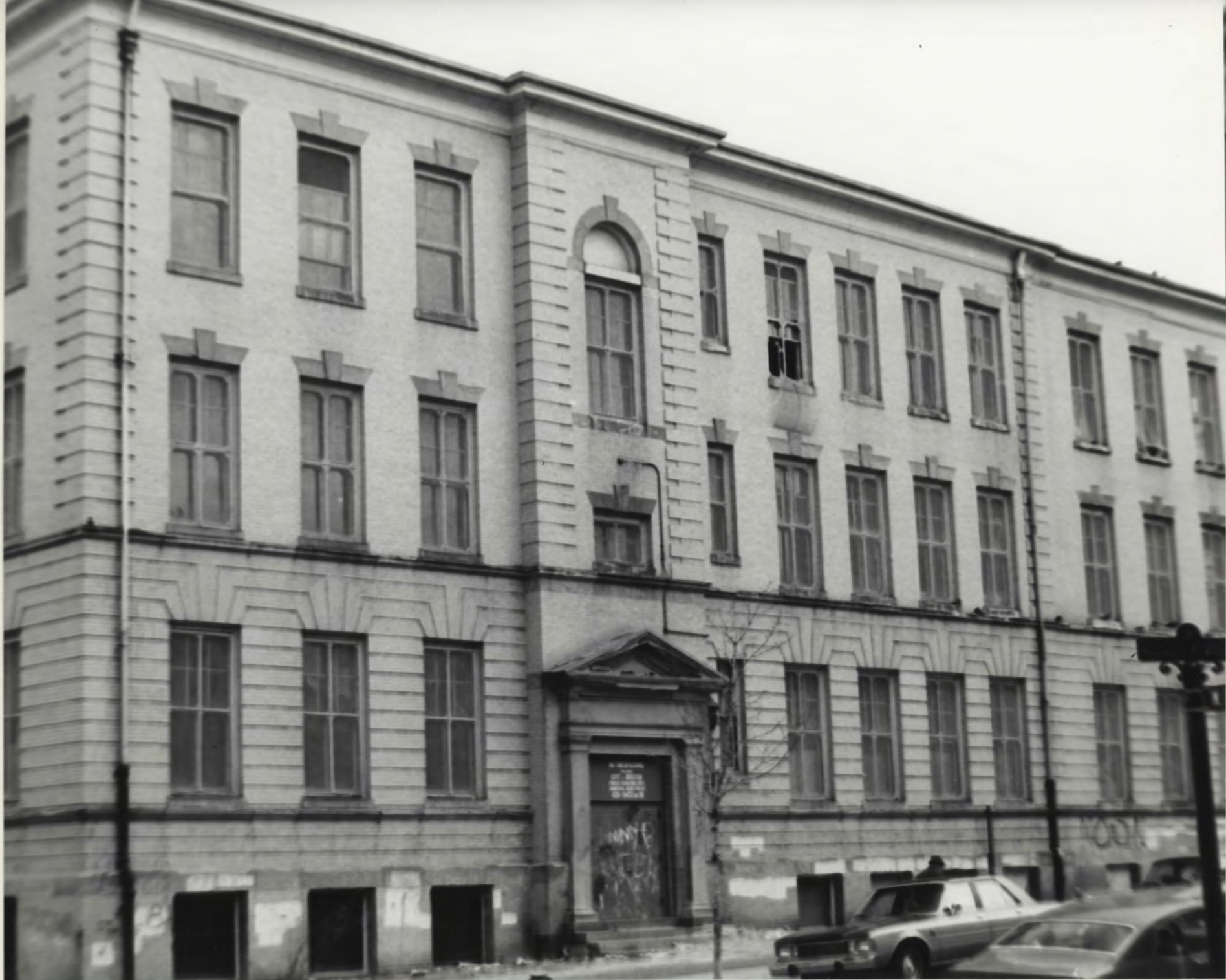
EASTERLY FACADE AND ENTRANCE E STREET