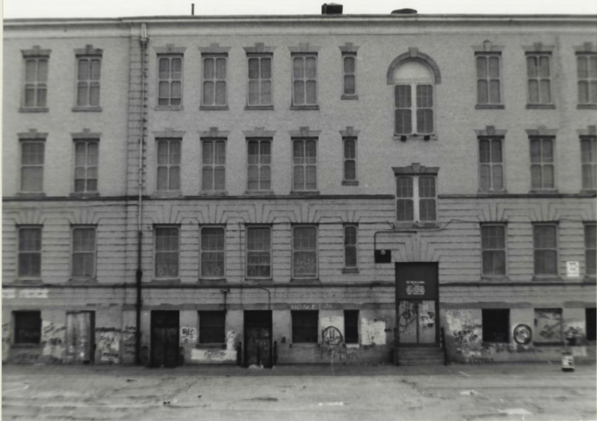
WESTERLY FACADE AND ENTRANCE (Existing Parking Lot Side)