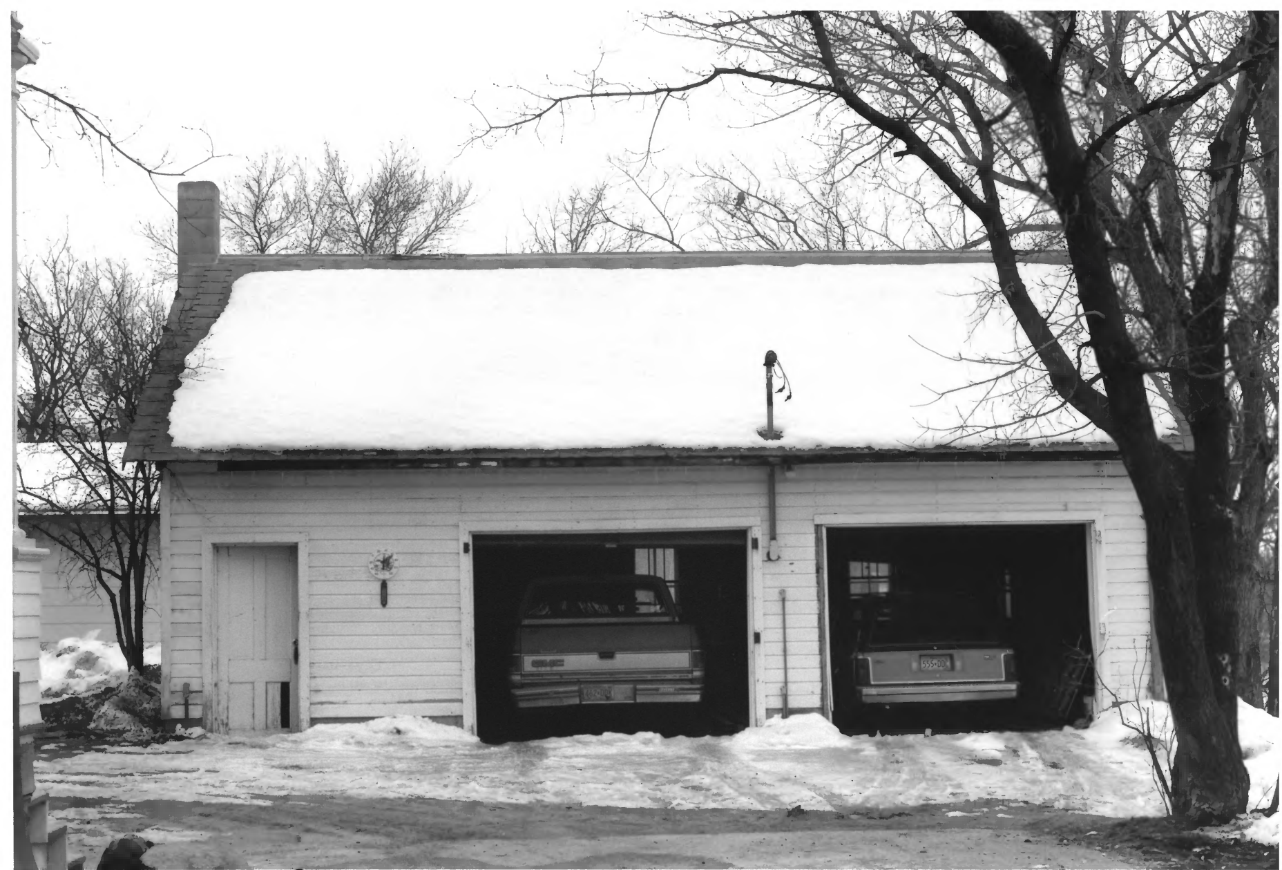
Hannah C. and Peter E. Thompson House 361 Second Street NE, Barnesville Clay Co., MN 011574 - 8A19