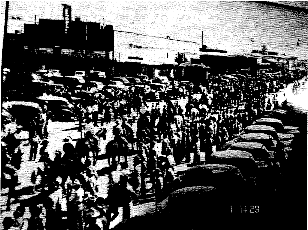
Figure 8-1: Opening of the Lee Theater, September 30, 1948

Lea Theater Lovington, Lea County, New Mexico