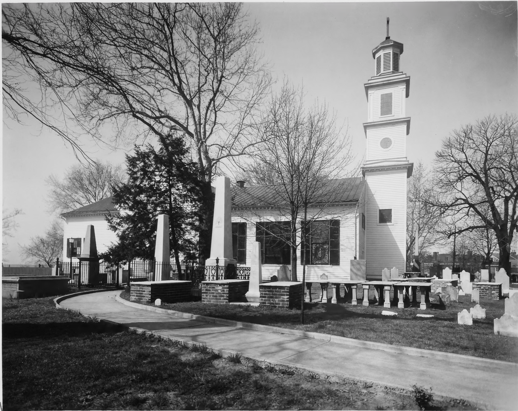
View looking west to east face of St. John's Church, Richmond, Virginia. The original 1741 part of the church, the present east transept, is behind the cedar tree in the left center of the picture.