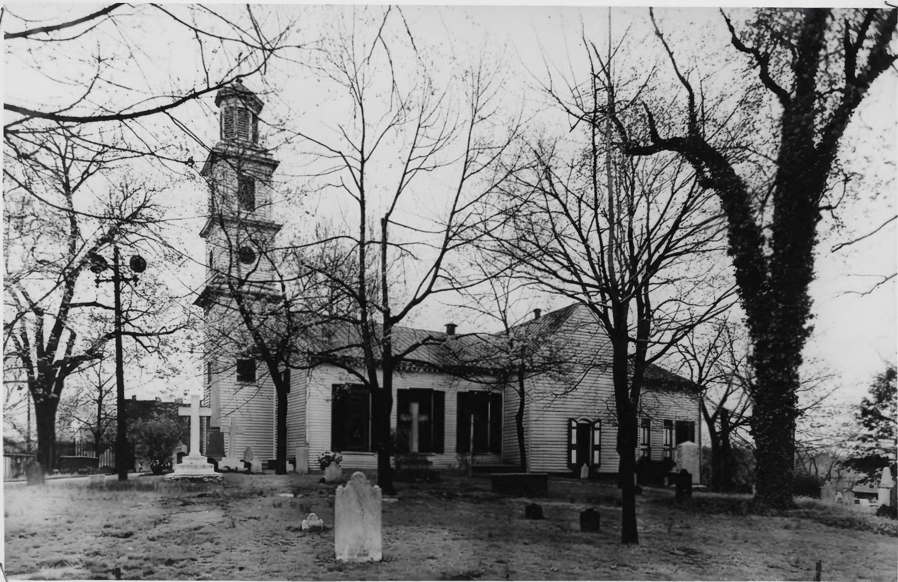
View looking east to west face of St. John's Church, Richmond, Virginia. The door framing of the door which shows at the west transept dates from 1772. Most of the siding on the transepts is original (1741). The nave, to a point at the end of the first window from the front of the church, was built in 1772. The remainder of the nave was built in 1830. The tower was erected between 1830-1835, and the present tower dates from 1896. The chancel and vestry room at the south end (right end of structure in picture) were built in 1880. George Wythe's grave is marked by the large rectangular stone directly in front of the west transept door.