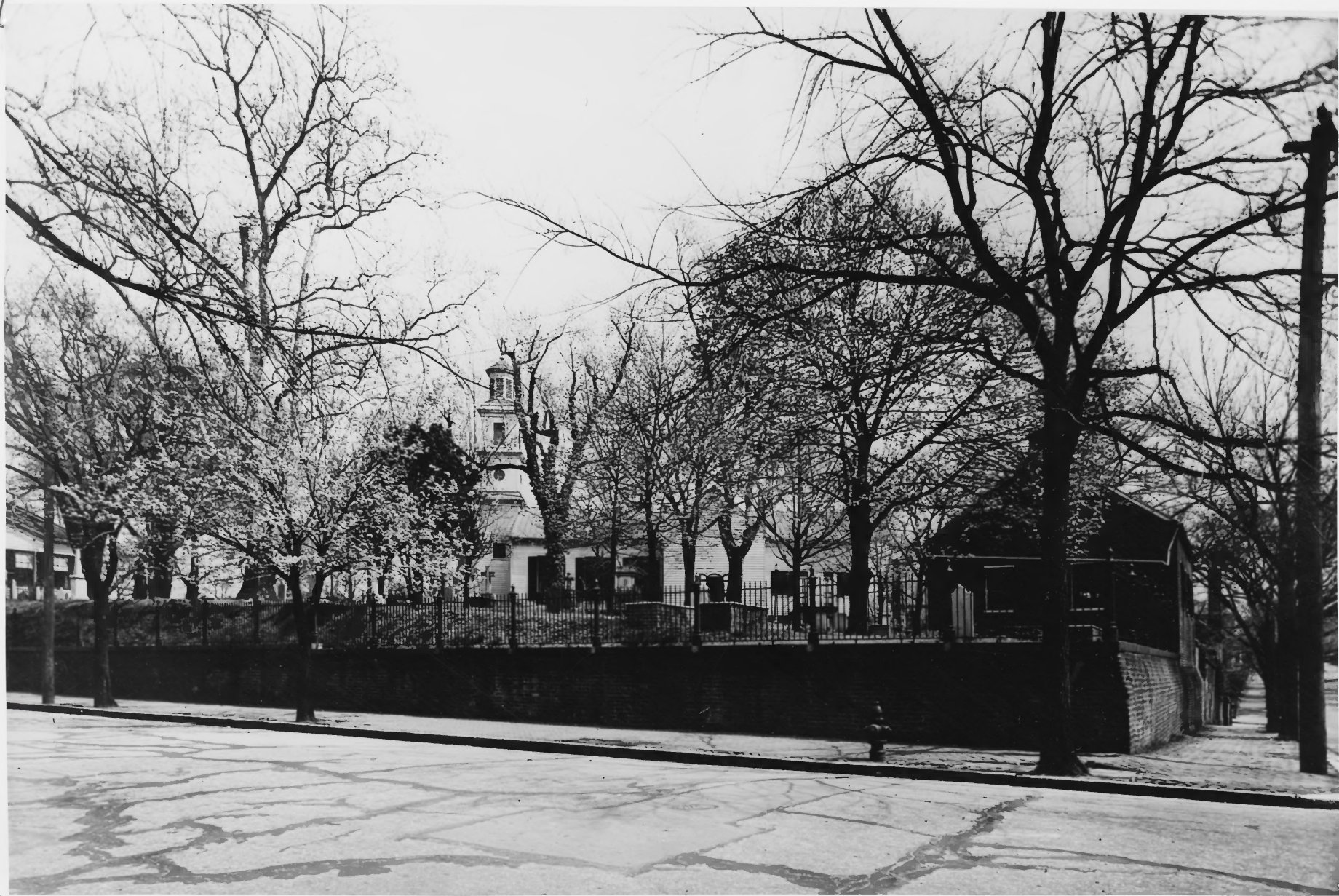
View looking northeast to St. John's Church and Churchyard from the corner of 25th and Grace Streets.