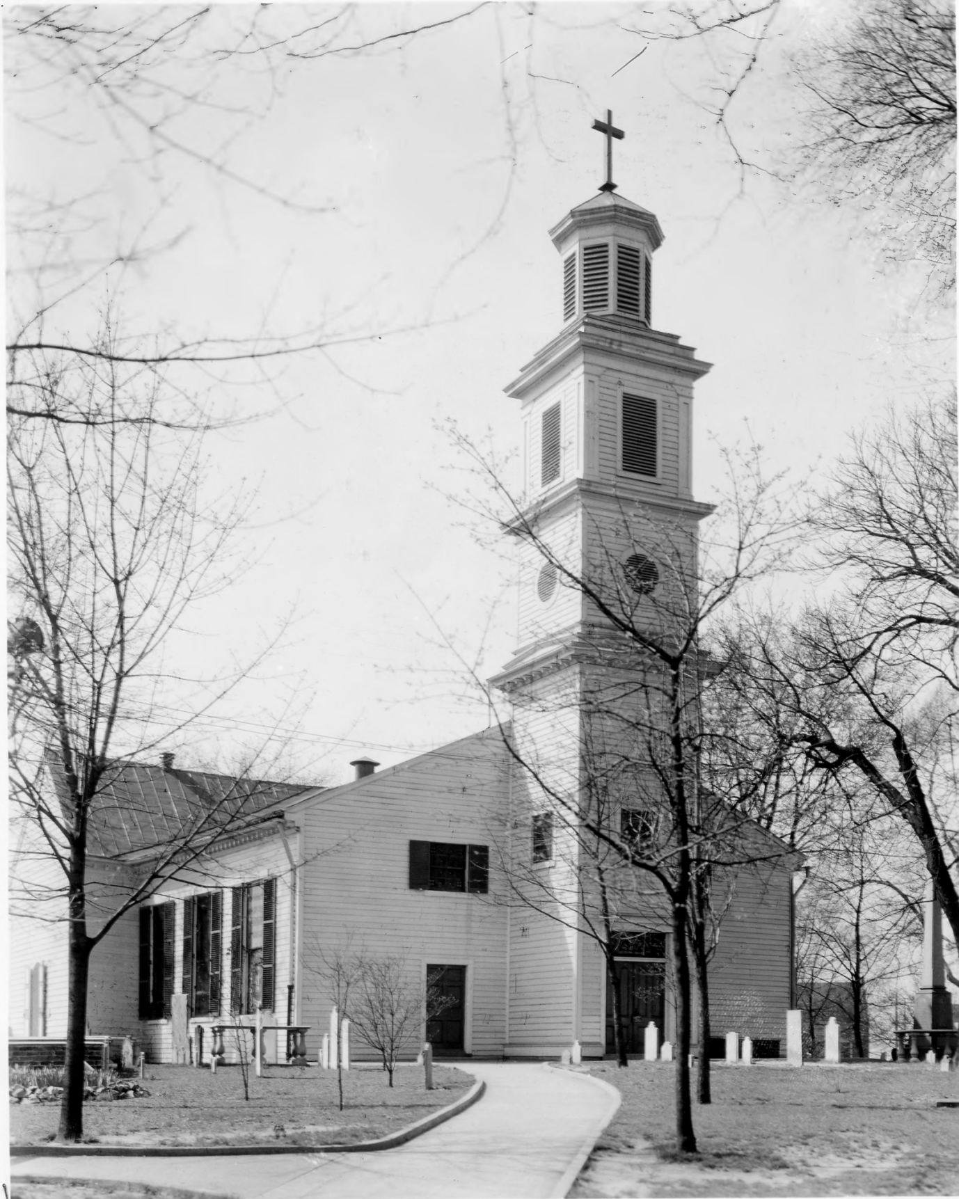
View looking south to front of St. John's Church, Richmond, Virginia, which faces north. The east transept part of the original 1741 structure, shows at the left. The part of the nave built in 1772 extended to a point marked approximately by the beginning of the third window from the transept, or the first window along the side from the front. The transept and this much of the nave constituted the Revolutionary Period church in which the Virginia Convention of March 1775 met, and in which Patrick Henry made his great speech.