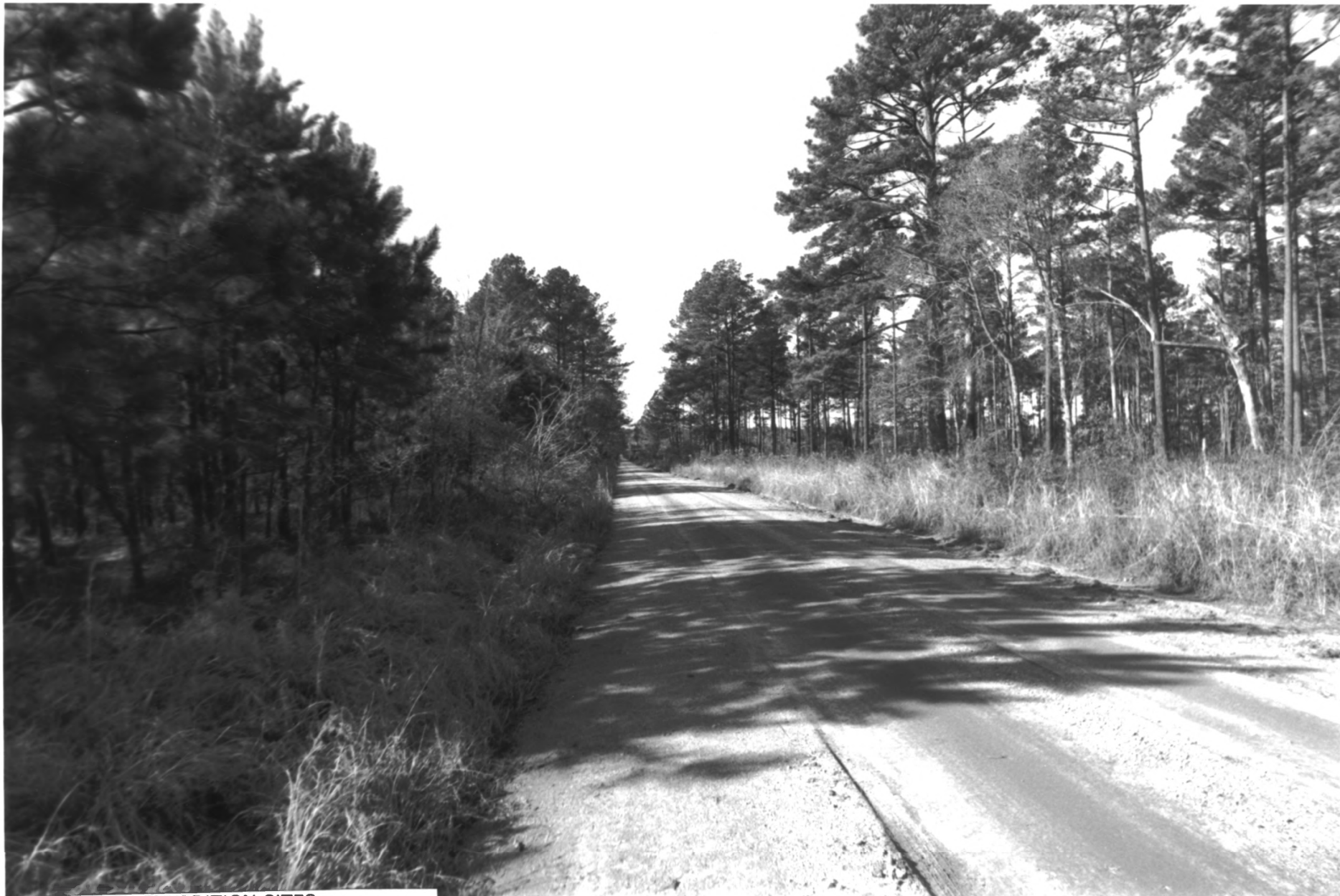
CAMDEN EXPEDITION SITES Marks' Mills Battlefield Cleveland County, Arkansas From east at point of Union van's capture Photo: Don Baker, 1993