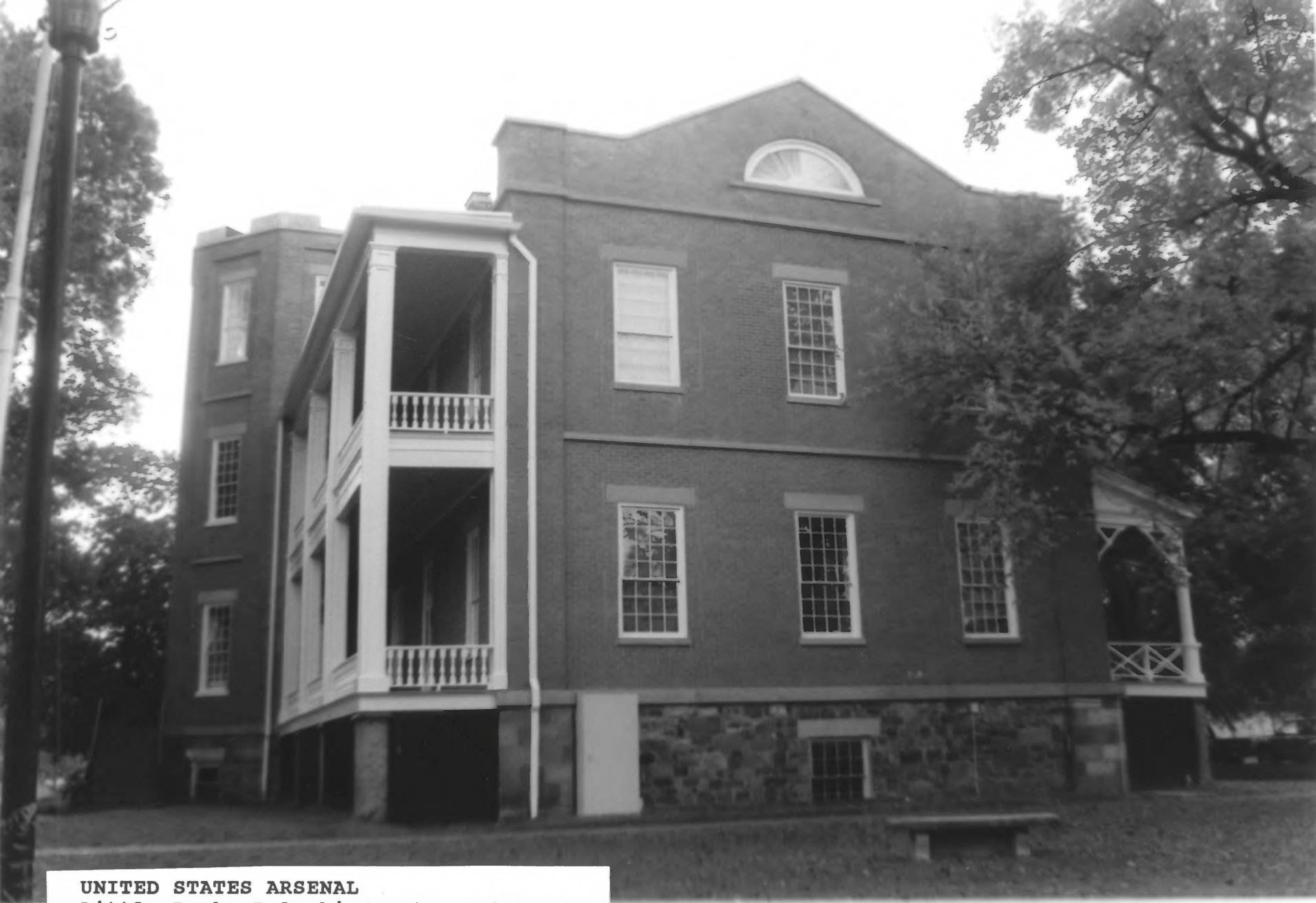
UNITED STATES ARSENAL Little Rock, Pulaski County, Arkansas View from west Photo: Todd Ferguson, 1993