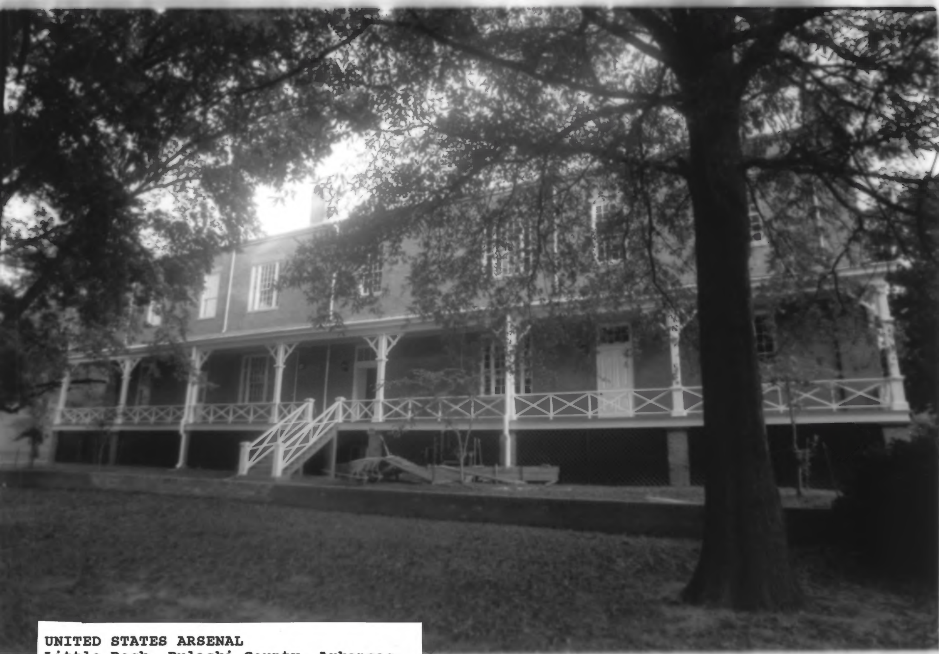
UNITED STATES ARSENAL Little Rock, Pulaski County, Arkansas View from southeast Photo: Todd Ferguson, 1993