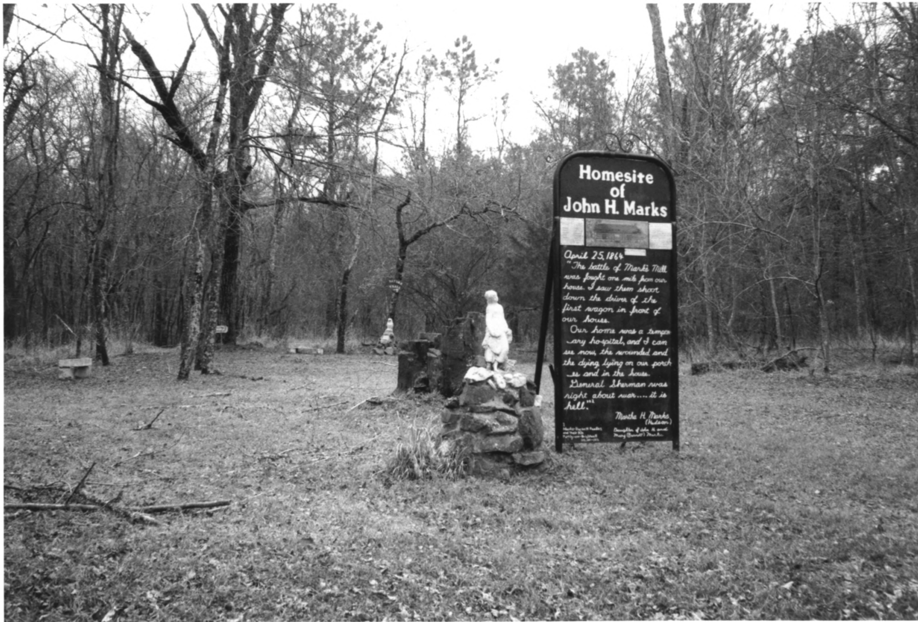
CAMDEN EXPEDITION SITES Marks' Mills Battlefield Cleveland County, Arkansas From north at Marks' House Site