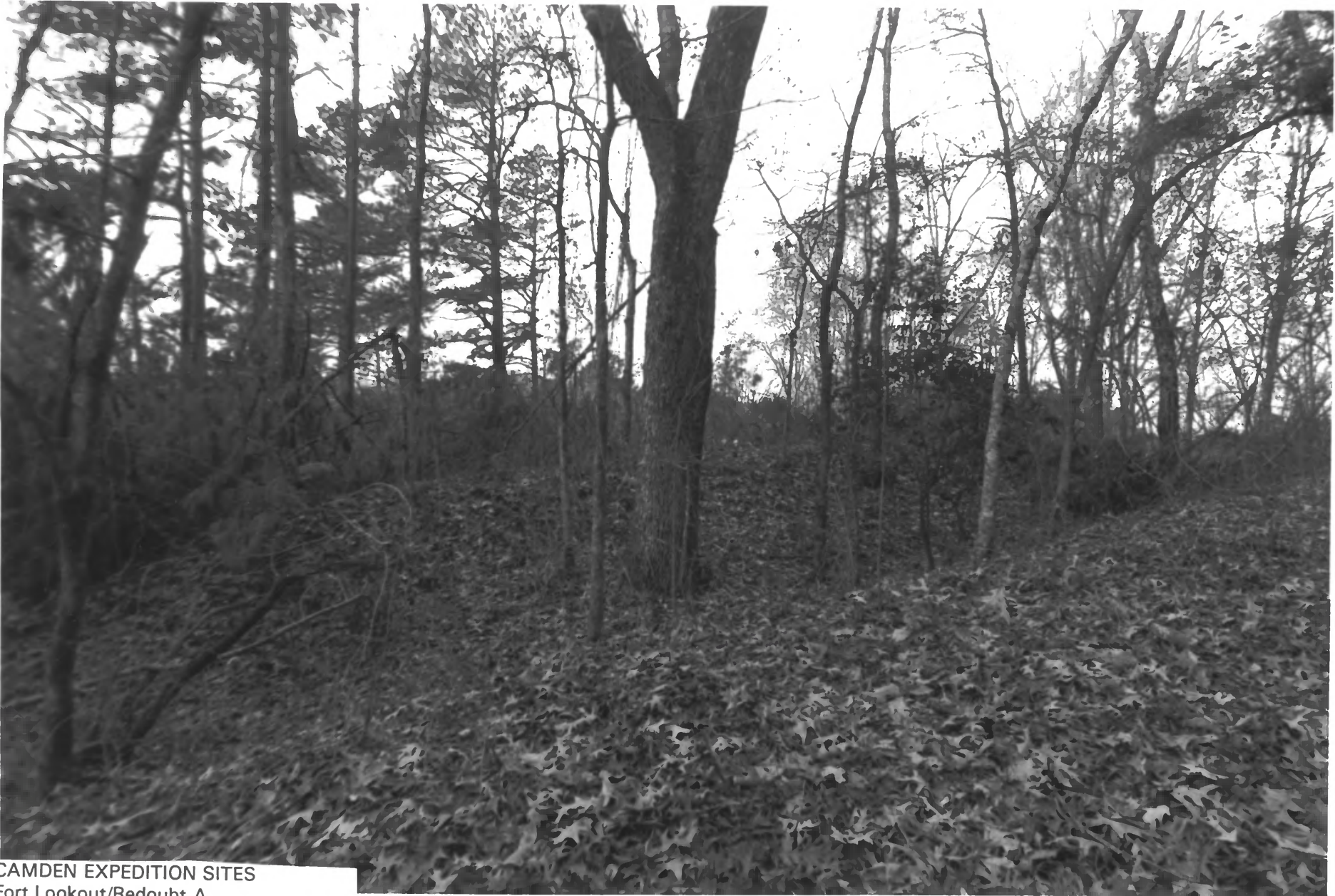
CAMDEN EXPEDITION SITES Fort Lookout/Redoubt A Ouachita County, Arkansas From east at south end of fort, at entrenchments protecting river crossing