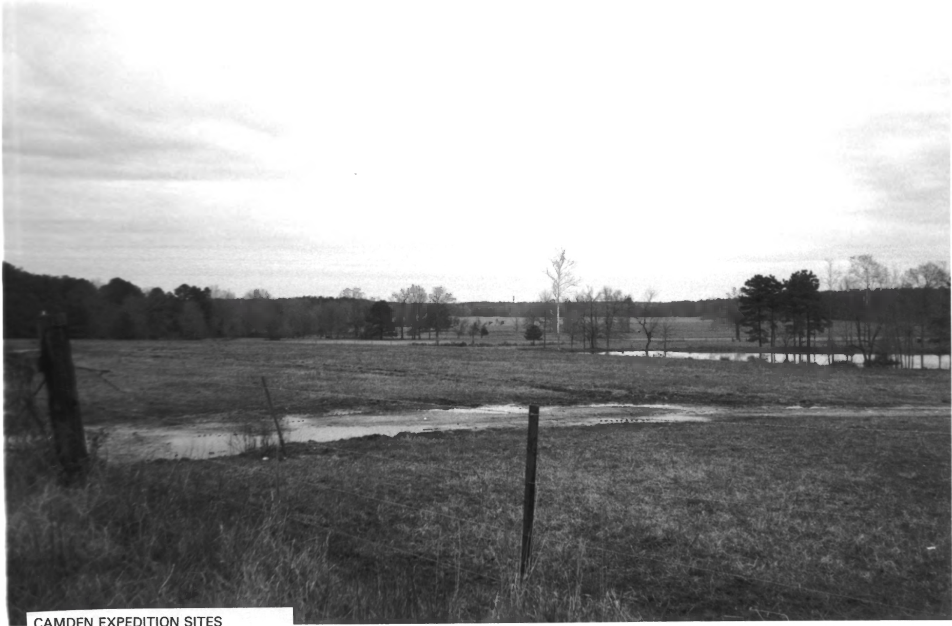
CAMDEN EXPEDITION SITES Prairie De Ann Battlefield Nevada County, Arkansas From southwest toward the prairie