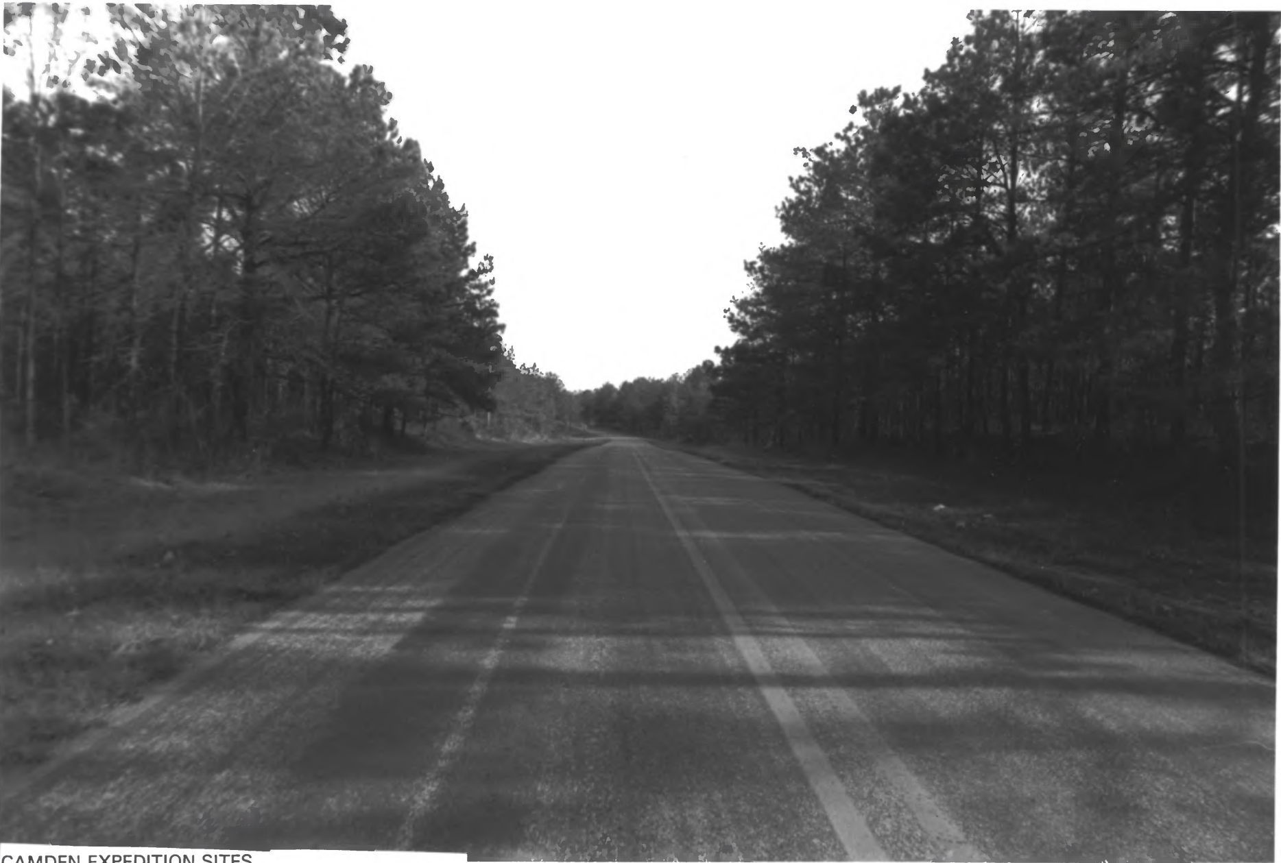
CAMDEN EXPEDITION SITES Poison Spring Battlefield Ouachita County, Arkansas From west to site of 1st KS Colored's first encounter Photo: Don Baker, 1993