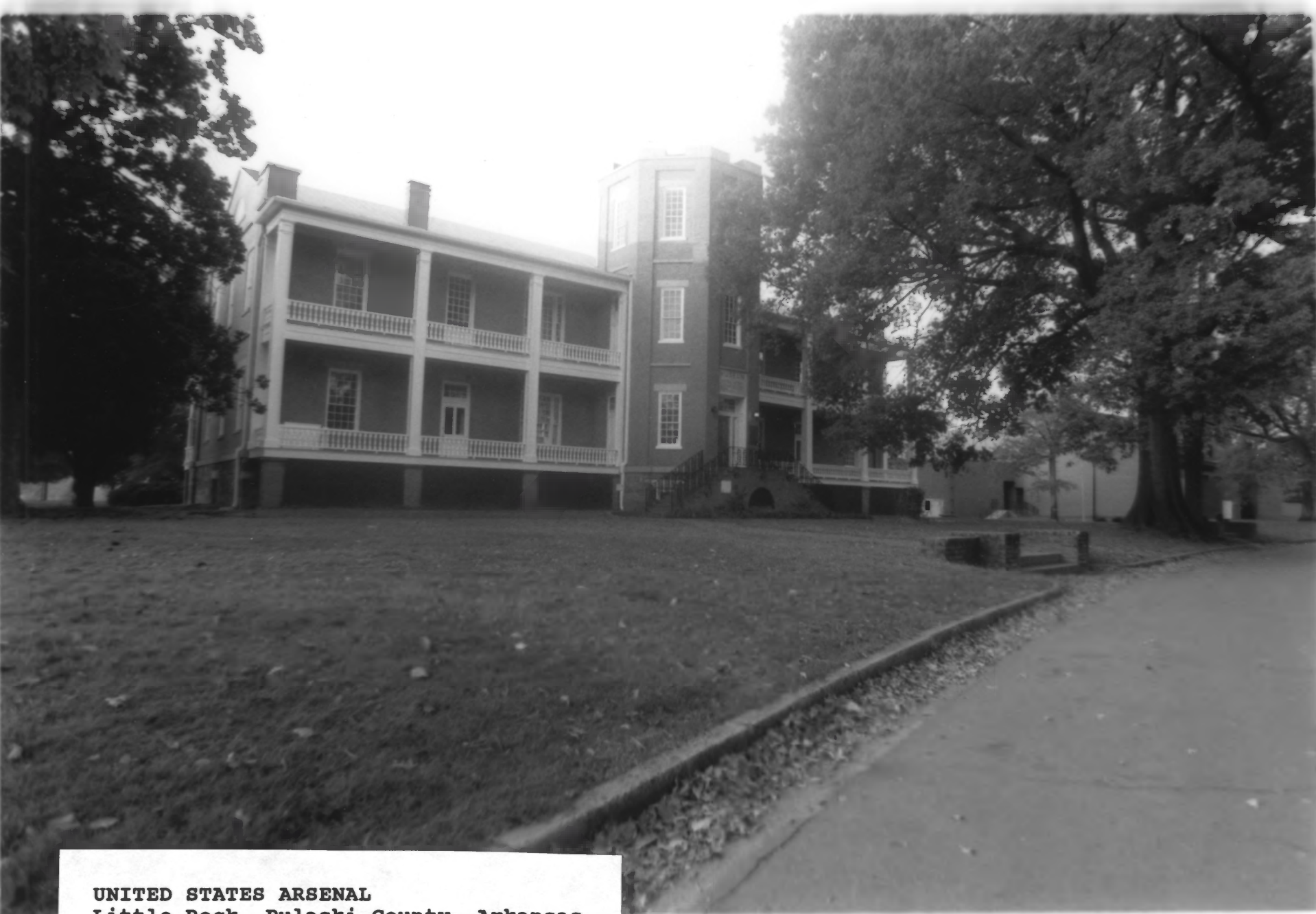
UNITED STATES ARSENAL Little Rock, Pulaski County, Arkansas View from northeast Photo: Todd Ferguson, 1993