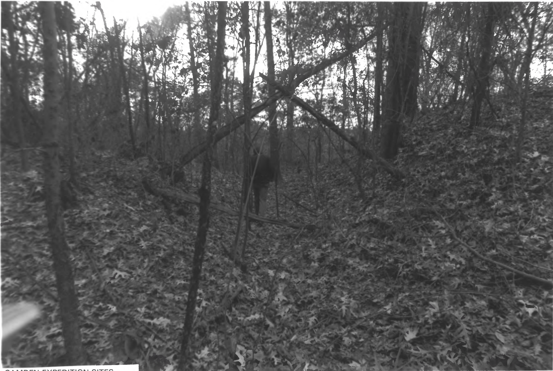
CAMDEN EXPEDITION SITES Fort Lookout/Redoubt A Ouachita County, Arkansas From north at rifle trenches on fort Photo: Don Baker, 1992