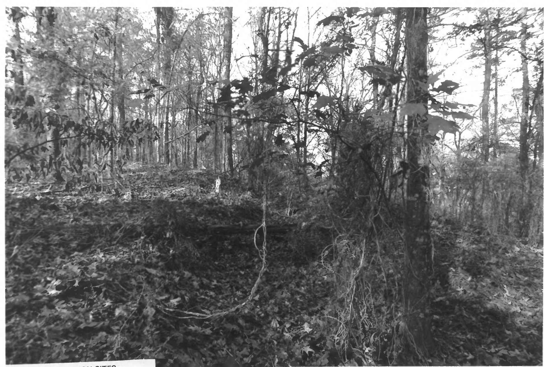
CAMDEN EXPEDITION SITES Fort Lookout/Redoubt A Ouachita County, Arkansas From south at rifle trenches on fort Photo: Don Baker, 1992