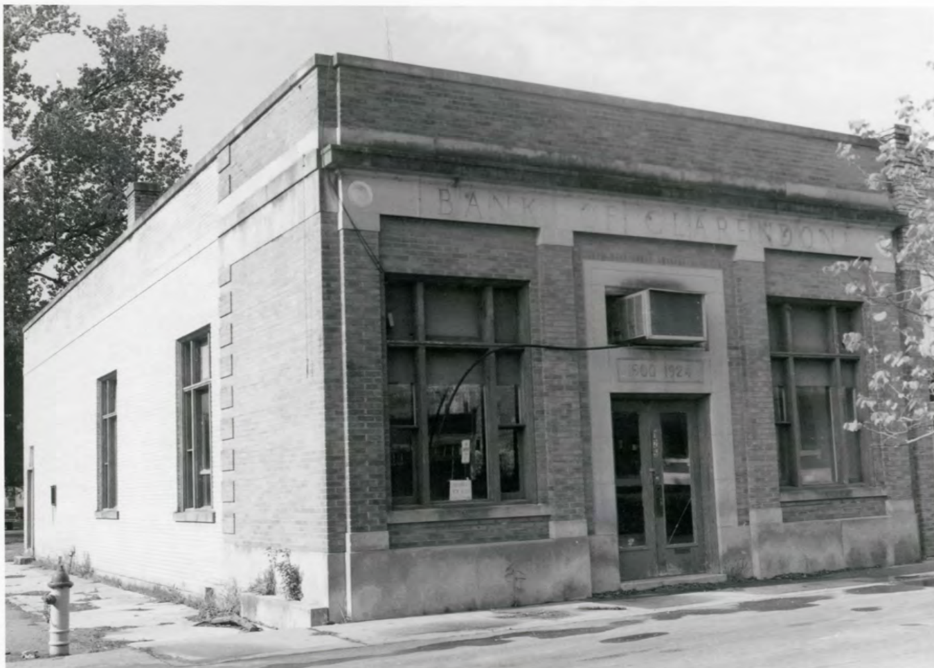
CL-32 Bank of Clarendon 125 Court HISTORIC RESOURCES OF CLARENDON Negatives at AHPP Viewed from the Northwest