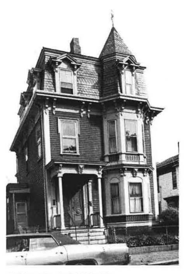
48 Magazine St (CAM.511)