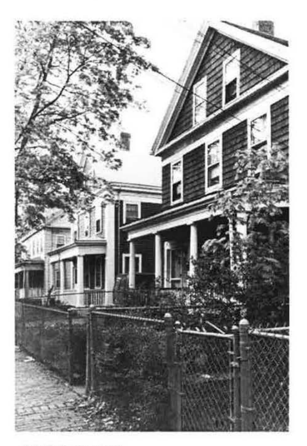
17-23 William St