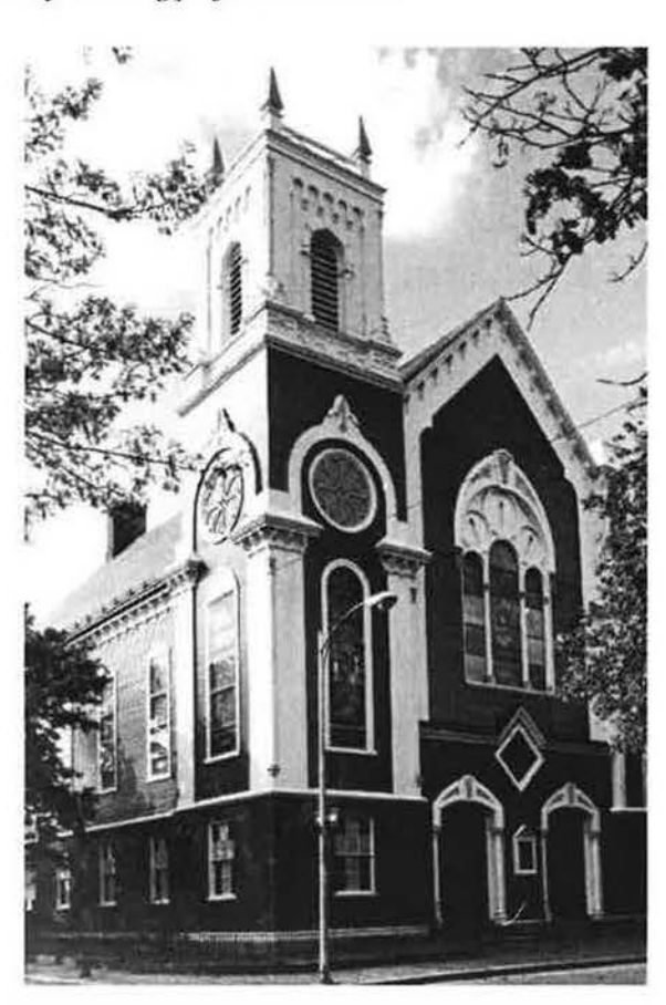
Pilgrim Cong. Church, 35 Magazine St (CAM.510)