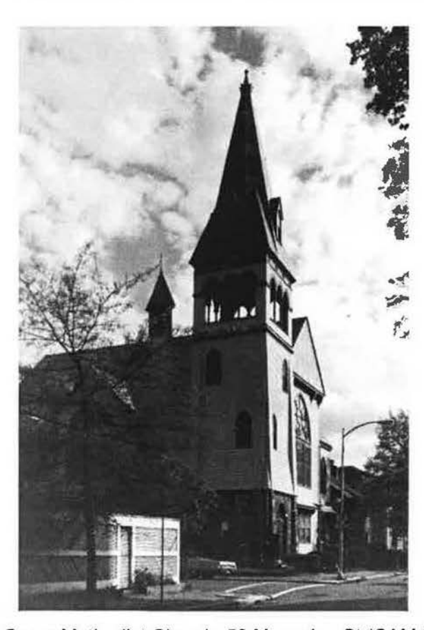
Grace Methodist Church, 56 Magazine St (CAM.513)