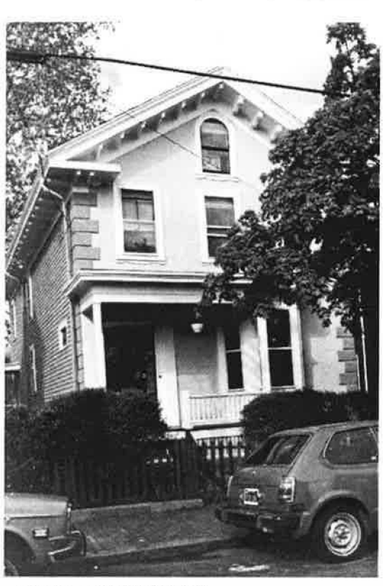
3 William St (CAM.514)