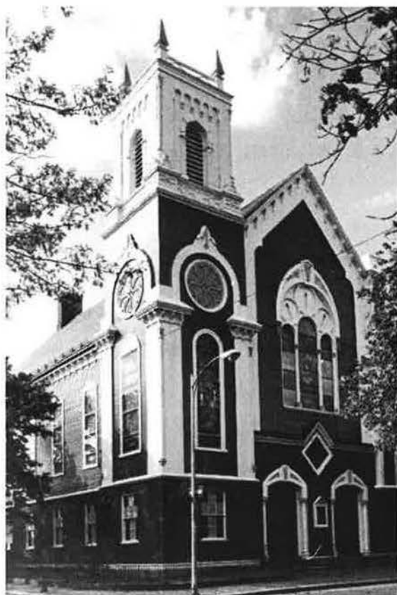
Pilgrim Cong. Church, 35 Magazine St (CAM.510)