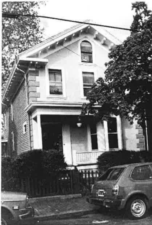
3 William St (CAM.514)