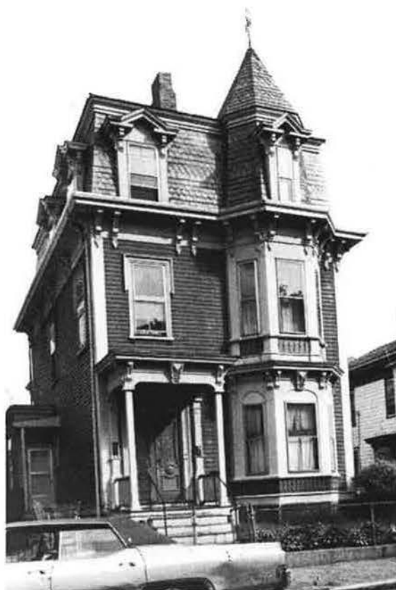
48 Magazine St (CAM.511)