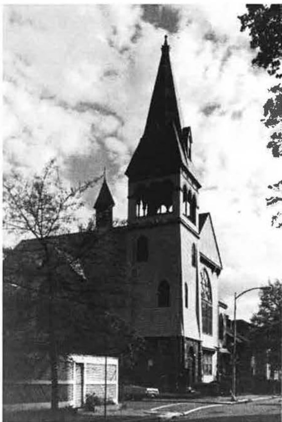
Grace Methodist Church, 56 Magazine St (CAM.513)