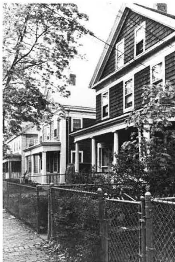
17-23 William St