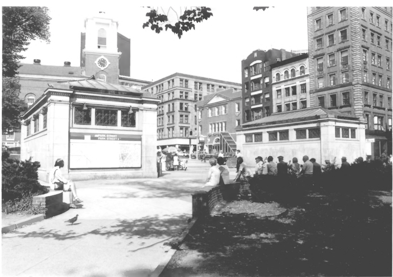
Modern view of Tremont Street Subway Kiosks (NHL), from the Tremont Street Mall, Boston Common. (Polly Matherly, National Park Service, 1975)