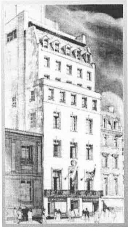
Rendering, date unknown

Women's National Republican Club Name of Property New York County, New York County and State