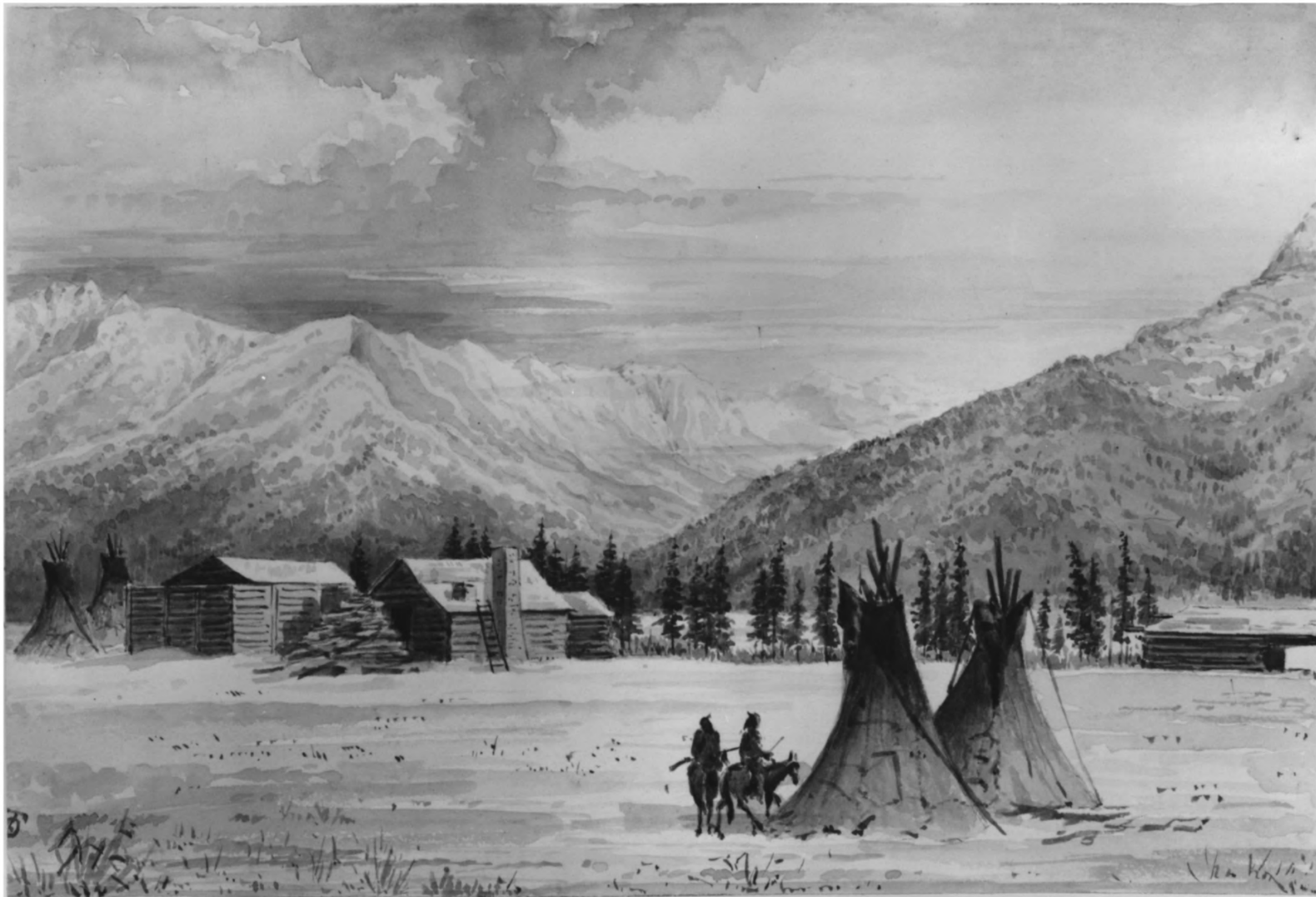
Hudson Bay Trading Post — On Flathead Indian Reservation, Montana Terr.