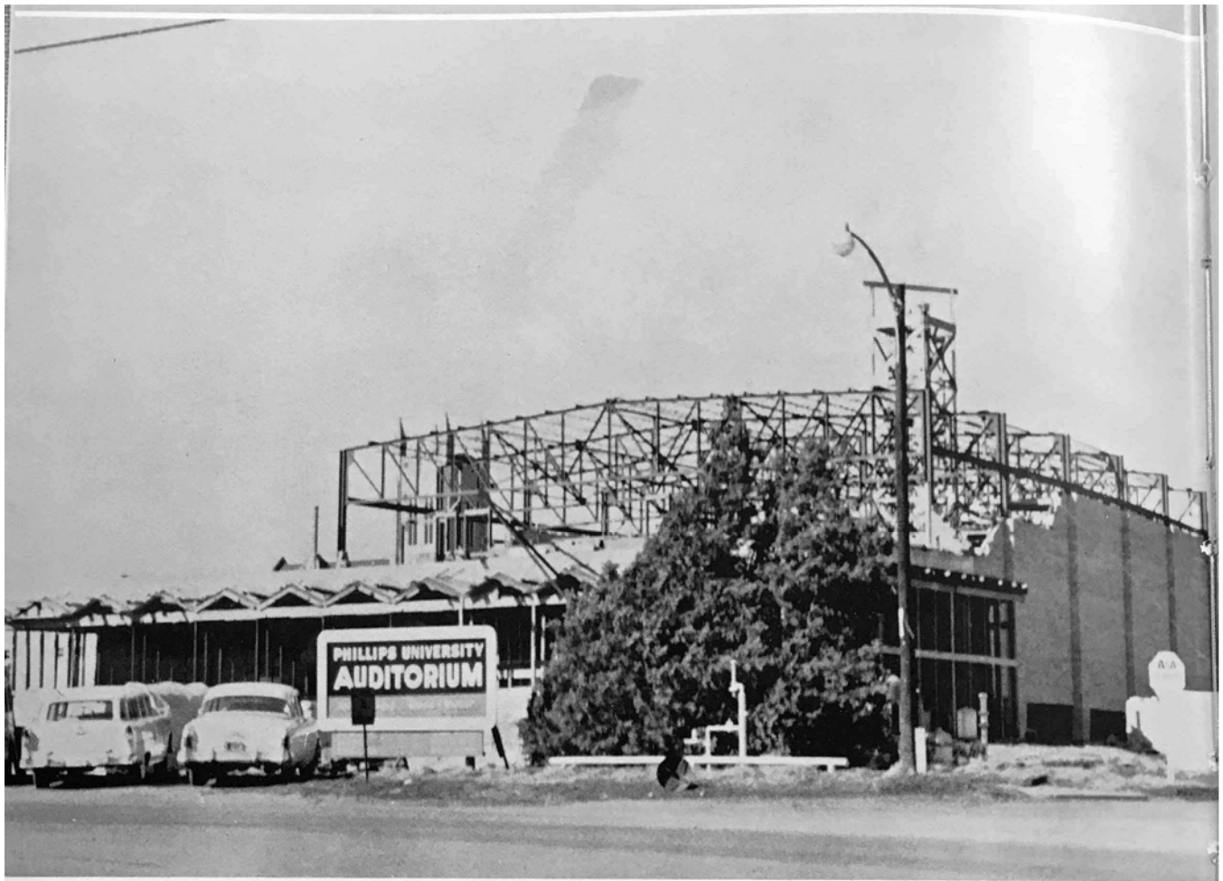
Fig. 1. Briggs Auditorium under construction, 1957.