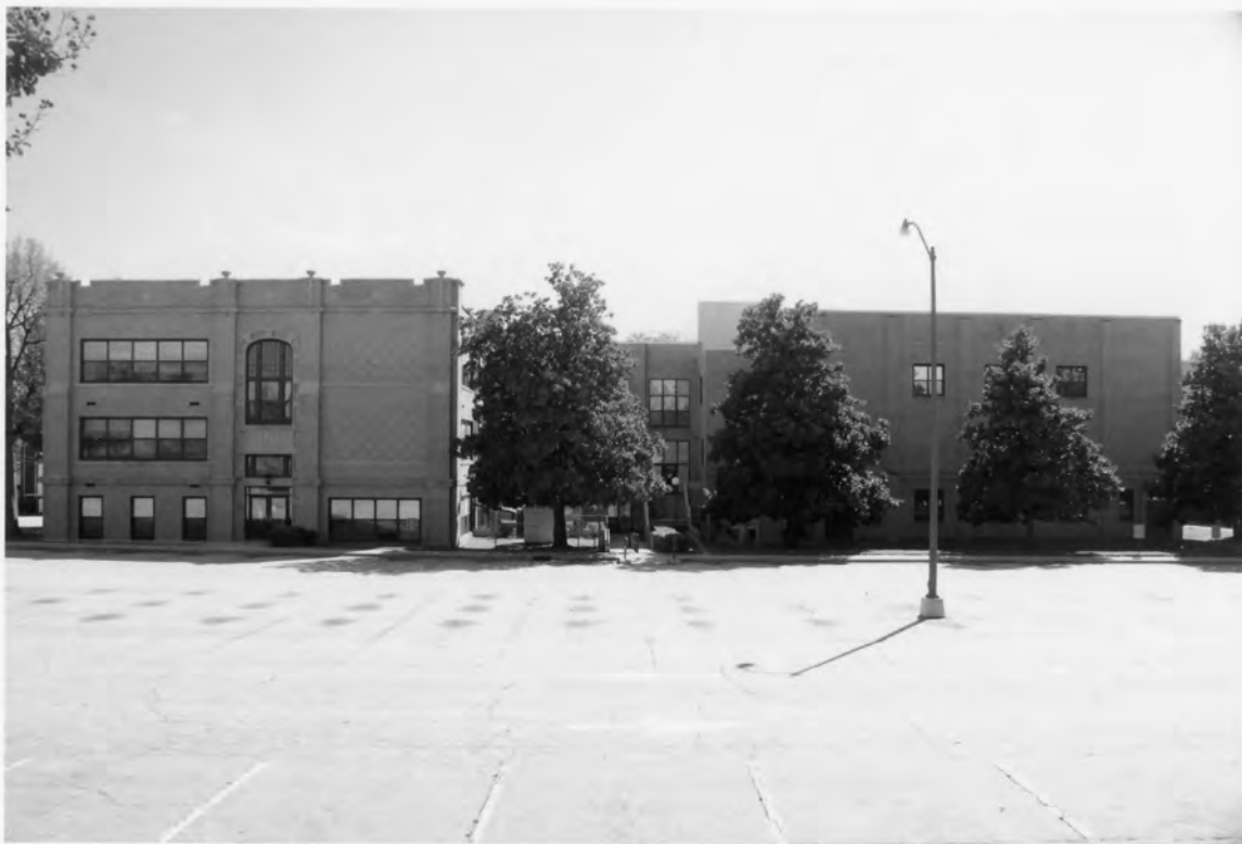
13. Frank Evans High School 142 S. Dean Street, Spartanburg Spartanburg County, South Carolina