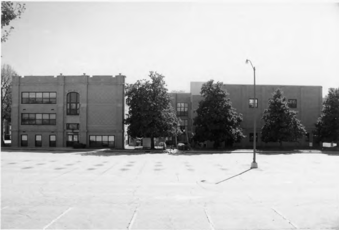
13. Frank Evans High School 142 S. Dean Street, Spartanburg Spartanburg County, South Carolina