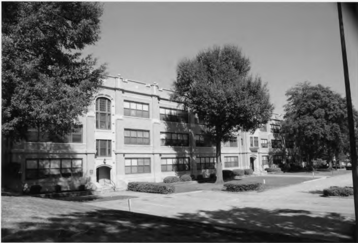
6. Frank Evans High School 142 S. Dean Street, Spartanburg Spartanburg County, South Carolina