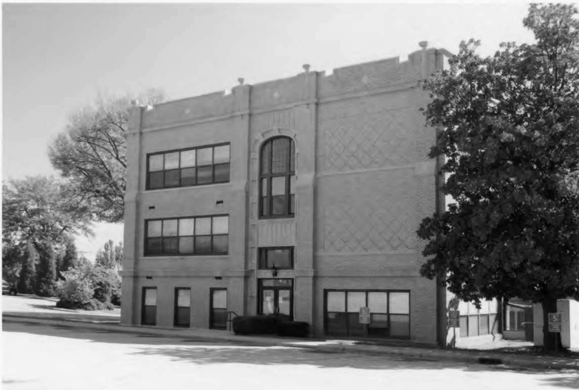
12. Frank Evans High School 142 S. Dean Street, Spartanburg Spartanburg County, South Carolina