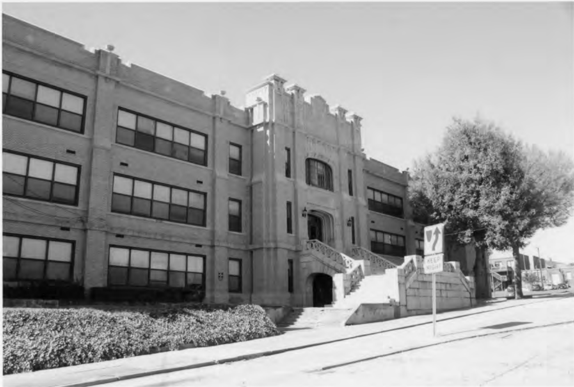
3. Frank Evans High School 142 S. Dean Street, Spartanburg Spartanburg County, South Carolina