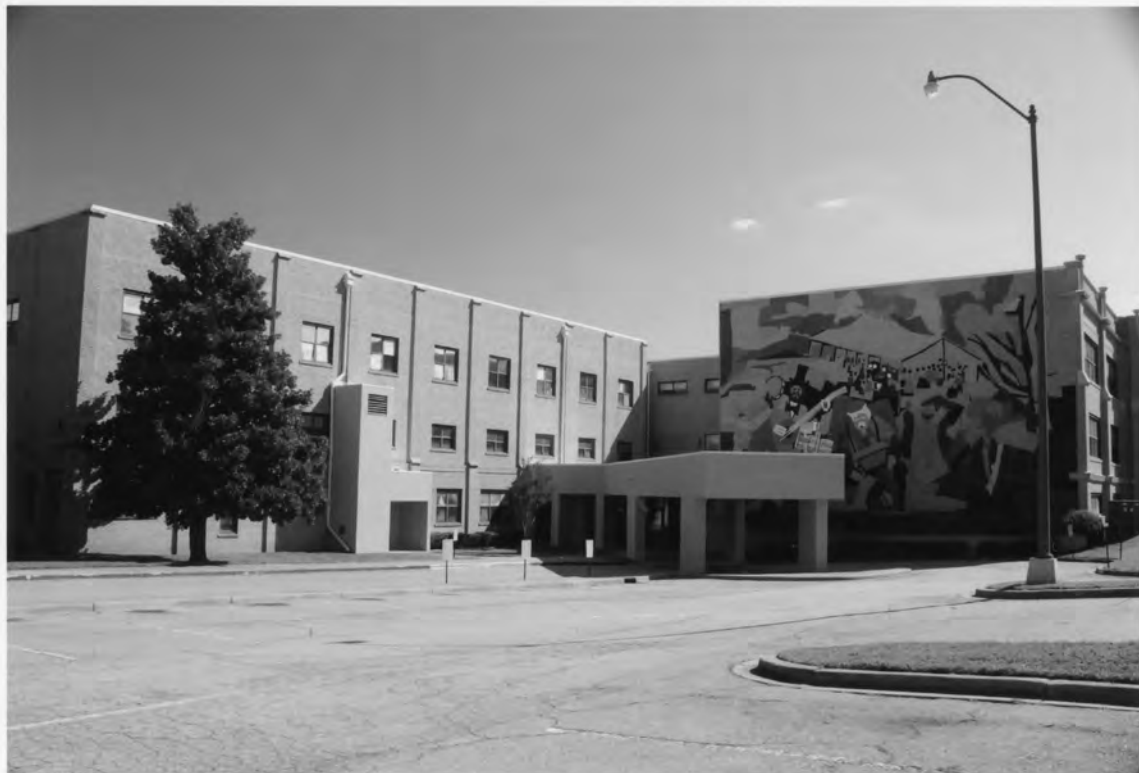
11. Frank Evans High School 142 S. Dean Street, Spartanburg Spartanburg County, South Carolina

Portion of north elevation and west elevation, looking southeast