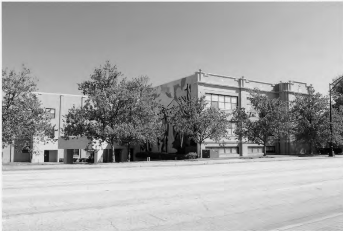
10. Frank Evans High School 142 S. Dean Street, Spartanburg Spartanburg County, South Carolina