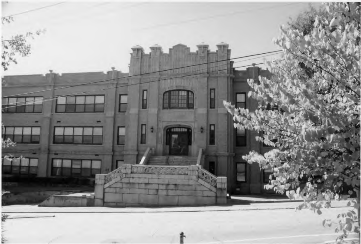
1. Frank Evans High School 142 S. Dean Street, Spartanburg Spartanburg County, South Carolina