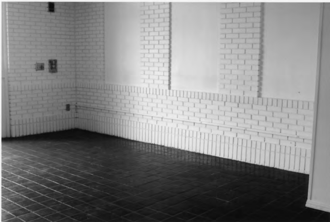
27. Frank Evans High School 142 S. Dean Street, Spartanburg Spartanburg County, South Carolina