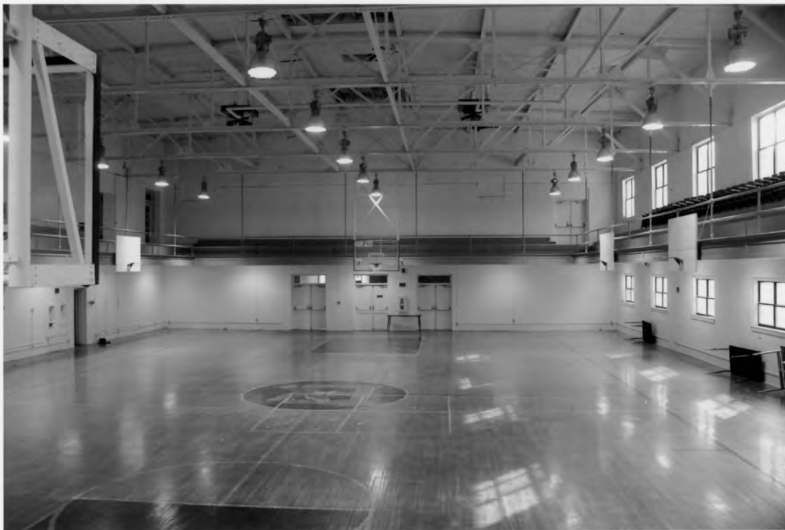
24. Frank Evans High School 142 S. Dean Street, Spartanburg Spartanburg County, South Carolina