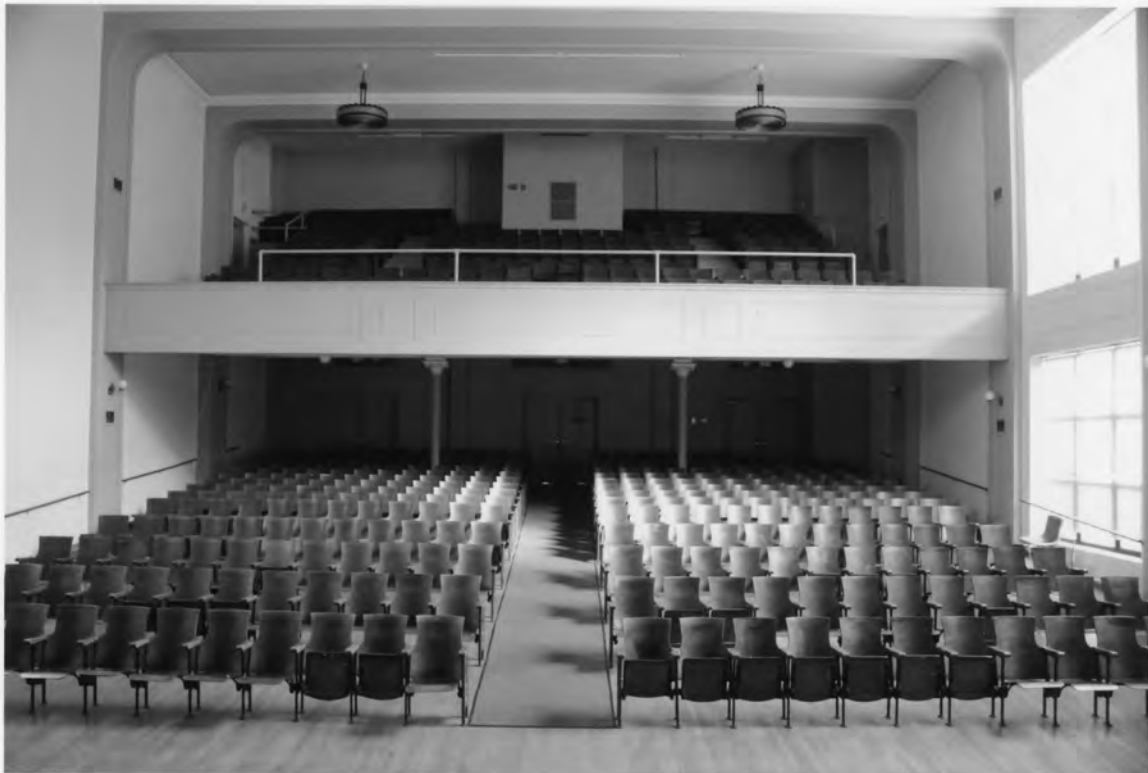
19. Frank Evans High School 142 S. Dean Street, Spartanburg Spartanburg County, South Carolina

Auditorium seating and balcony, looking from stage