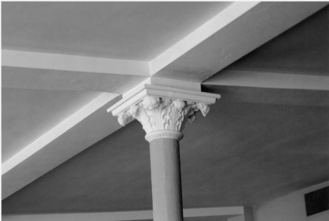
23. Frank Evans High School 142 S. Dean Street, Spartanburg Spartanburg County, South Carolina

Decorative capital on column supporting balcony in auditorium