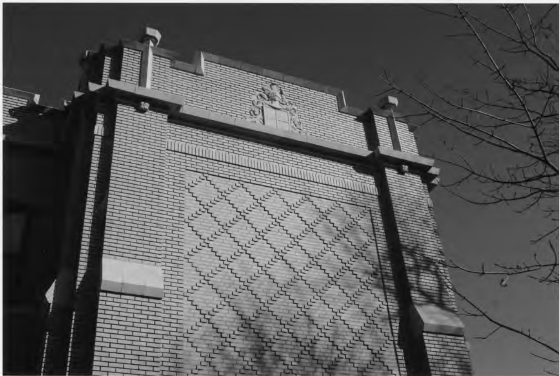
15. Frank Evans High School 142 S. Dean Street, Spartanburg Spartanburg County, South Carolina

Detail of diapering pattern in brickwork, east elevation