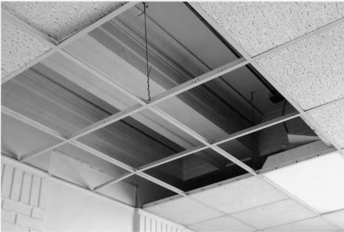
28. Frank Evans High School 142 S. Dean Street, Spartanburg Spartanburg County, South Carolina

Original ceiling details revealed above later dropped ceiling