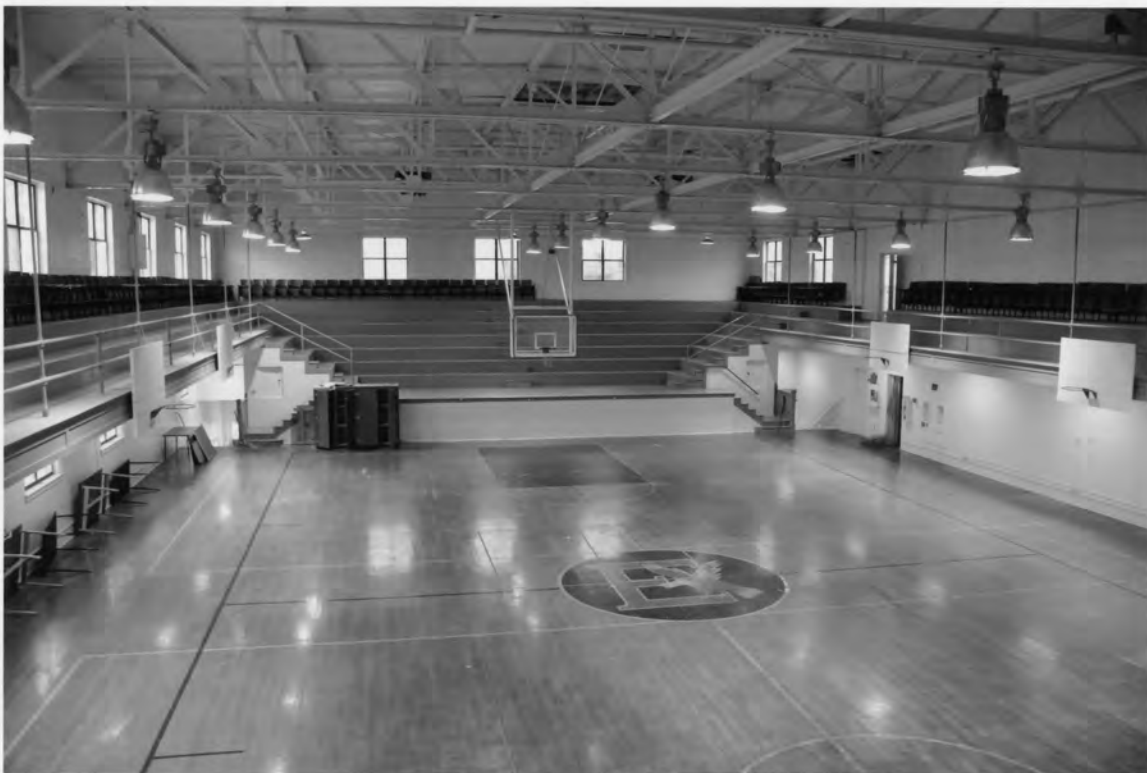
25. Frank Evans High School 142 S. Dean Street, Spartanburg Spartanburg County, South Carolina

Gymnasium interior, bleachers at end of basketball court