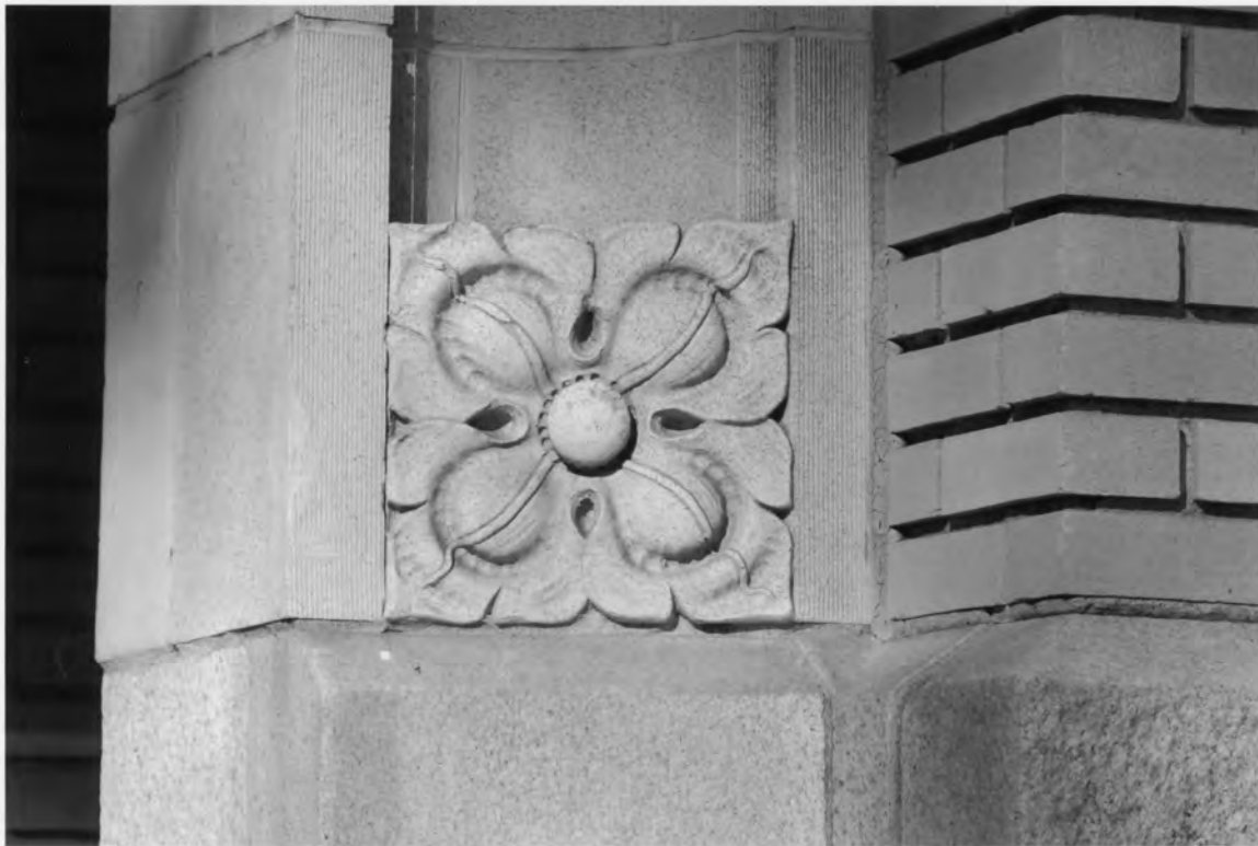
16. Frank Evans High School 142 S. Dean Street, Spartanburg Spartanburg County, South Carolina

Detail of decorative rosette at entrance, east elevation