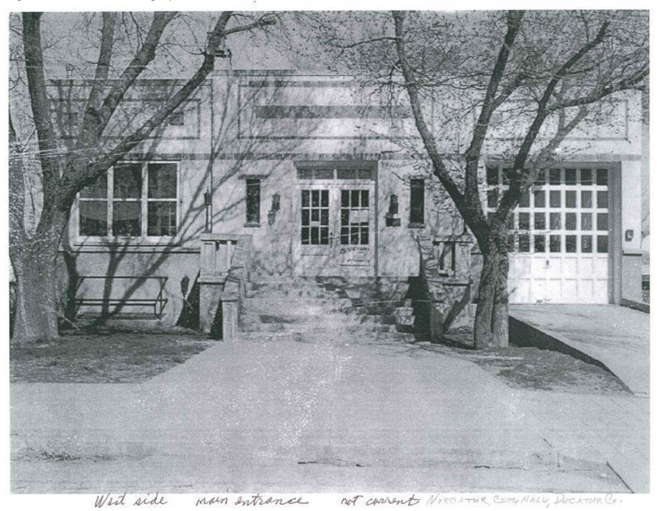
Figure 3: Historic Photograph