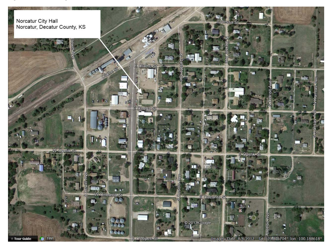
Figure 2: Aerial Image