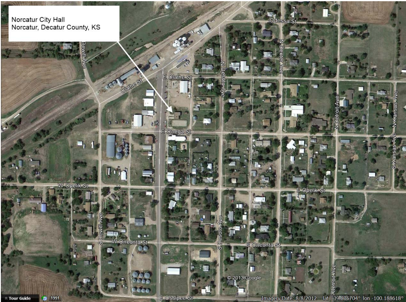
Figure 2: Aerial Image