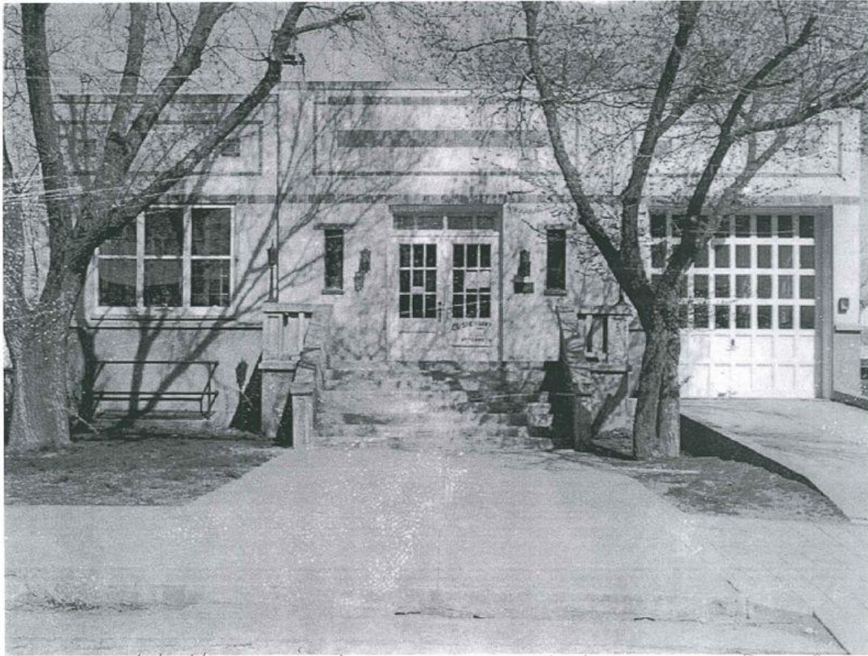
West side main entrance not current NORCATOUR CITY HALL, DECATUR Co.