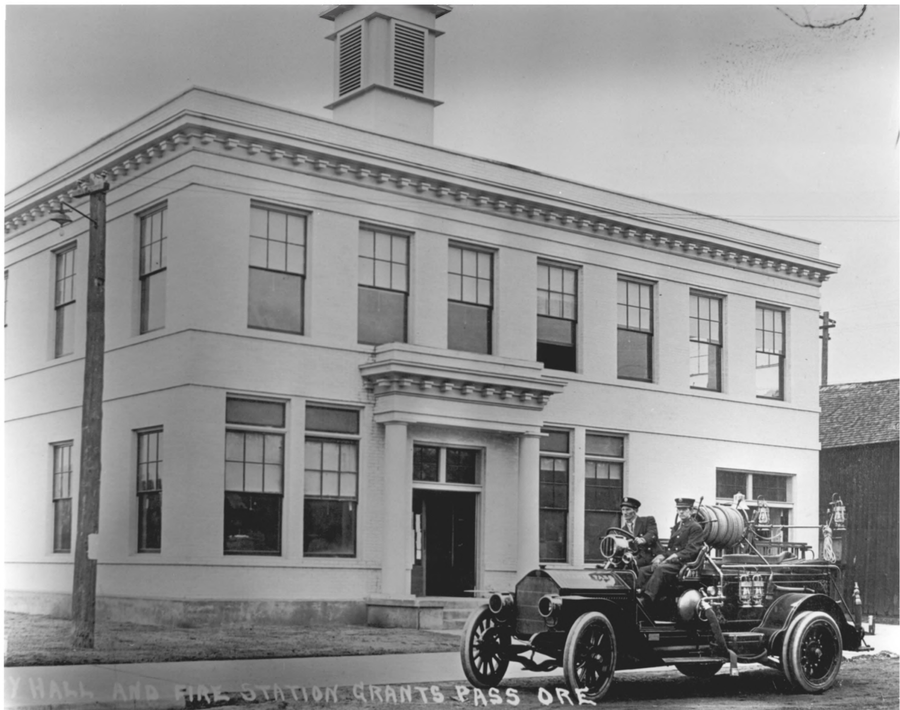
Y HALL AND FIRE STATION GRANTS PASS ORE