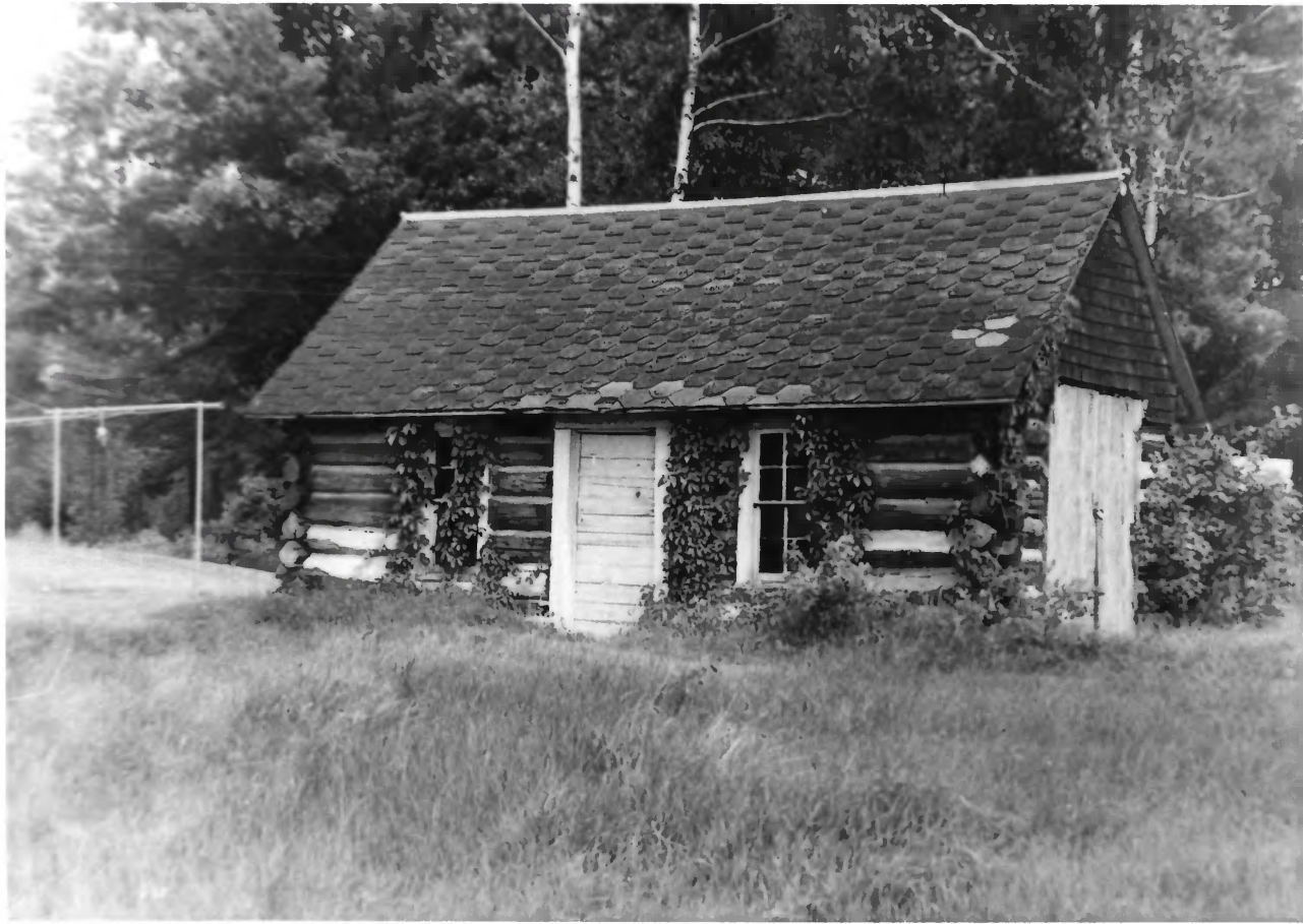
OLD CUT FOOT SIOUX RANGER STATION