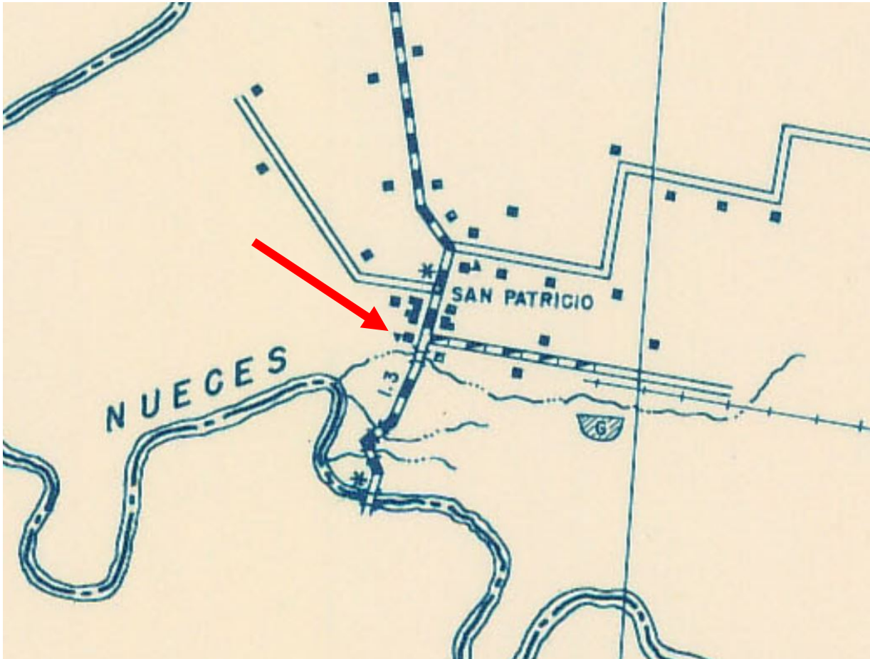
Figure 1: General Highway Map San Patricio County Texas, c.1940. The site of the Sons of San Patricio monument, which was erected on the school grounds (also called Constitution Square), is indicated by a red arrow. Its location is confirmed by the map legend that uses a box with flag to symbolize a school.