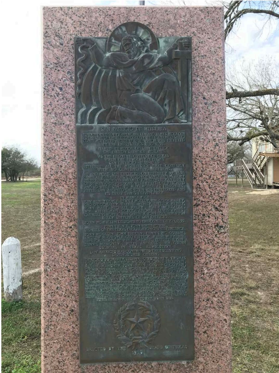
Photo 2: Bronze bas-relief plaque, including inscription—camera facing west, February 15, 2018