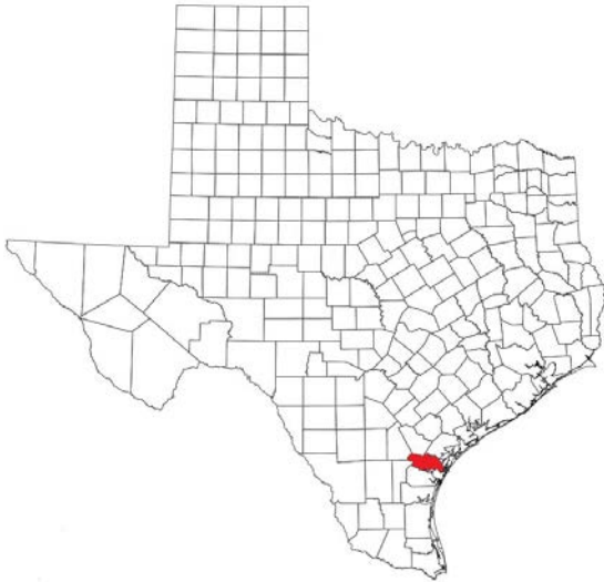
Latitude: 27.951792°N Longitude: -97.772943° W