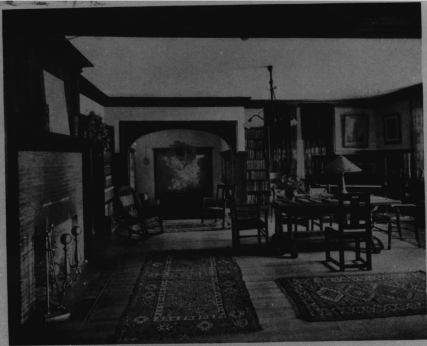
A VIEW OF THE LIBRARY AND THE DEN THIS IS WHERE THE GIRLS DELIGHT TO CONGREGATE