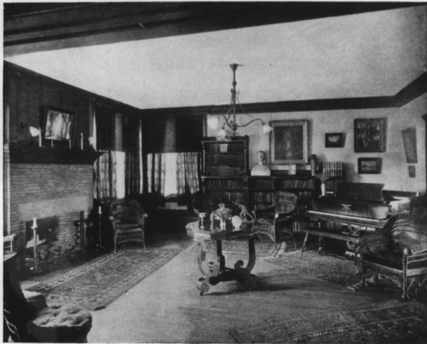
THE GENERAL ATMOSPHERE OF THE SCHOOL IS HOMELIKE CONCERTS AND RECITALS ARE OFTEN HELD IN THIS ROOM