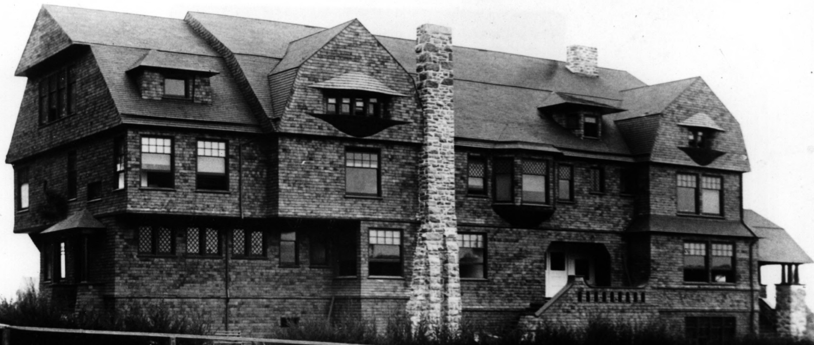
ANNA HEAD SCHOOL, on Bowditch between Channing Way and Haste Established in 1887, the school prepared hundreds of young women for the University of California, many for Stanford, Mills College and eastern colleges.