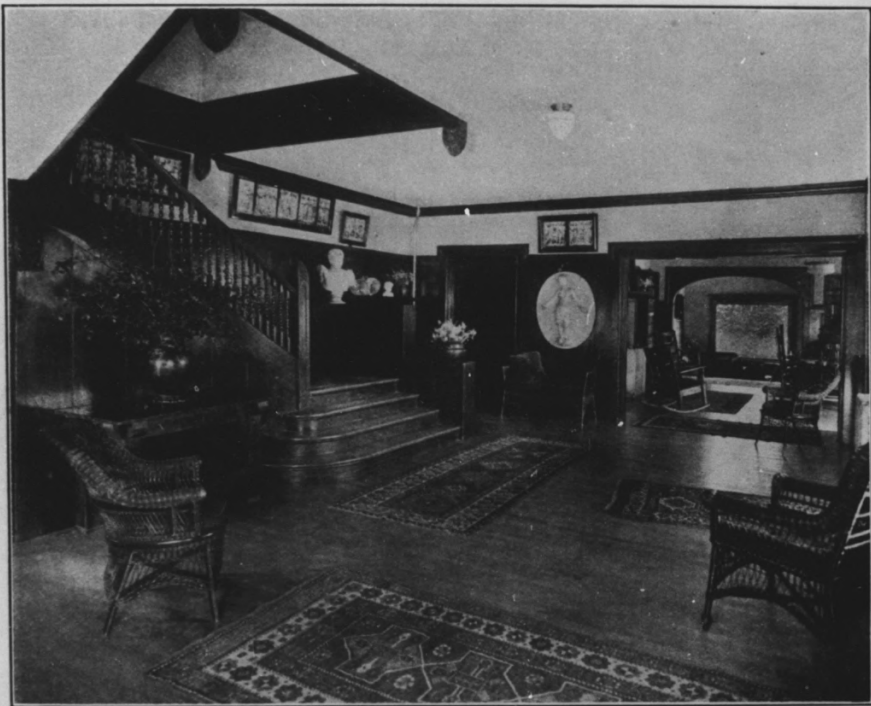
THE MAIN STAIRCASE SHOWS THE SIMPLE AND EFFECTIVE STYLE OF ARCHITECTURE WHICH PREVAILS