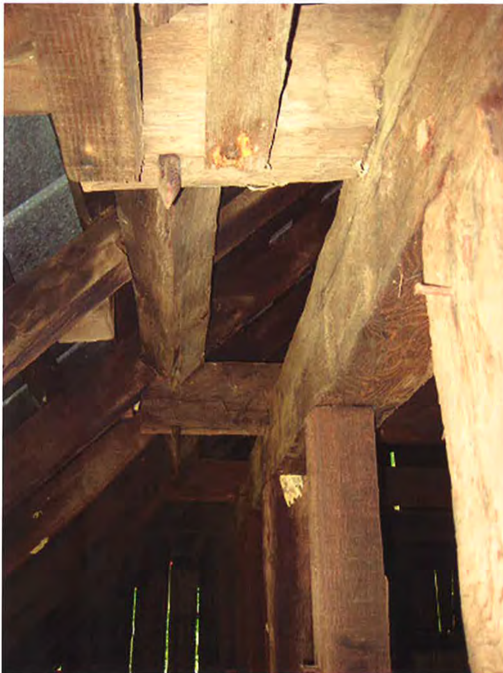
Roof framing detail showing tilted false plate (from below), 8/11/2014

De La Brooke Tobacco Barn (SM-411), St. Mary's County, Maryland