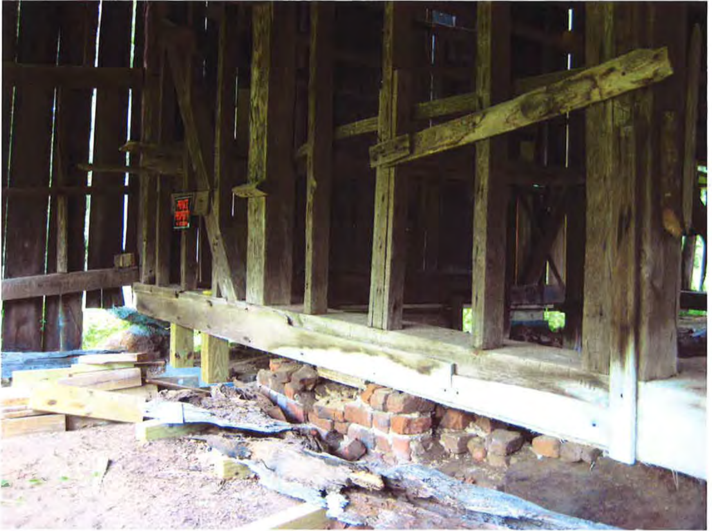
Interior framing and foundation detail, view from southeast, 8/11/2014

De La Brooke Tobacco Barn (SM-411), St. Mary's County, Maryland