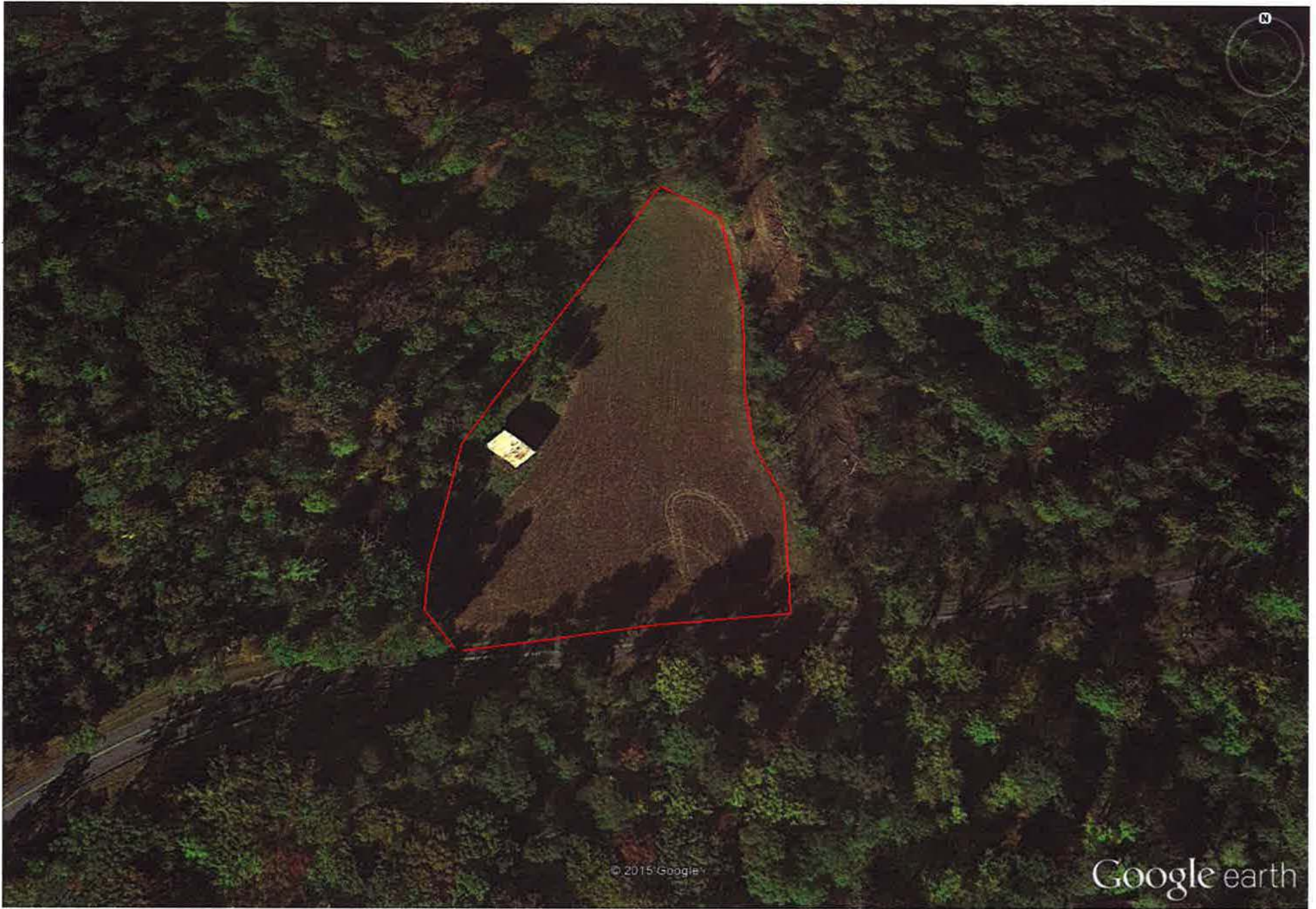
De La Brooke Barn (SM-411), St. Mary's County, MD