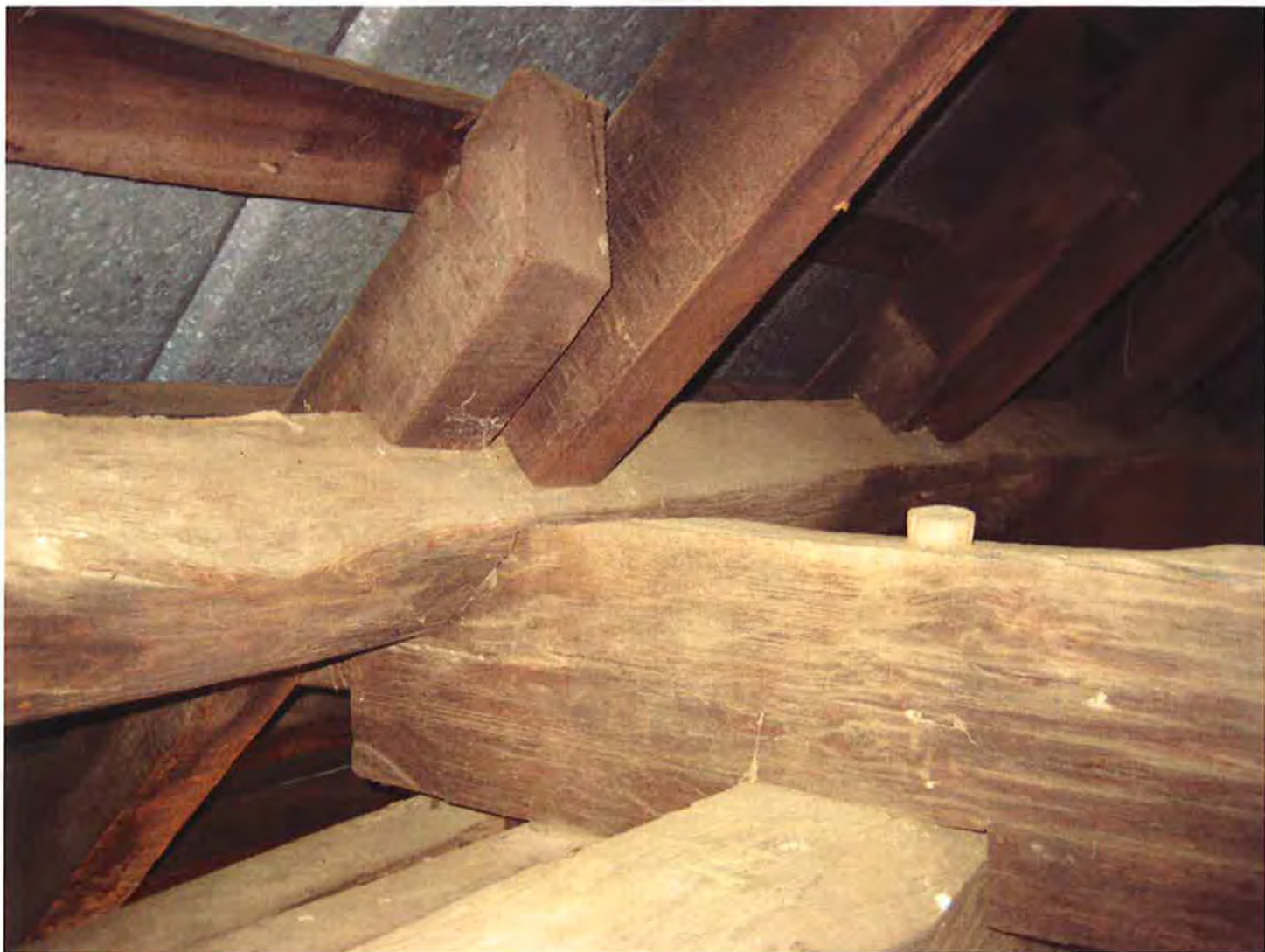
Roof framing detail showing tilted false plate, 8/11/2014

De La Brooke Tobacco Barn (SM-411), St. Mary's County, Maryland