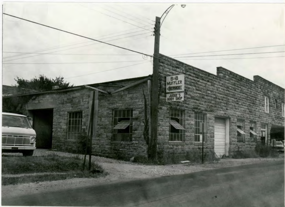
Historic Resources of Stone County C. B. Case Motor Co. Building, ST-111 Mountain View Don Brown, photographer 1983 Negative on file at the AHPP Viewed from the southwest