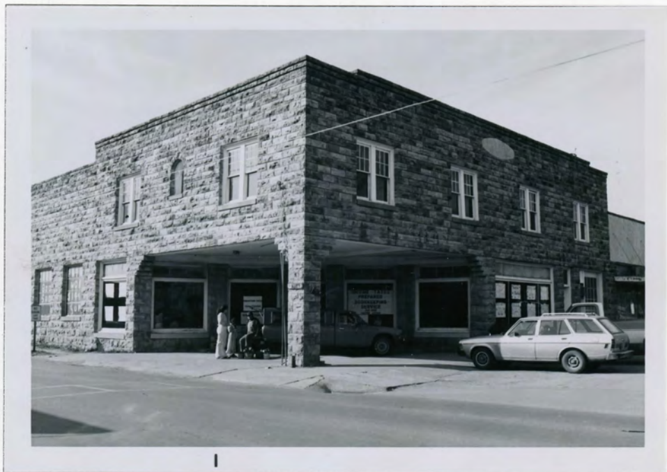
Historic Resources of Stone County C. B. Case Motor Co. Building, ST-111 Mountain View Don Brown, photographer 1983 Negative on file at the AHPP Viewed from the southeast