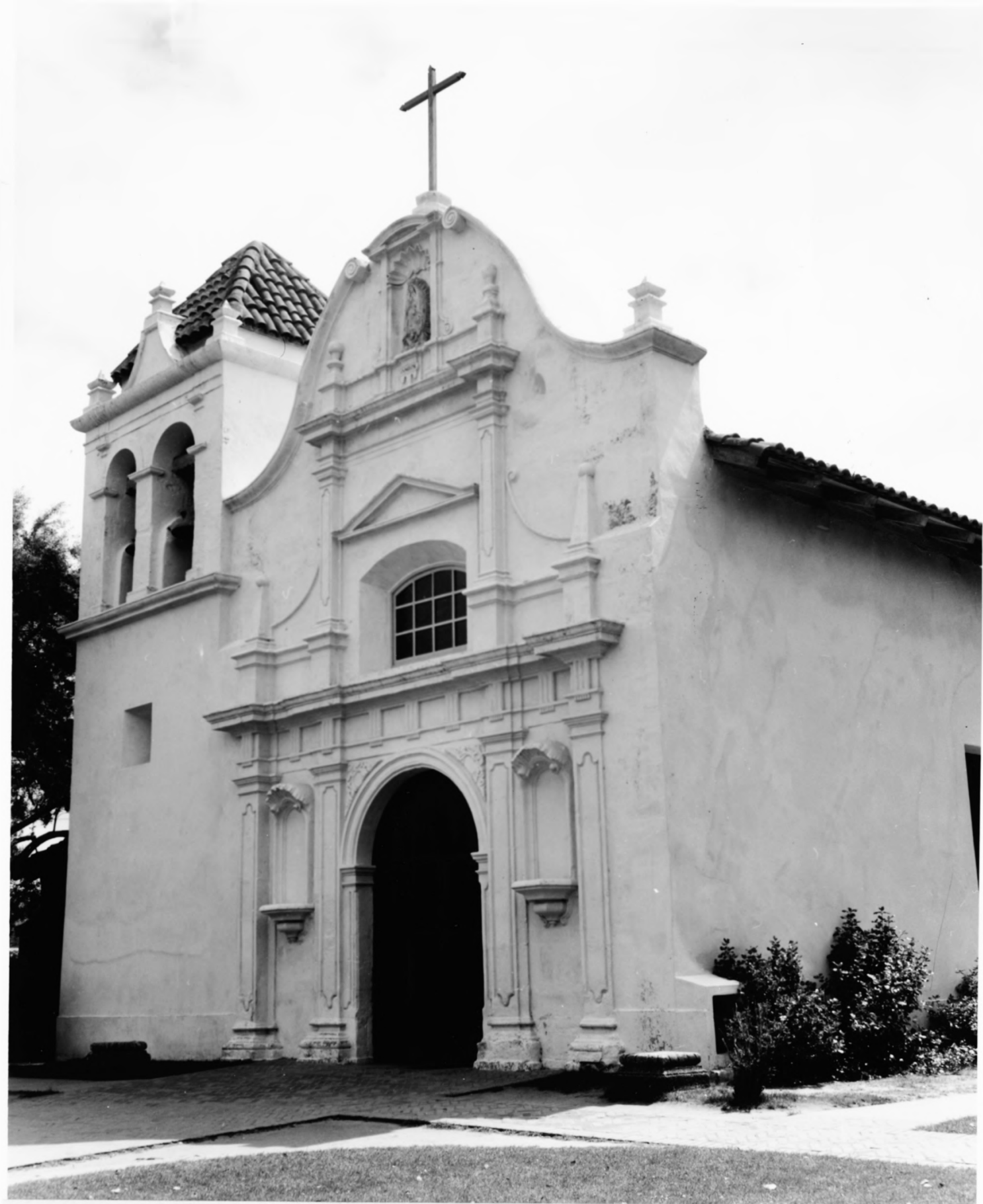
Royal Presidio Chapel, Monterey, California