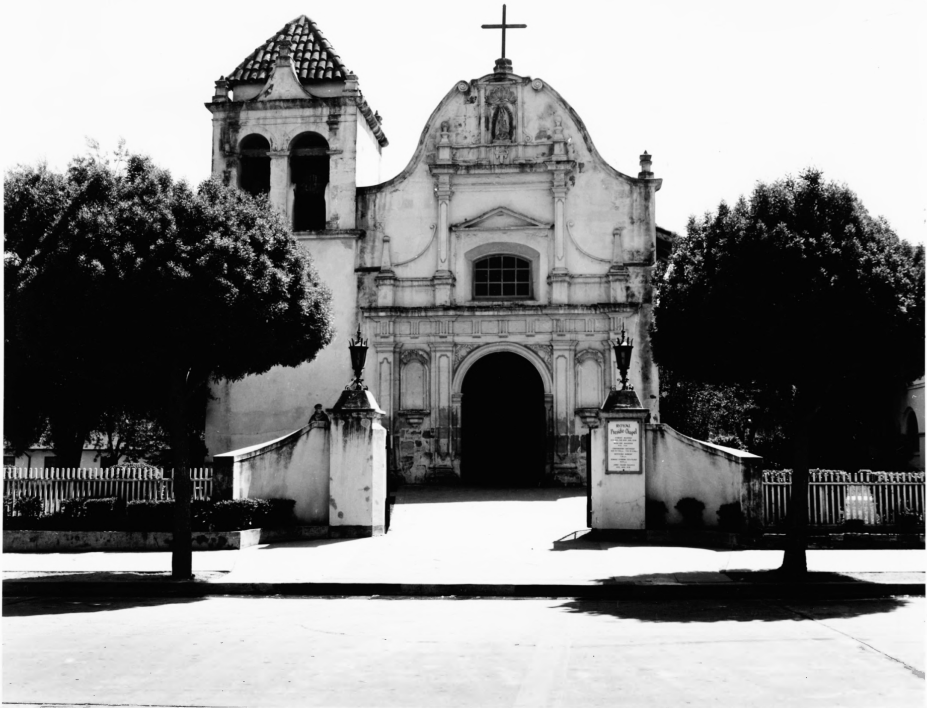
Royal Presidio Chapel, Presidio of Monterey, California