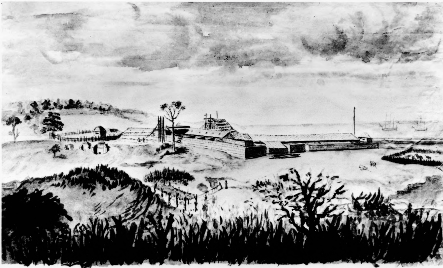
PRECIDIO DE MONTERREY 305x490mm