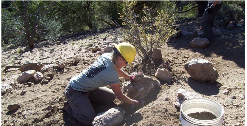
Costilla County receives assistance from Los Valles Conservation Corps to restore portions of the county's Greenbelt Trail.

The county also saw this as an opportunity to engage young adults in a service project that will improve outdoor educational opportunities for the community's enjoyment while teaching them about resource management and the significance of protecting open space. In the end, the project proved to be of great benefit to both the community who lacks available and well-maintained public lands and to the students involved in renovating the Greenbelt Trail and Rito Seco Park.