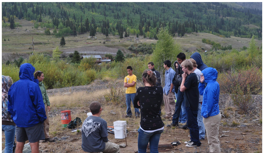
Silverton students learning about river restoration.

Create new trails and other amenities in and around Silverton incorporating the ideas of adaptive re-use of impacted lands. Interpretive facilities that tell the many stories of Silverton will be found on the trail and in new and existing parks. Implementation of the many phases of this project - interpretive sign content research,