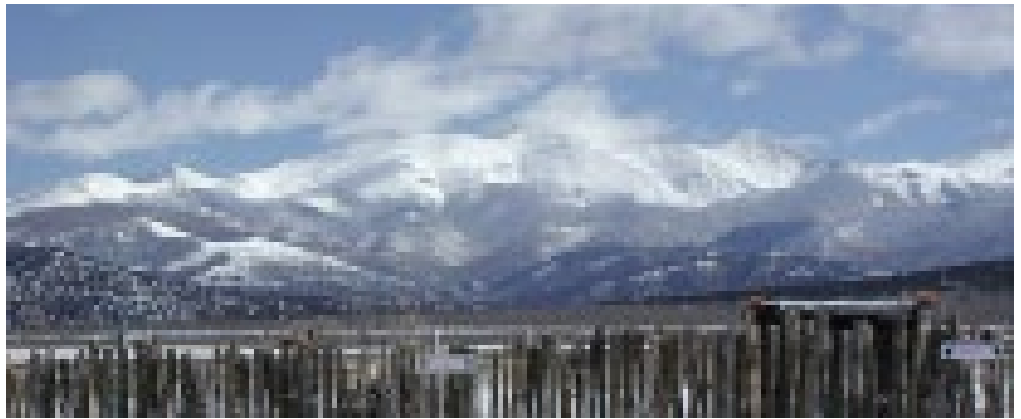
The Sangre de Cristo Mountains, a cultural landscape in the Sangre de Cristo National Heritage Area and scenic icon for Costilla County Trails.