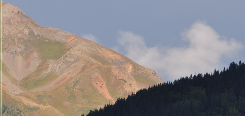
A view of the San Juan mountains from Silverton