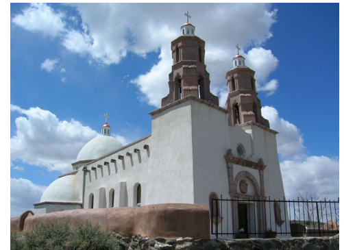
The Sangre De Cristo Valley is rich with cultural history.