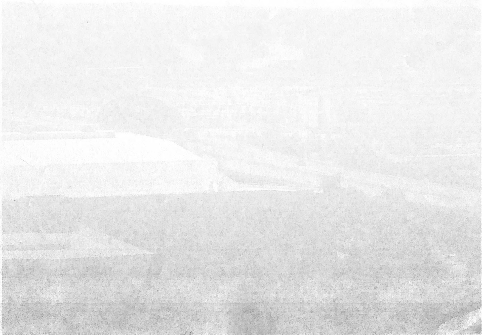
STABRIE GROVE/4/ DOUGLAS COUNTY, NEBRASKA / JUNE 6, 2007 / ARIAL VIEW FROM CENTRAL HIGH SCHOOL