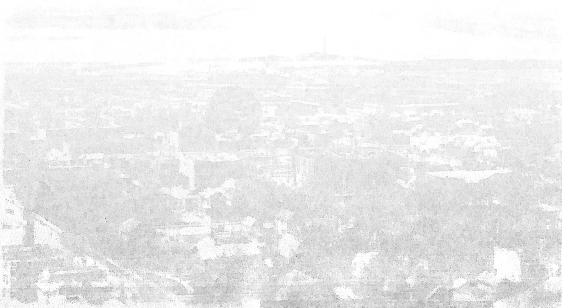
STABRIE GROCERY / DOUGLAS COUNTY, NEBRASKA / 1900 / ARIAL VIEW FROM CENTRAL HIGH SCHOOL