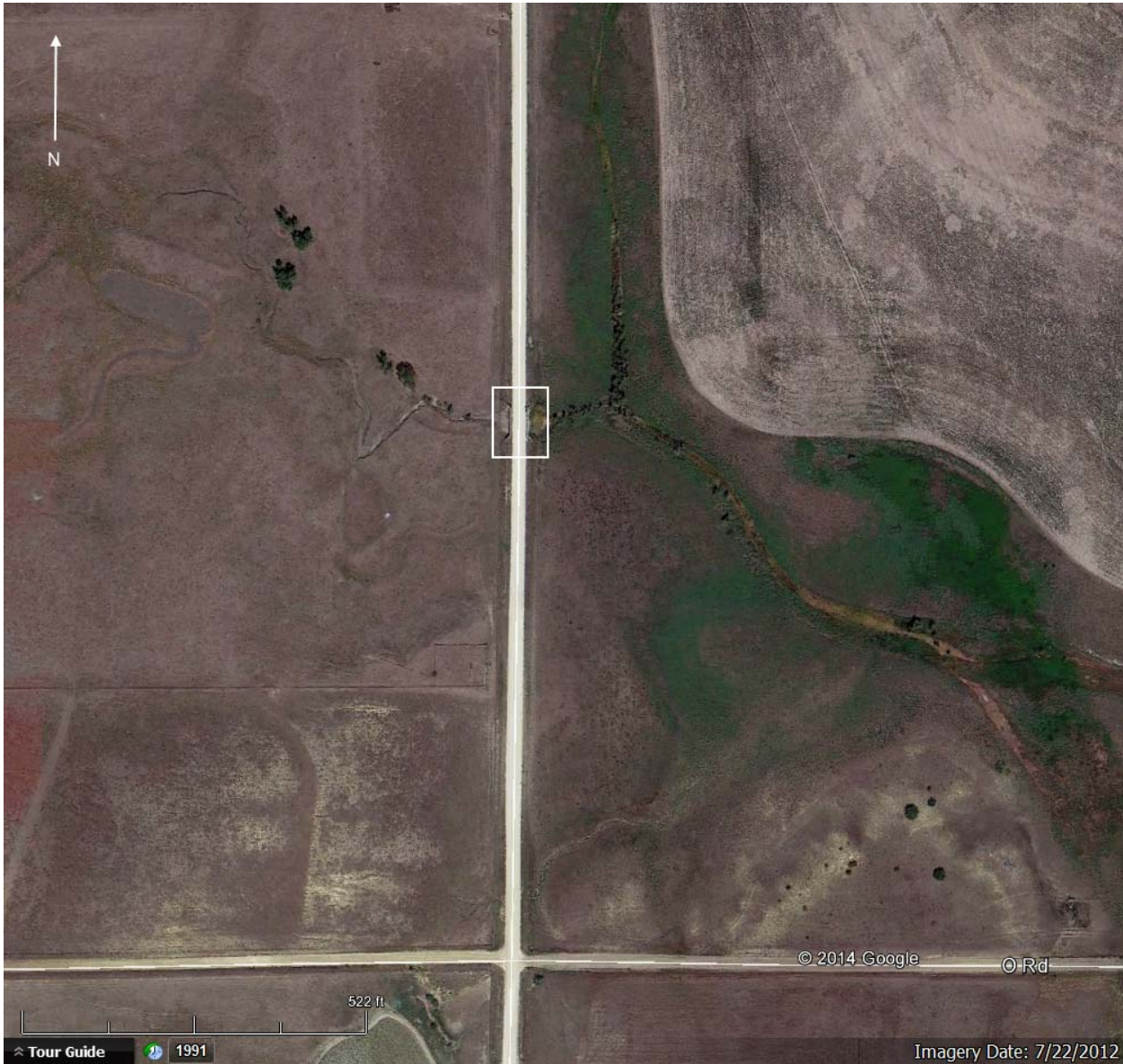
Figure 2: Close-in: Antelope Creek Bridge location (Google Earth)

Mitchell County, Kansas County and State