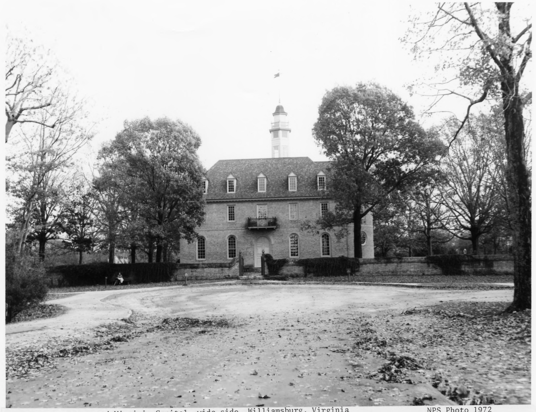
Reconstructed Virginia Capitol, wide side, Williamsburg, Virginia