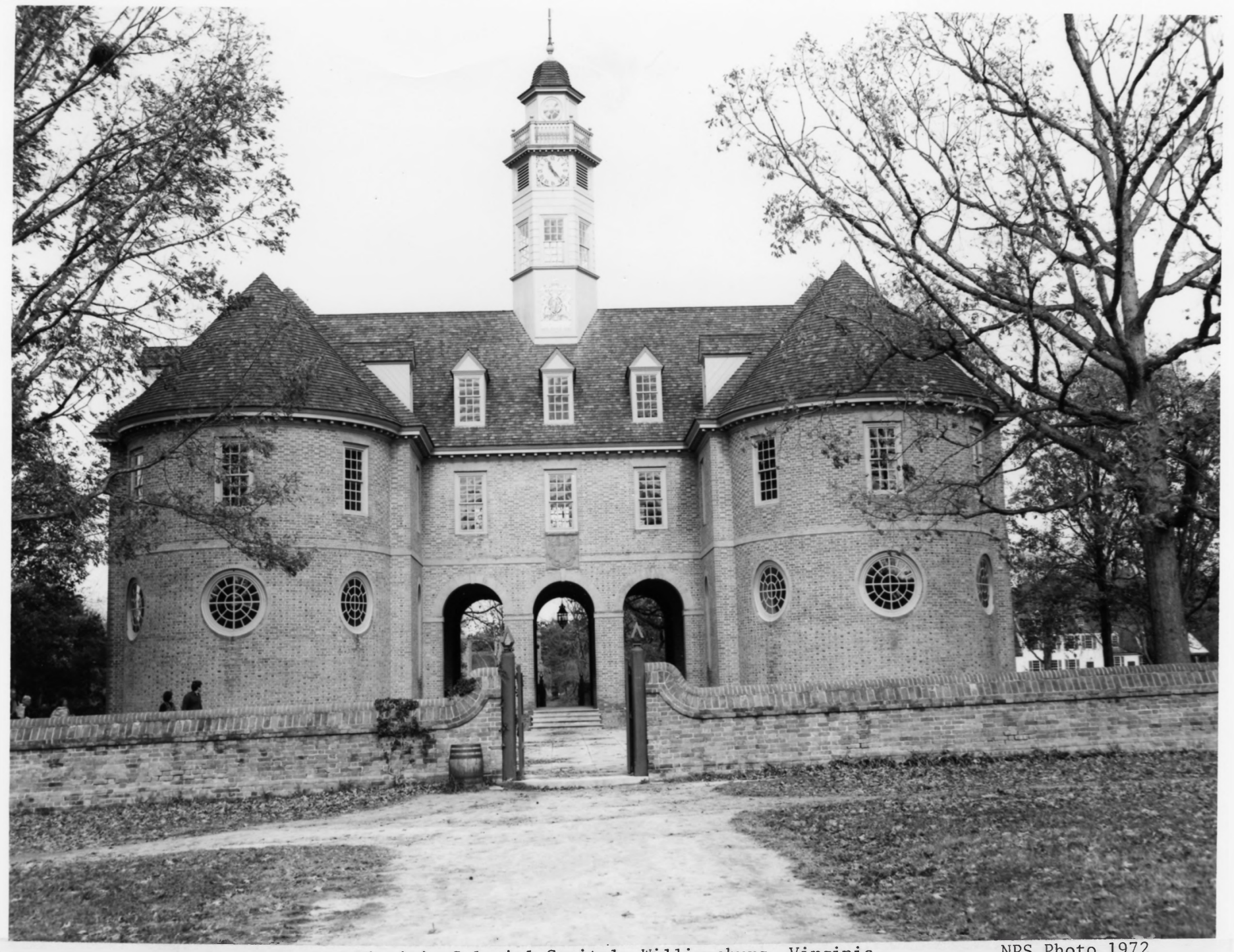
Reconstructed Virginia Colonial Capitol, Williamsburg, Virginia