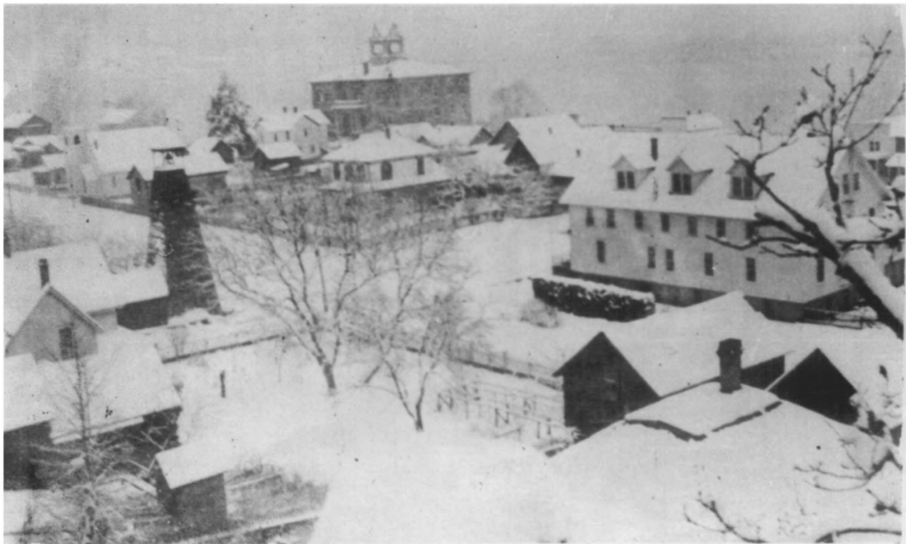
ST. HELENS ABOUT 1906, SHOWING METHODIST CHURCH, BELL TOWER AND COURTHOUSE