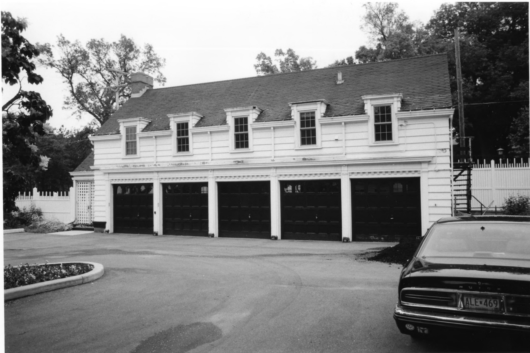
Edward and Markell Brooks Sr., House