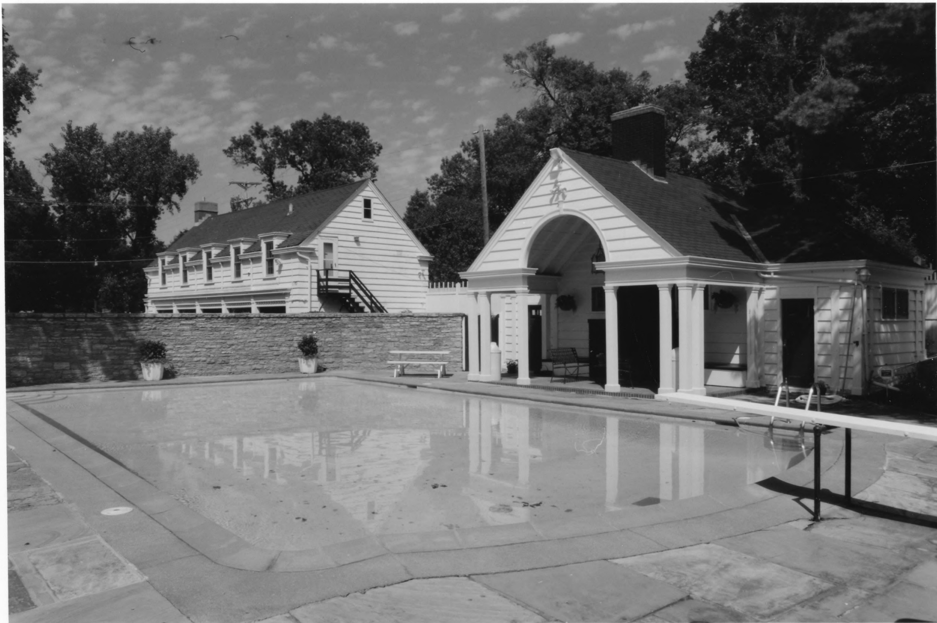
Edward and Markell Brooks Sr., House Ramsey Co., Mn 013483-24A