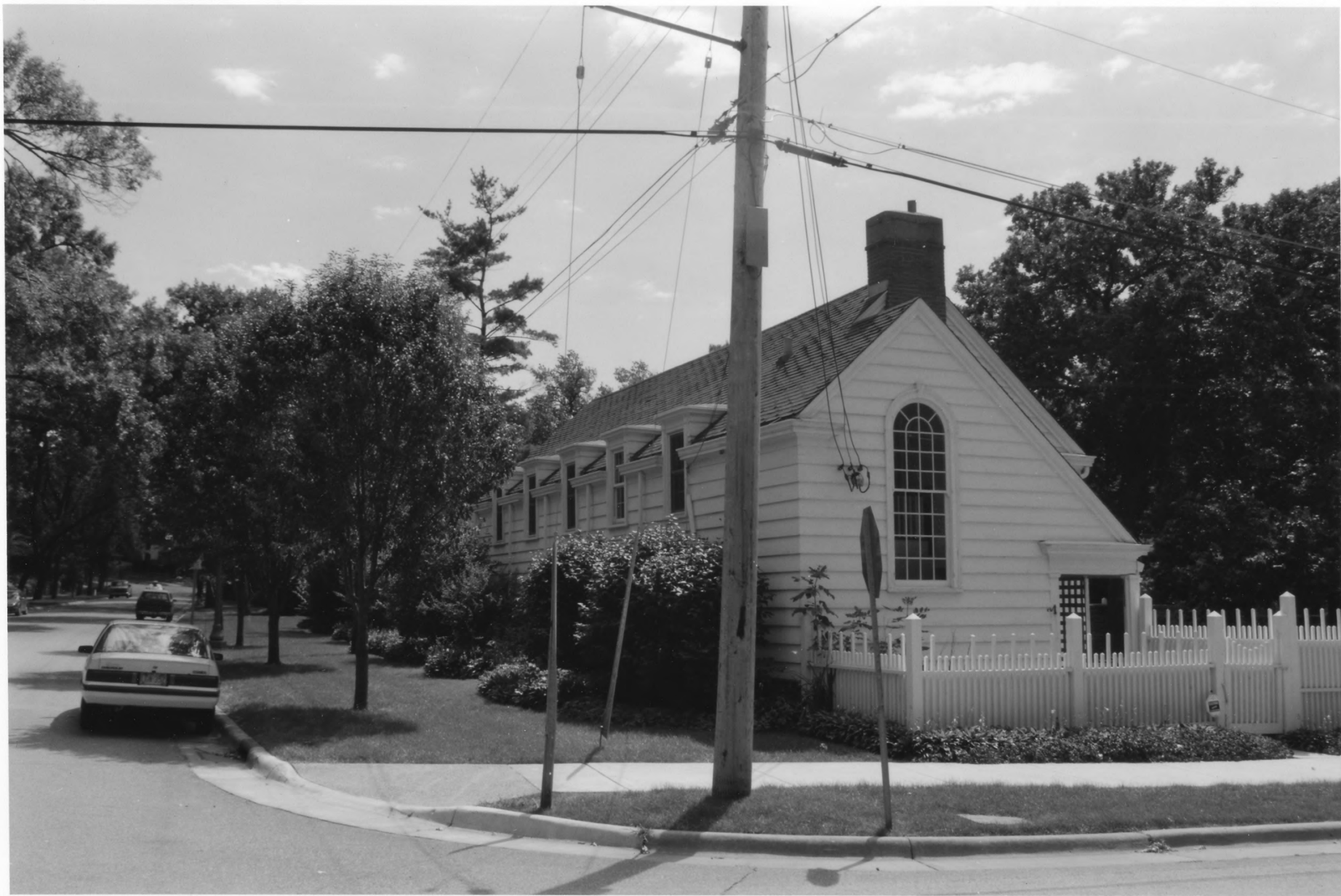
Edward and Markell Brooks Sr., House