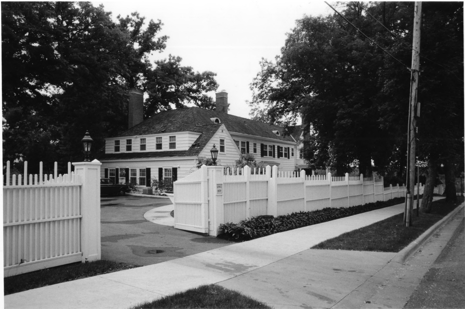
Edward and Markell Brooks Sr., House Ramsey Co., Mn 013481- 25A/26