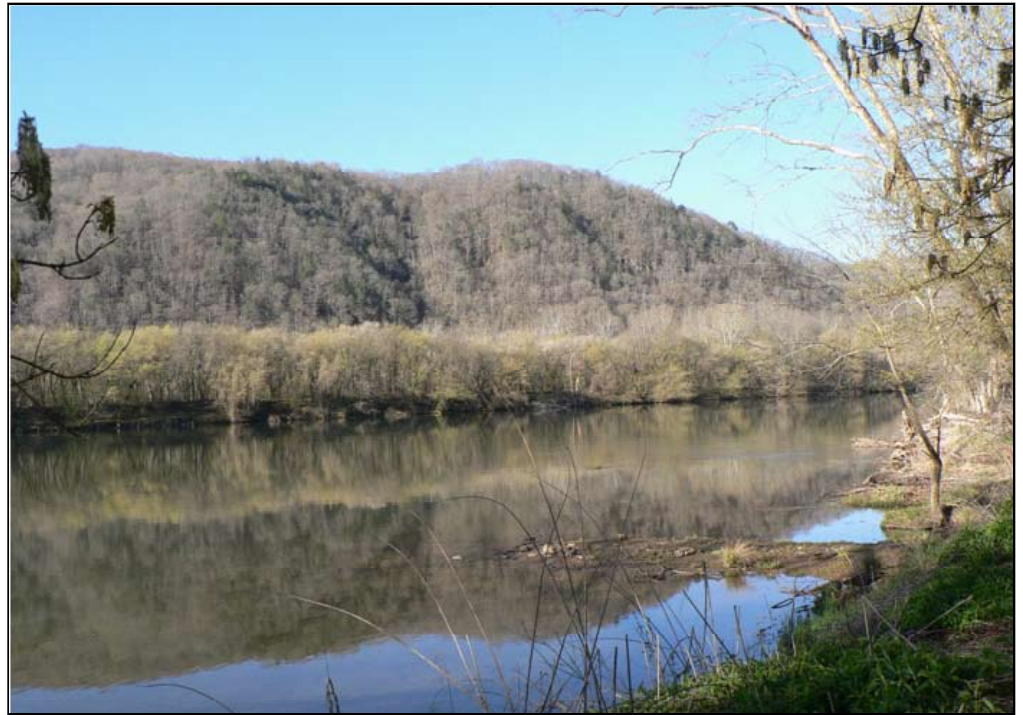
On the Great Eastern Trail

In 2009, the RTCA program helped the newly-formed Great Eastern Trail Association fill the 120-mile gap in the tri-state corner of West Virginia, Kentucky, and Virginia. The Great Eastern Trail (GET) is the newest long-distance hiking trail being created in the United States. It parallels the Appalachian National Scenic Trail, and will be about 1800-miles long. The GET runs from Alabama to New York, linking the Florida National Scenic Trail and the North Country National Scenic Trail. The Community Design Assistance Center at Virginia Tech partnered with the project, compiled the maps into an electronic GIS format, and prepared printed maps for review. A Trail Summit of 40 people from the 3 states was held in June, and succeeded with forming a consensus decision for a primary northern route through West Virginia, and a proposed southern loop. recently was annexed into the city to facilitate creation of two planned unit developments that will include trail systems in conformance with the newly created trails plan.