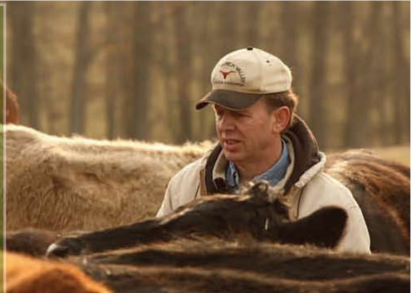
Rudolph Family Farms in Yellow Spring, West Virginia