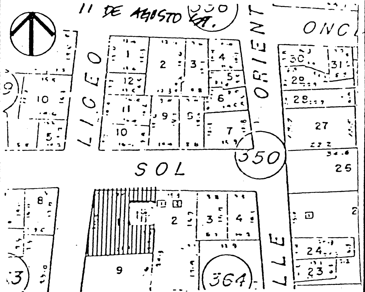
PLANO DE SITUACION