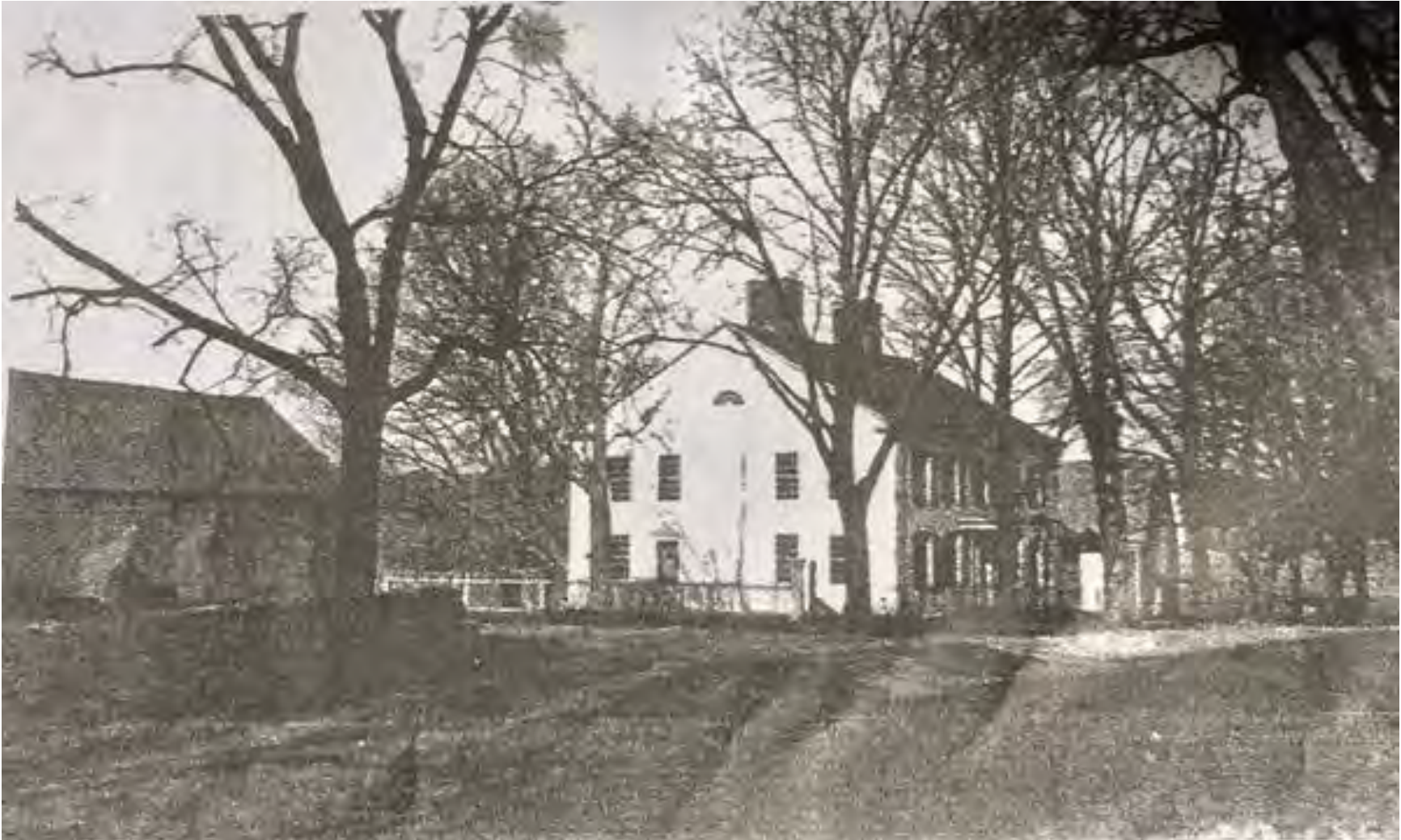
Figure 5 - Historic view looking north along Smith Ridge Road at the house, former outbuildings, and walls.