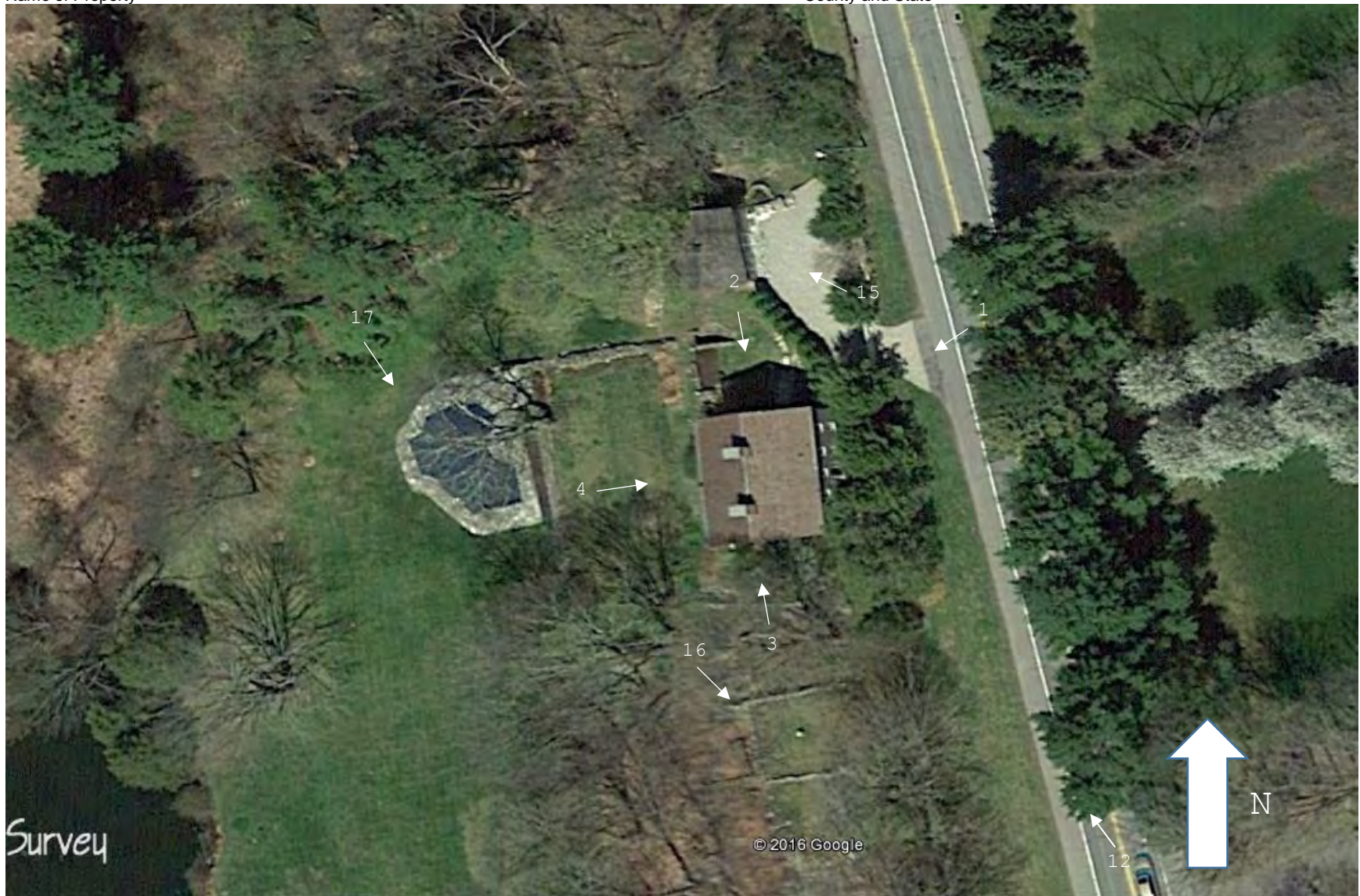
Figure 3. Exterior Photo Key -- Google Earth aerial photograph showing locations of photographs.