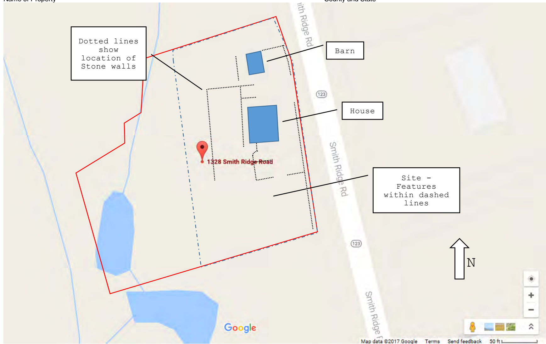
Figure 2. Site Plan -- Property boundary based on map Town of New Canaan assessor's data.