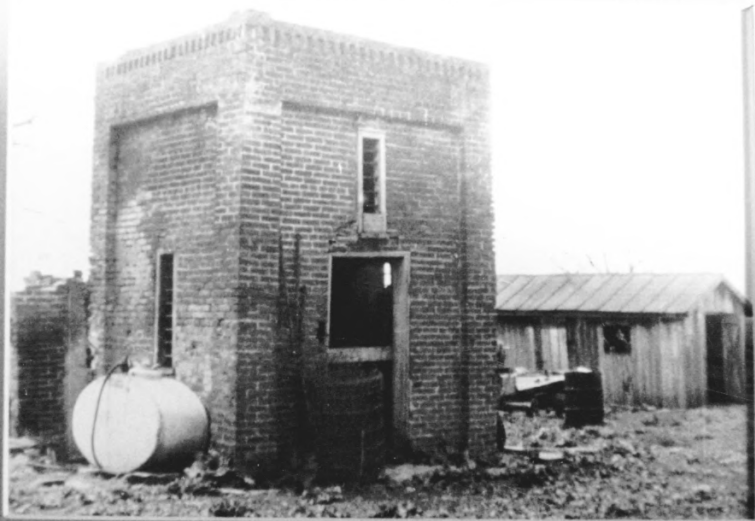
Slave jail situated behind Edgewood July, 1960. Razed 1964.