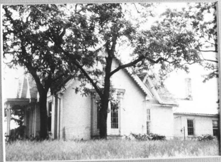
Edgewood showing the country kitchen still in tact. 1960.