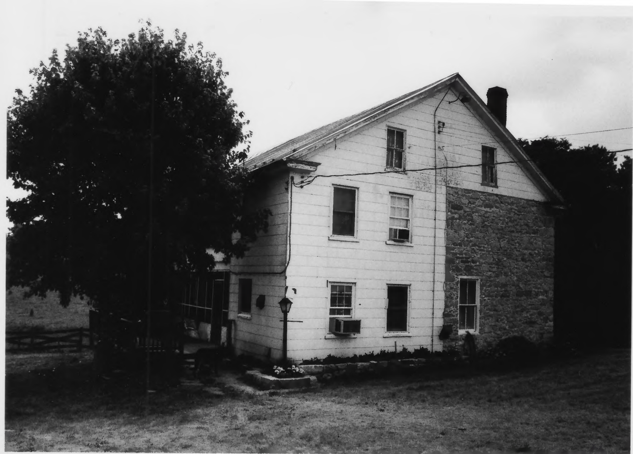
STRODE-MORRISON-TABLER HSE., Berkeley Co., WV