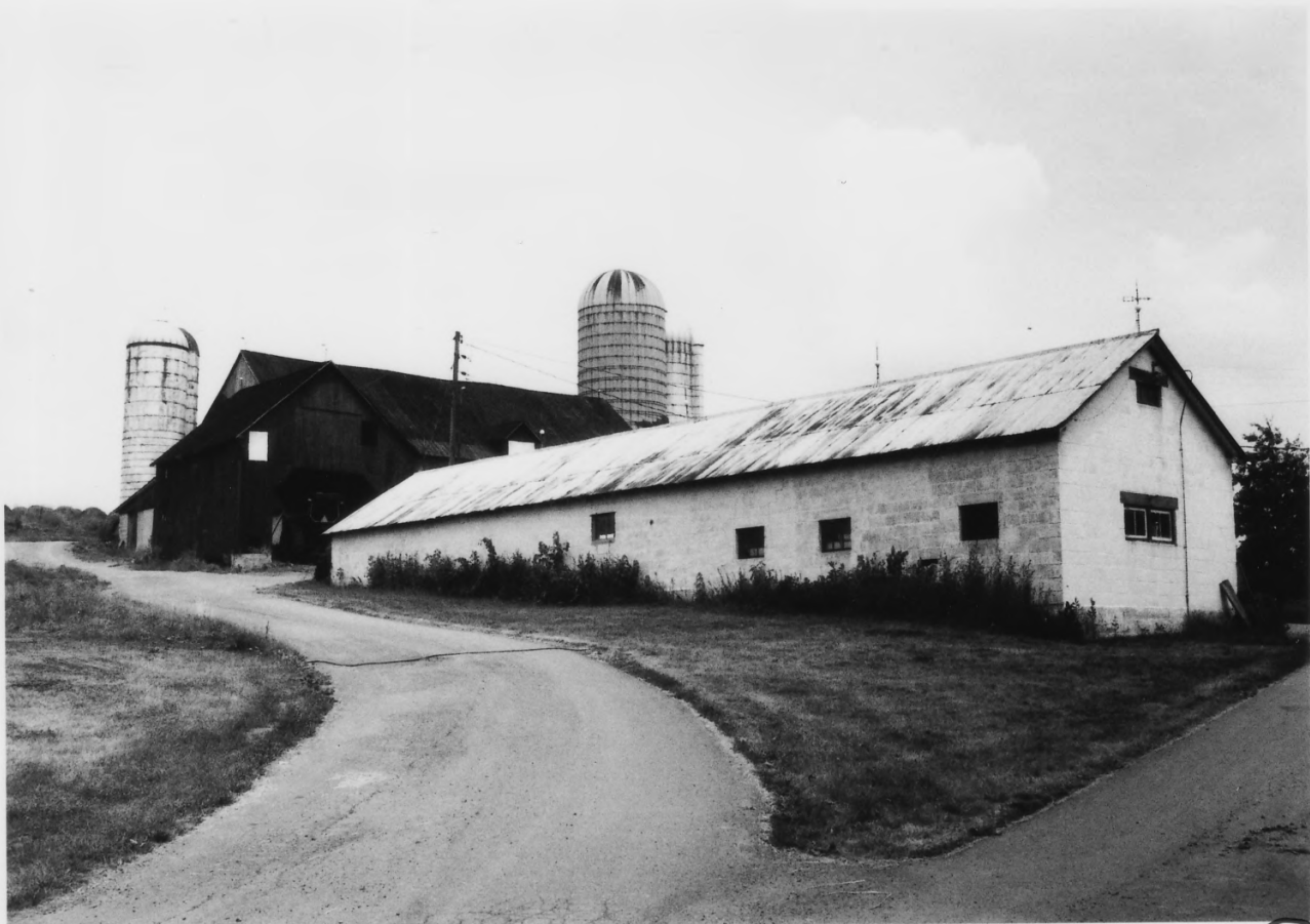
STRODE - MORRISON - TABLER HSE., Berkeley Co., WV