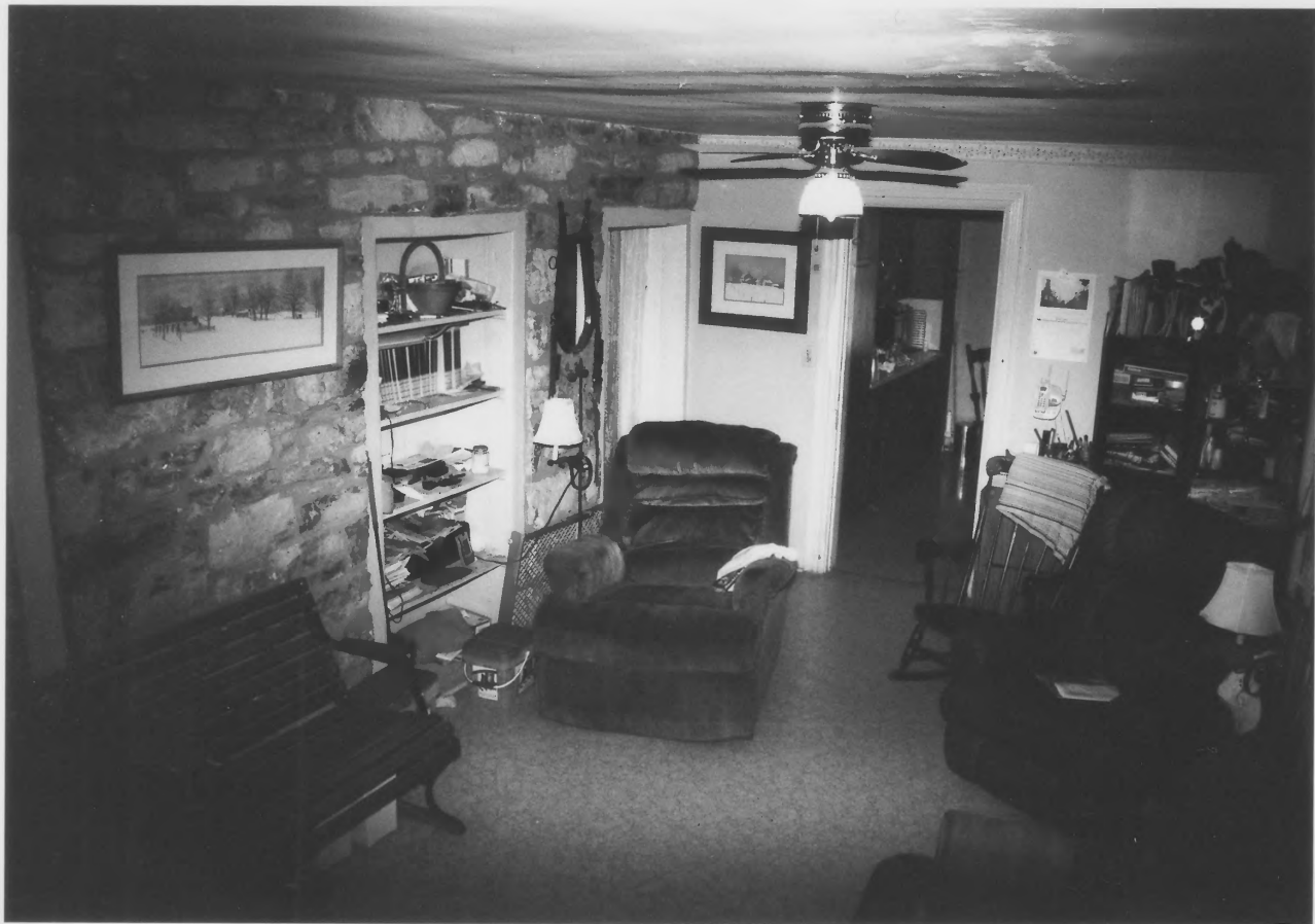
STRODE-MORRISON-TABLER HSE., Berkeley Co., WV