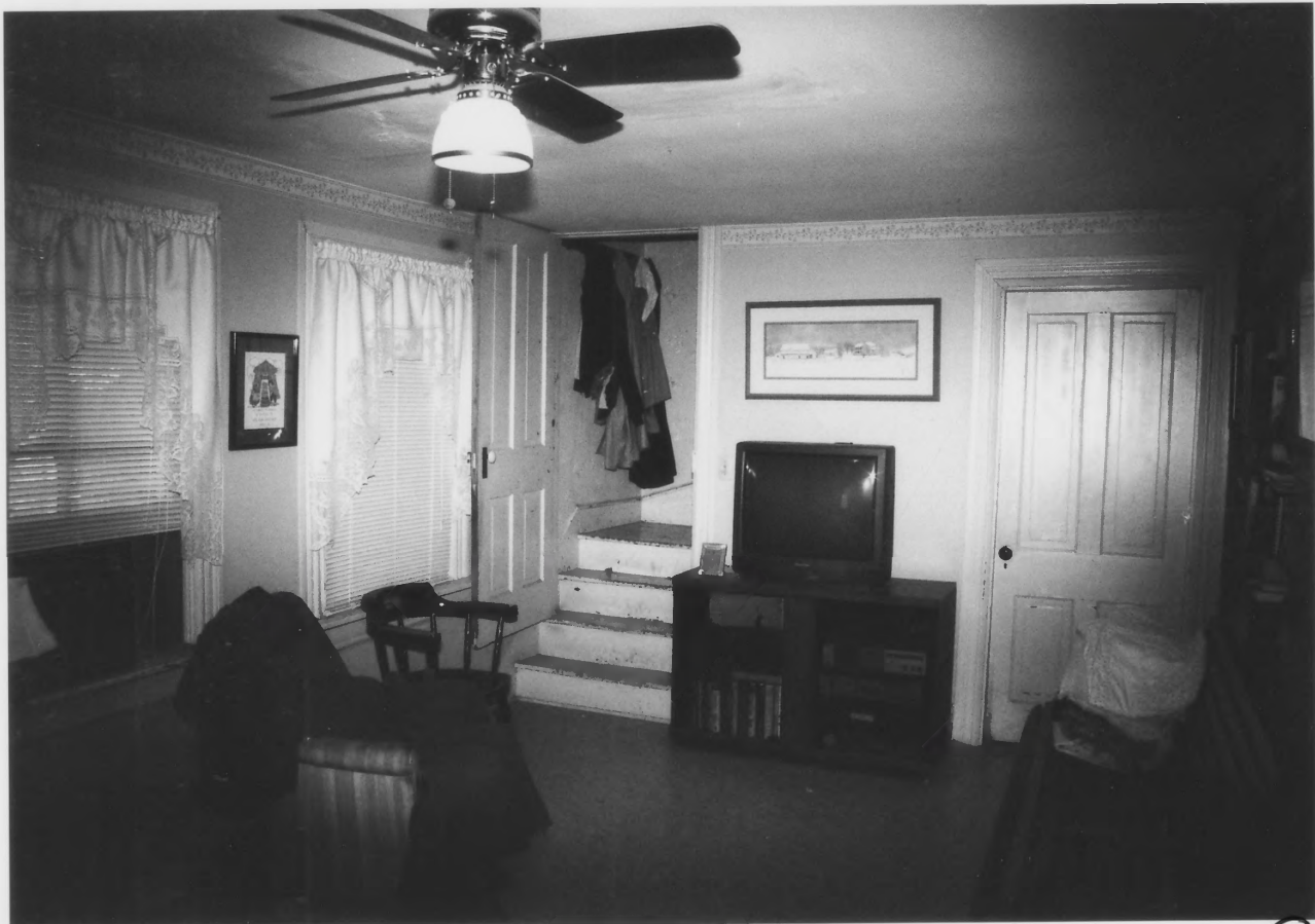
STRODE-MORRISON-TABLER HSE., Berkeley Co., WV