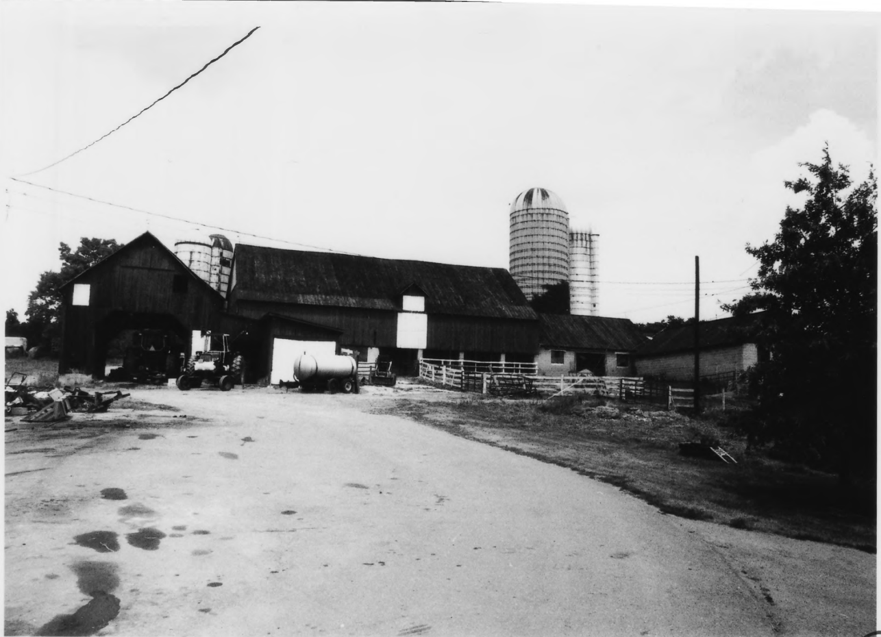
STRODE-MORRISON-TABLER HSE., BERKELEY CO., WV