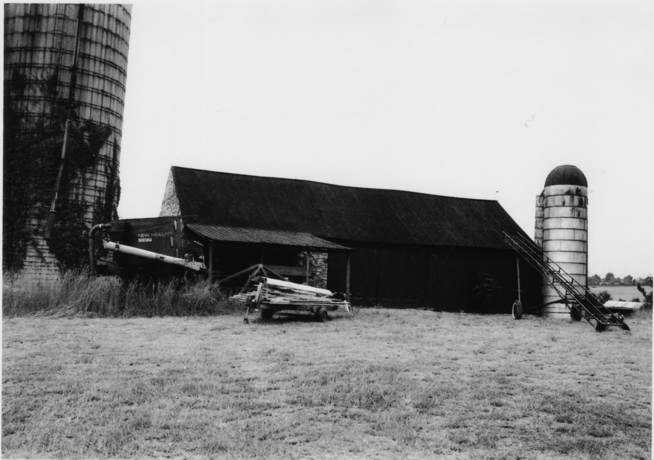
STRODE-MORRISON-TABLER HSE., Berkeley Co., WV