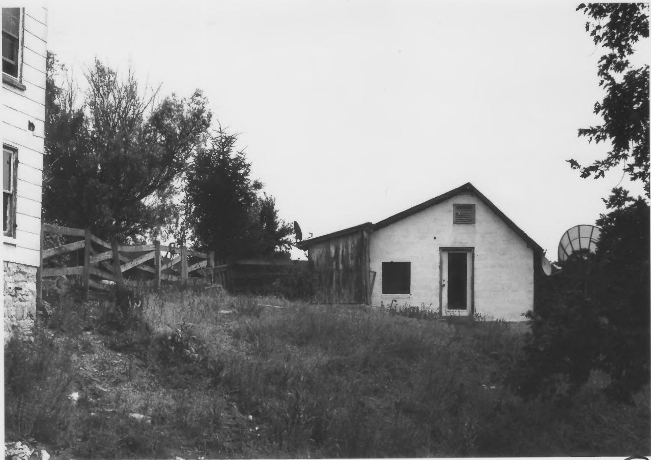
STRODE - MORKISON - TABLET. HSE., BERKELEY CO., WV