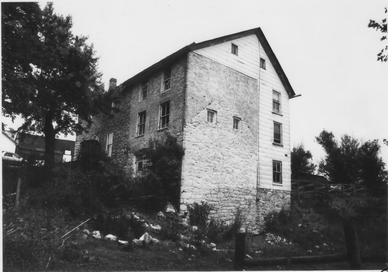
STRODE - MORRISON - TABLET HSE., Berkeley Co., WV