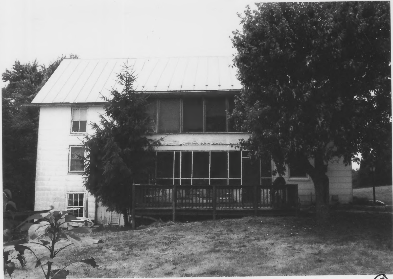
STRODE - MORRISON - TABLER HSE. , Berkeley Co. , WV