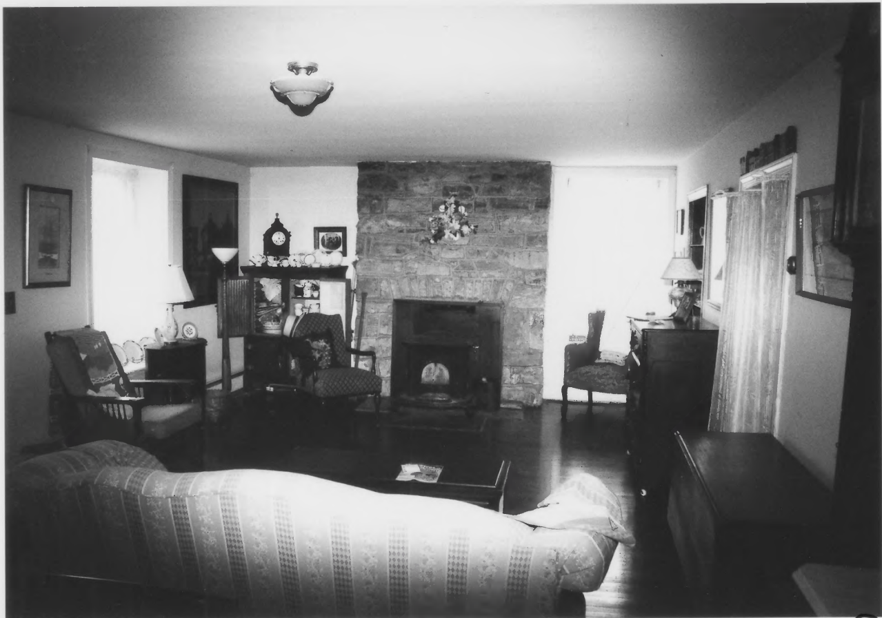
STRODE - MORRISON - TABLER HSE., Berkeley Co., WV