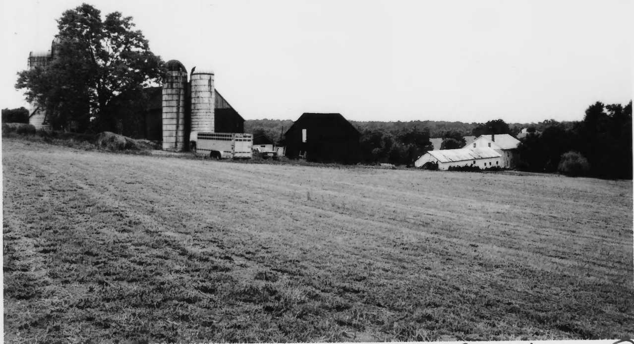
STRODE-MORRISON-TABLER+SE., Berkeley Co., WV