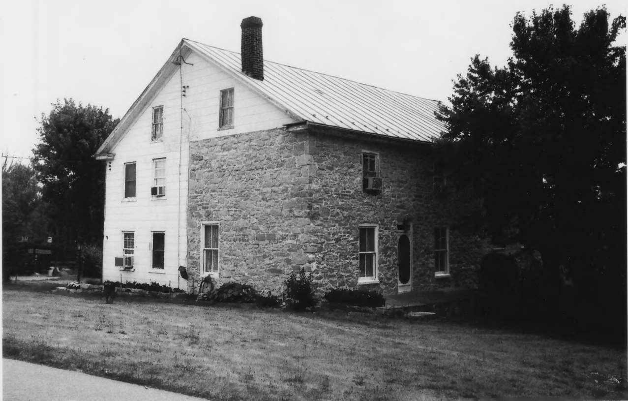
STRODE-MORRISON-TABLER HSE, Berkeley Co, WV