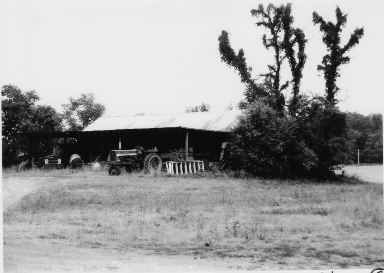
STRODE - MORRISON - TABLER HSE., BERKELEY CO., WV