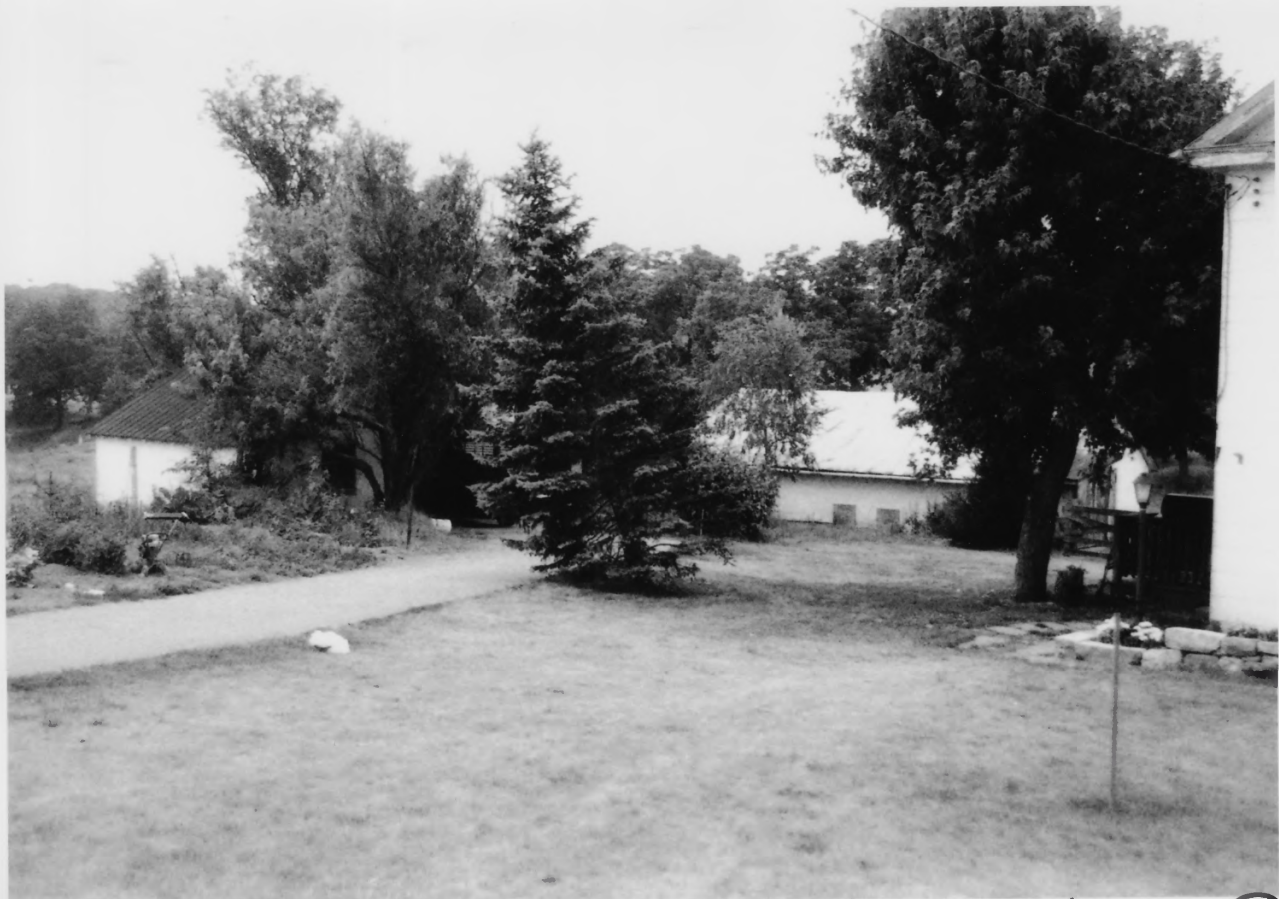
STRODE-MORRISON-TABLER HSE., Berkeley Co., WV