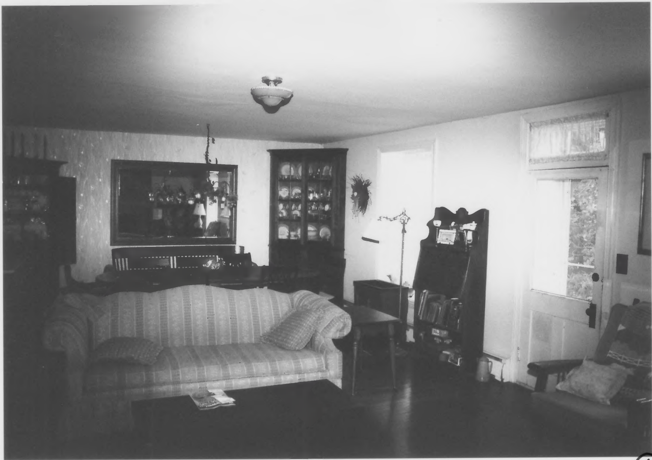
STRODE-MORRISON-TABLER HSE., BERKELEY CO., WV