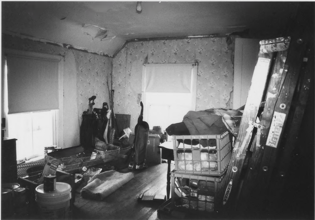
STRODE-MORRISON-TABLER HSE., Berkeley Co., WV