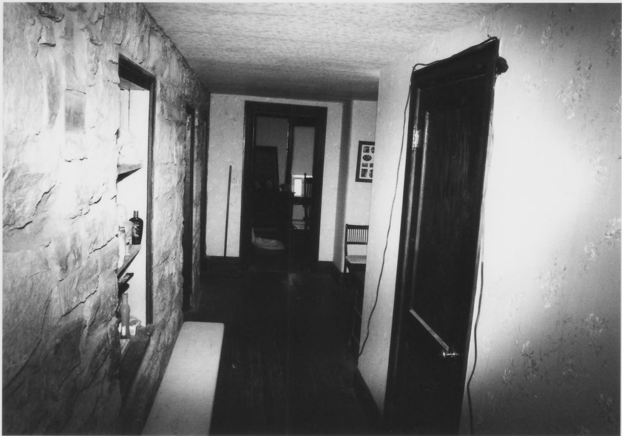
STRODE--MORRISON--TABLER HSE., Berkeley Co., WV