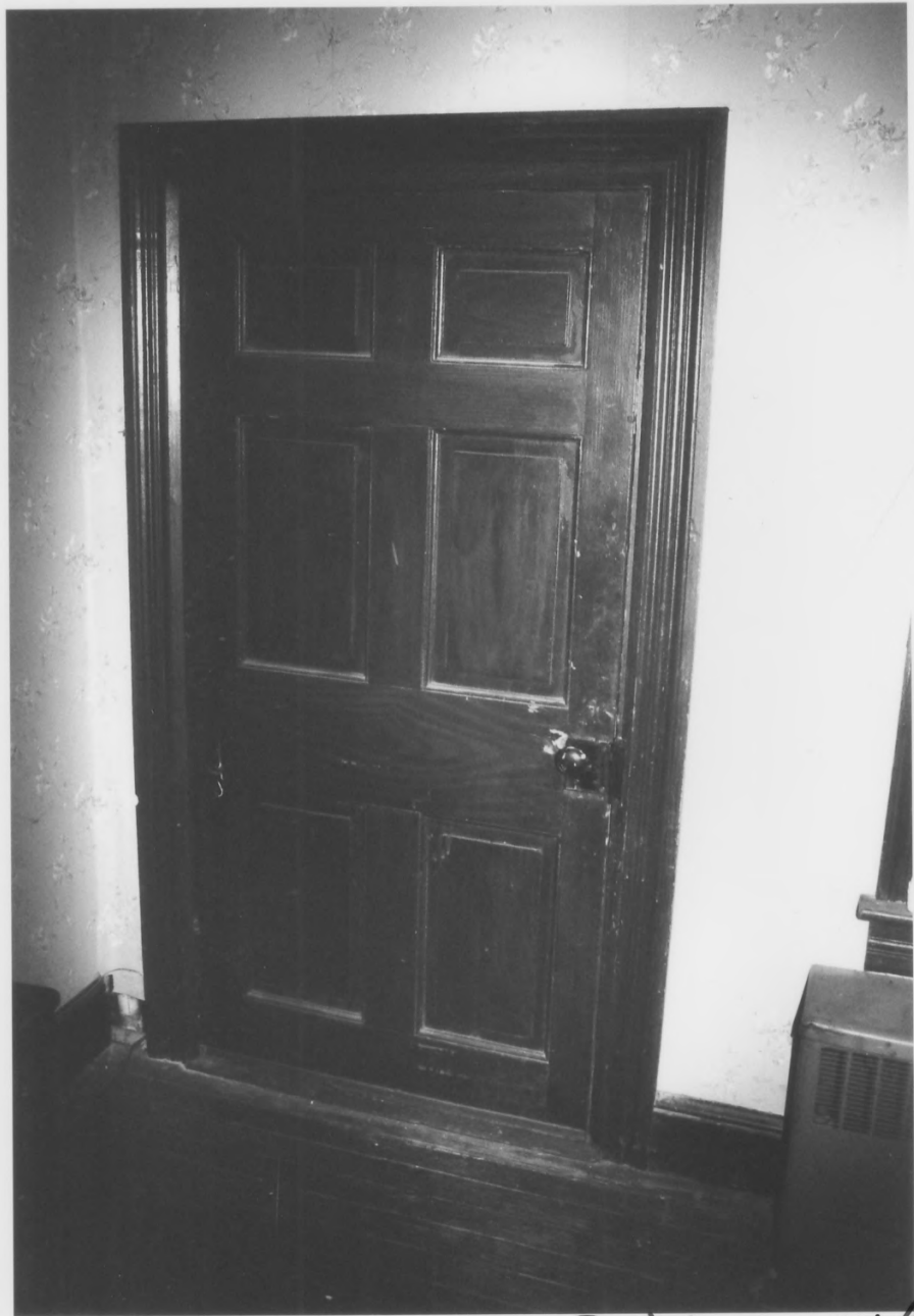
STODE-MORRISON-TABLER HSE., Berkeley Co., WV (P)