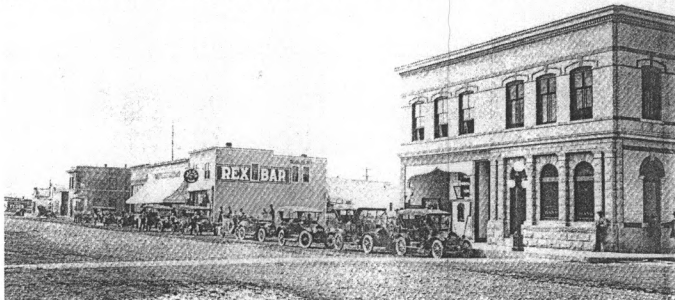
Main Street, Three Forks, West side looking South — 1912.